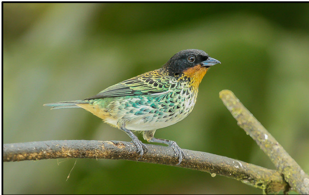
Rufous-throated Tanager, yet another beautiful tanager we hope to see in northern Ecuador.