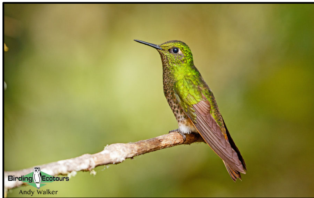
The feeders at San Isidro attract many hummingbirds such as Buff-tailed Coronet.