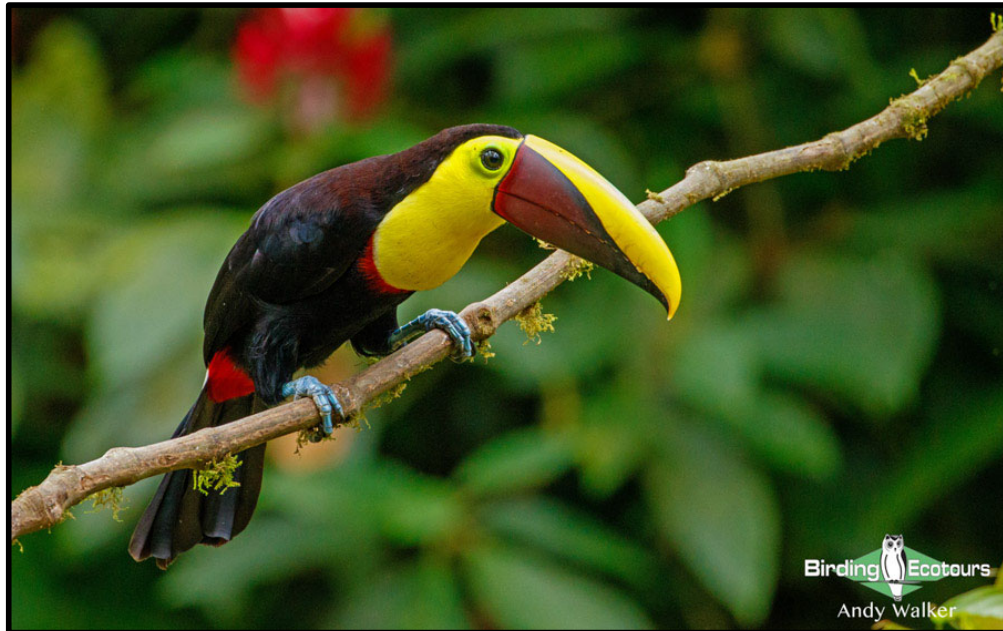
The outrageously colored Yellow-throated Toucan is often encountered on this tour.

Perhaps no other tour shows you such a large selection of classic and amazing Neotropical birds. During these 16 days we will look for Andean Condor , Andean Cock-of-the-rock , Giant Hummingbird , Torrent Duck , White-capped Dipper , Sunbittern , Sword-billed Hummingbird , Lyre-tailed Nightjar , Yellow-throated Toucan , Toucan Barbet , Choco Toucan , Plate-billed Mountain Toucan , Crimson-rumped Toucanet , Golden-collared Toucanet , Choco Trogon , Golden-headed Quetzal , Crested Quetzal , Scarlet-breasted Fruiteater , White-faced Nunbird , Powerful Woodpecker , Giant Conebill , Ocellated Tapaculo , Tanager Finch , Rufous-bellied Seedsnipe , and Oilbird .