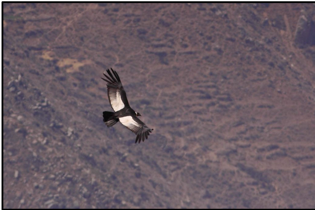
Andean Condor will be searched for in mountainous areas.

After a week on the western slope of the lower Andes we will climb up in elevation to the Antisana Ecological Reserve. The Antisana Volcano has a height of 5,704 meters (18,714 feet). The newly-formed Antisana Ecological Reserve was until recently a number of extensive ranches. Today it is a well-known nesting site for Andean Condor . We will enjoy a different birding day at high elevation, enjoying species such as Carunculated Caracara , Black-chested Buzzard-Eagle , Aplomado Falcon , Variable Hawk , Many-striped Canastero , Stout-billed Cinclodes , Chestnut-winged Cinclodes , Black-winged Ground Dove , Plumbeous Sierra Finch , Andean Lapwing , Silvery Grebe , Andean Coot , Andean Teal , Andean Gull , Andean Duck , Yellow-billed Pintail , Giant Hummingbird , and Ecuadorian Hillstar .