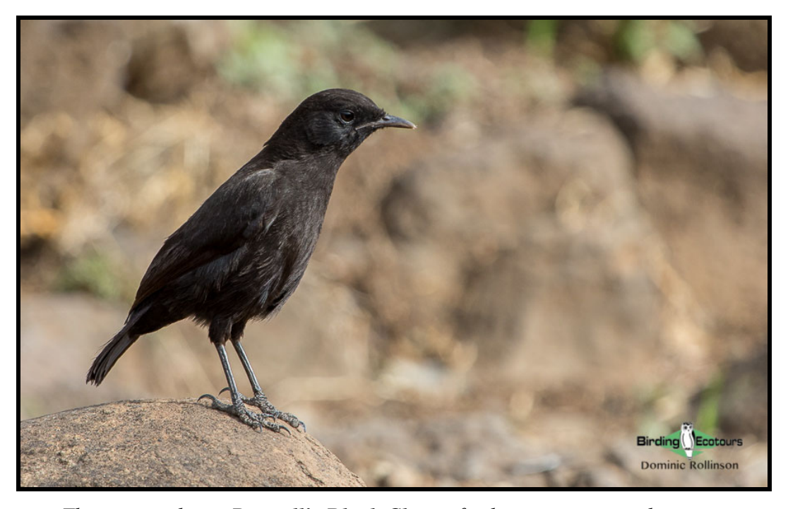
The near-endemic Rüppell's Black Chat is fairly common in rocky areas.