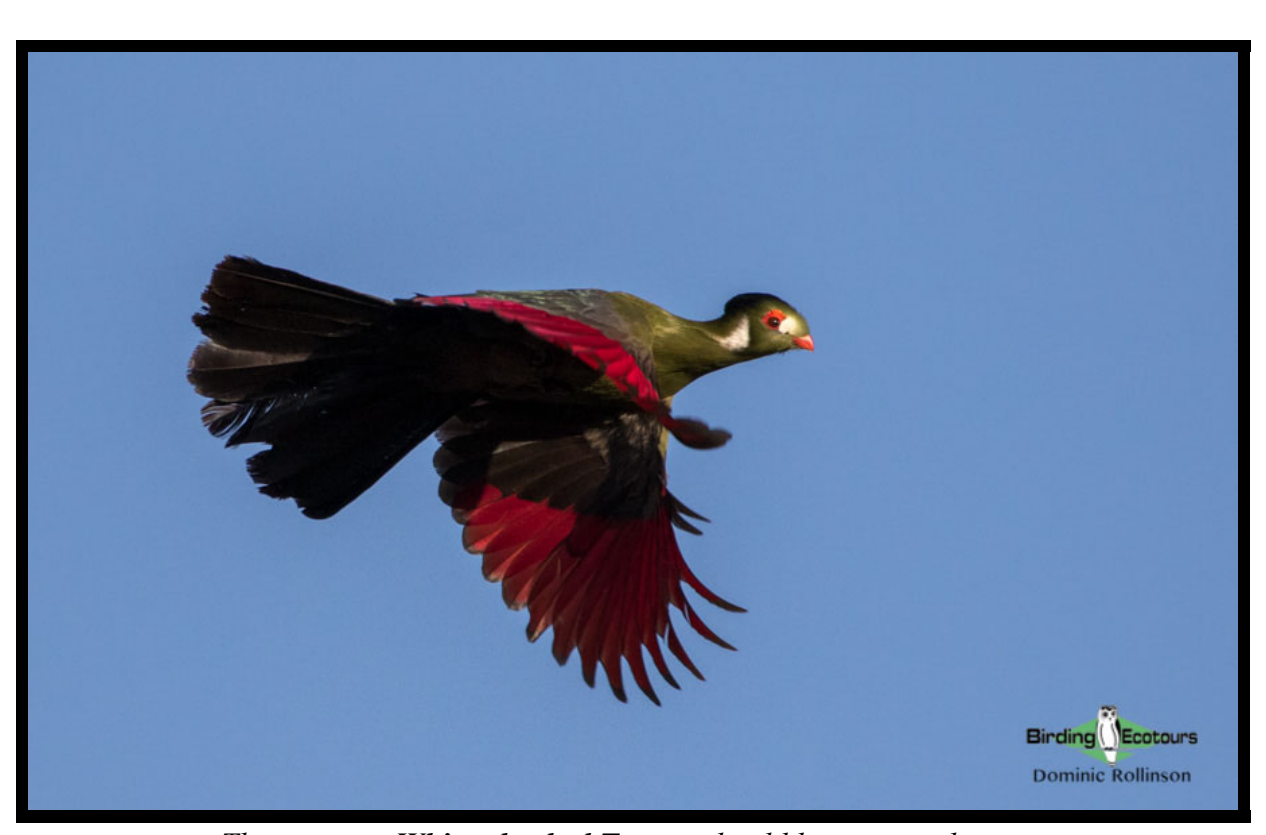
The stunning White-cheeked Turaco should be seen on this trip.