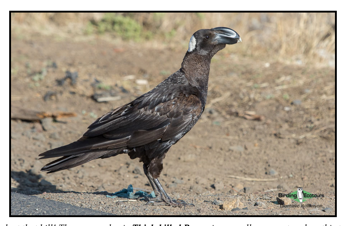
Look at that bill! The near-endemic Thick-billed Raven is normally encountered on this tour.