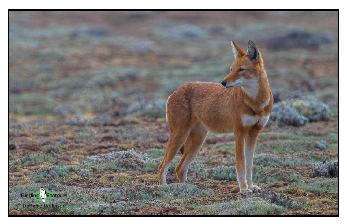
Ethiopian Wolf — the world's rarest canid should be seen on the Sanetti Plateau.

Ethiopia of course also boasts such fabulous mammals as Ethiopian Wolf, some awesome primates including Gelada and Hamadryas Baboons, and many others. The country also has a spectacularly rich and ancient history and all in all is a wonderful country to travel in.