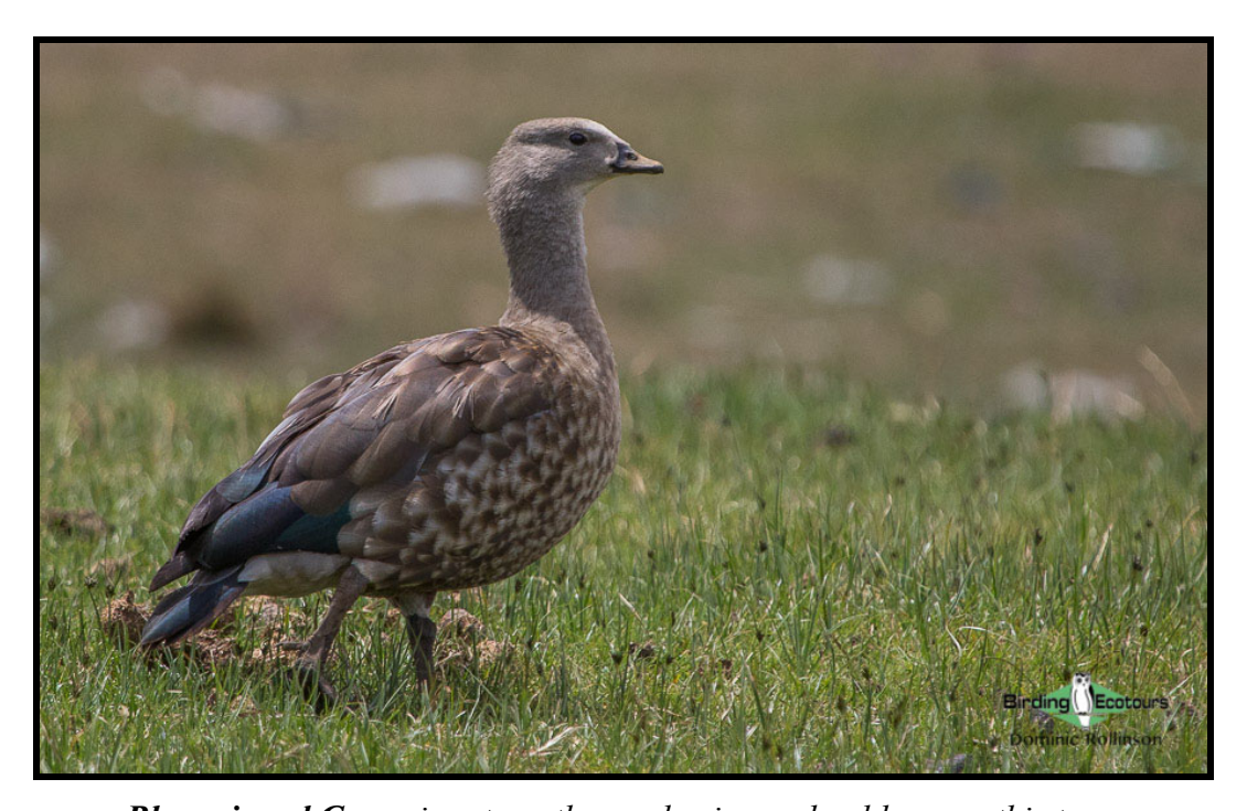
Blue-winged Goose is yet another endemic we should see on this tour.

As we leave Goba we soon reach nice stands of Juniper-Hagenia forest that are home to the endemic Abyssinian Woodpecker, White-backed Black Tit, Abyssinian Catbird, and Abyssinian Slaty Flycatcher, plus Abyssinian Ground Thrush. Driving further, stands of Hypericum trees host the endemic griseiventris subspecies of Brown Parisoma. Moorland and Chestnut-naped Francolins and Cinnamon Bracken Warbler frequent dense shrubbery, while Ethiopian Cisticola prefers the more open areas.