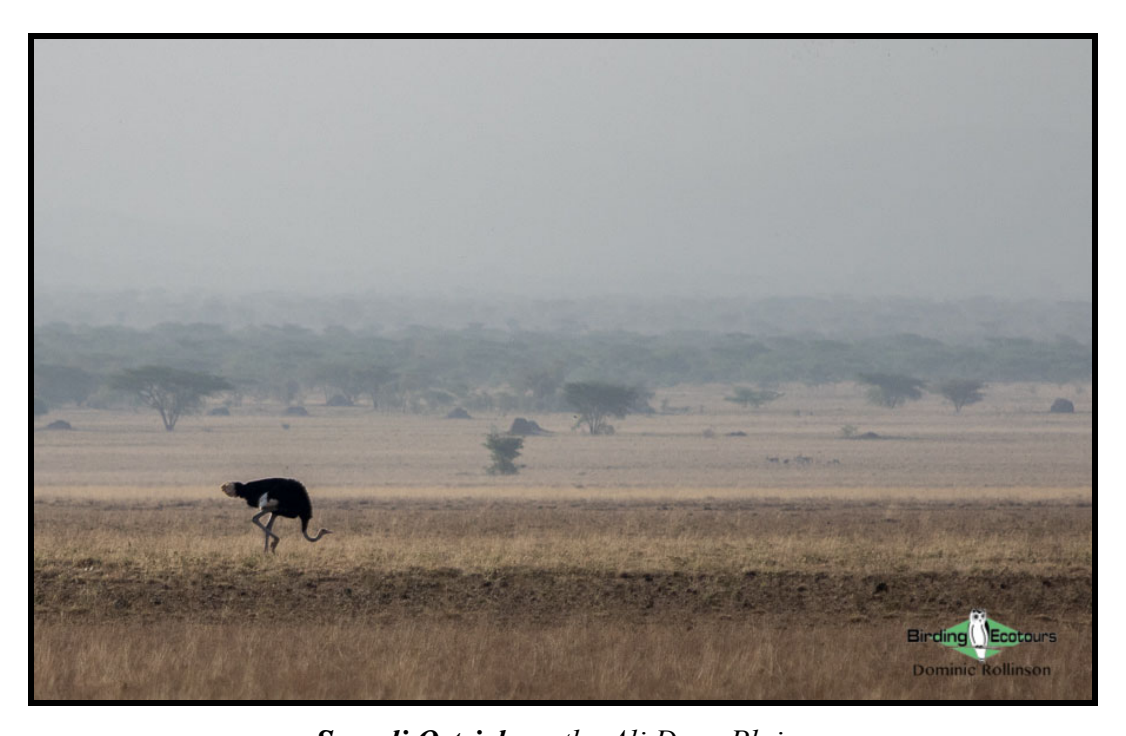
Somali Ostrich on the Ali Dege Plains

Overnight: Awash Falls Lodge, Awash National Park