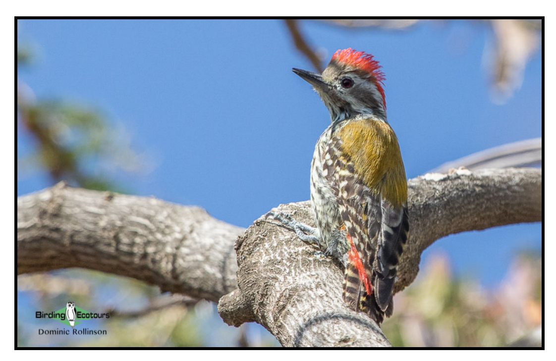
Abyssinian Woodpecker can take at times a bit of effort to find.