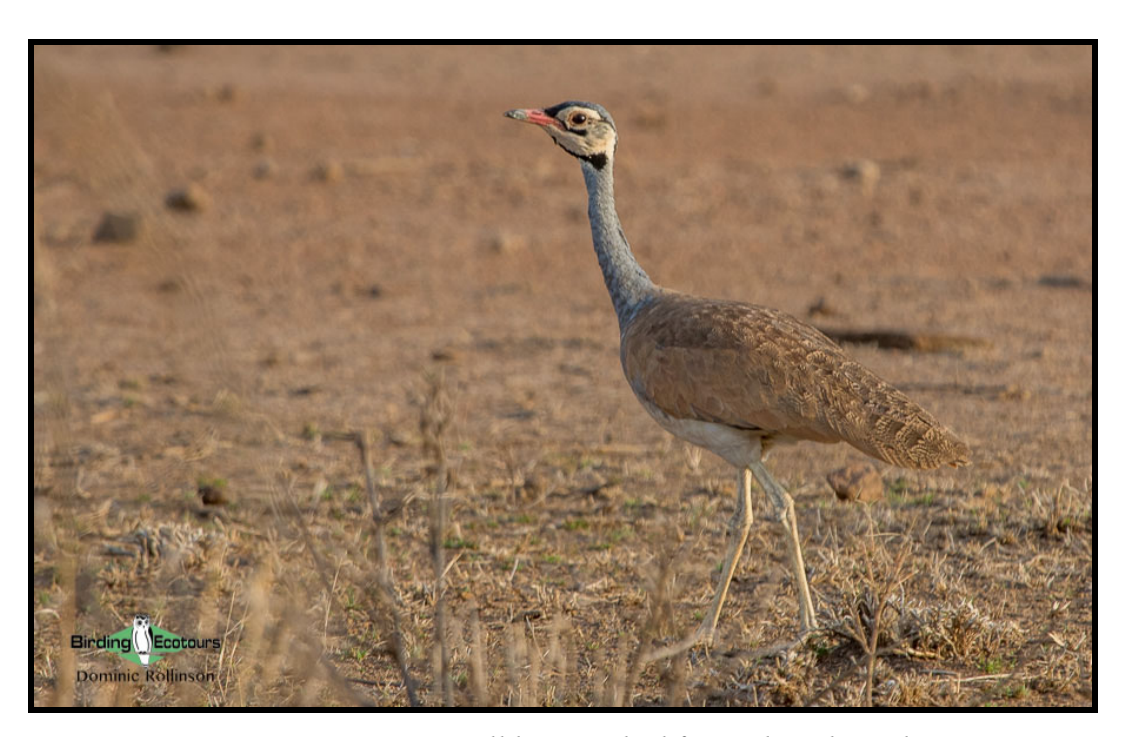
White-bellied Bustard will be searched for in the Liben Plains.