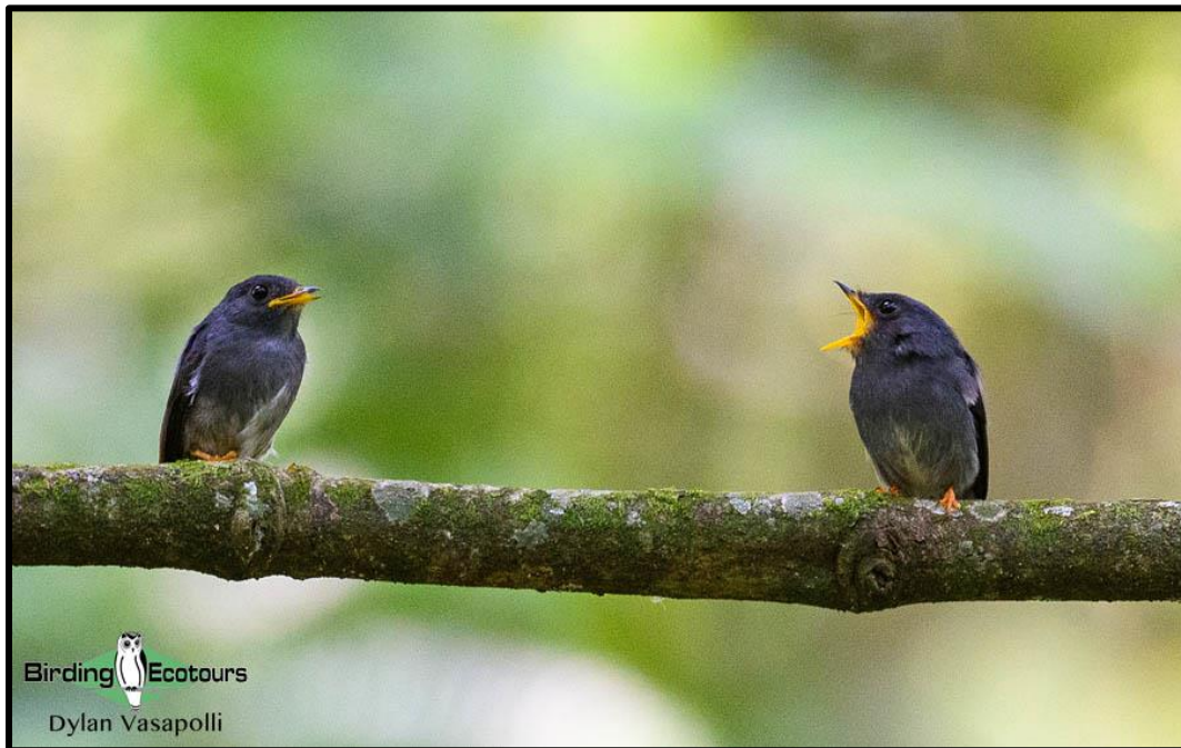
Yellow-footed Flycatcher is a scarce Central African species that is not easily seen anywhere.

Species that prefer the mid-strata and vine tangles coming down from the canopy include the sought-after Bare-cheeked Trogon , secretive Rufous-sided Broadbill , African Dwarf and Blue-breasted Kingfishers , Blue Malkoha , Fraser's Forest , Yellow-footed and Chestnut-capped Flycatchers , Bates's Paradise Flycatcher , Gabon Batis , Yellow-bellied and White-spotted Wattle-eyes , Western and Yellow-throated Nicators , Yellow-browed Camaroptera , Grey Longbill , the sought-after Gosling's Apalis , Maxwell's Black Weaver , and Crested , Blue-billed , Red-bellied and Cassin's Malimbres .