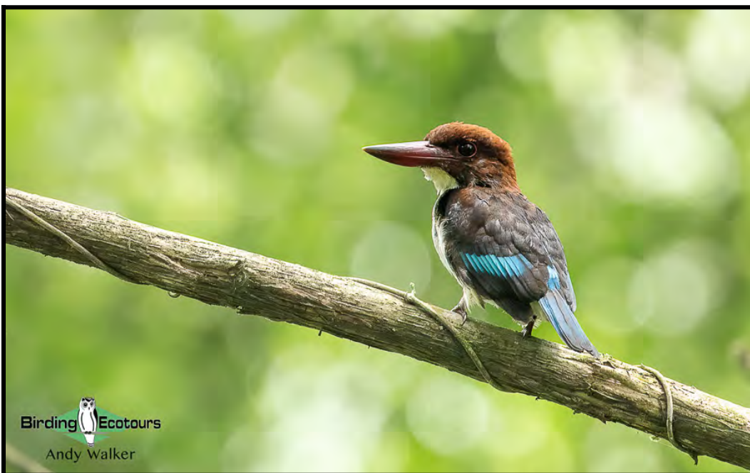
We will look for Chocolate-backed Kingfisher at Ankasa.