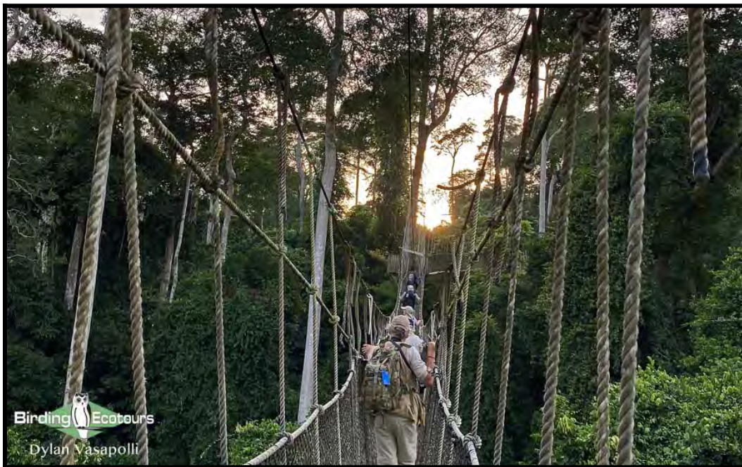
Sunrise on the canopy walkway in Kakum National Park provides unparalleled views.