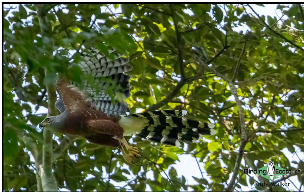
The highly sought-after (and very shy) Long-tailed Hawk can occasionally be seen from the Kakum canopy walkway.

casqued Hornbills (it's quite something to hear their amazingly heavy wingbeats), White-headed and Forest Wood Hoopoes , Rufous-crowned Eremomela , Chestnut-capped Flycatcher , Sharpe's Apalis , West African Batis and a host of other tantalizing West African birds. Ussher's Flycatcher are always present as they hawk insects from the wires keeping the walkway upright.