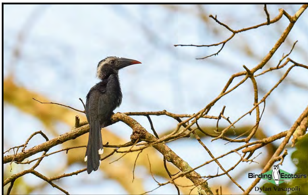
Black Dwarf Hornbill is a scarce resident in the Bobiri Butterfly Reserve.

Overnight: Royal Basin Resort (or similar), Kumasi