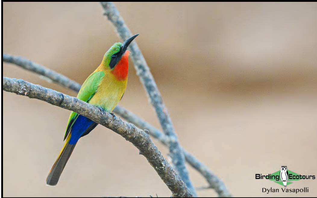
Delightful Red-throated Bee-eaters are abundant in Mole National Park.

The wetland in front of our hotel regularly brings in African Elephants (along with other mammals including Roan Antelope ), and often has a wide range of birds, including African Openbill and Senegal Thick-knee in attendance. Many raptors can also be sought in the park, and we'll be sure to keep an eye out for Beaudouin's Snake Eagle , Western Banded Snake Eagle , White-headed Vulture , Bateleur and the dry-country specialist, Grasshopper Buzzard . Our night time searches for Standard-winged Nightjar are also likely to produce other night birds, and in particular, we'll keep an eye out for African Scops and Northern White-faced Owls and Greyish Eagle-Owl , along with Long-tailed Nightjar .