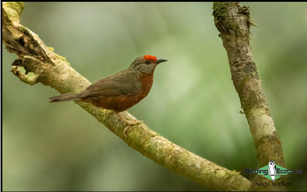
Red-fronted Antpecker is a tough and highly desired forest dweller.