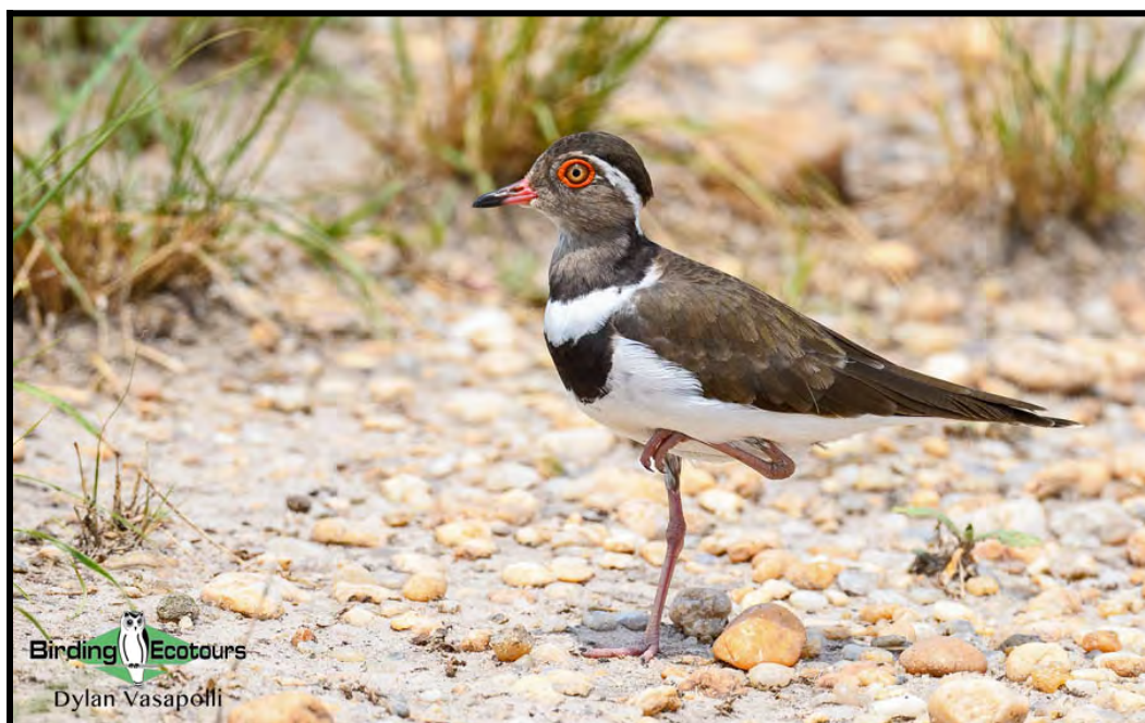
Forbes's Plover is a special of equatorial West Africa, occurring on the dry plains in Mole.

We will be sure to spend some time birding the more mature wooded areas, both around the hotel, and further afield. Core of our targets in this environment will be the scarce African Spotted Creeper (more of a miombo woodland bird in southern Africa), White-fronted Black Chat , the difficult trio of Emin's Shrike , and Rufous and Dorst's Cisticolas , along with Fine-spotted Woodpecker , White-crested Helmetshrike , White-breasted Cuckooshrike and Brown-rumped Bunting . More common and beautiful species also abound, and we're likely to see Red-throated Bee-eater , Bearded Barbet , Grey-headed Kingfisher , African Golden Oriole , the extravagant Long-tailed Glossy Starling , White-crowned Robin-Chat , both Pygmy and Beautiful Sunbirds (with their extravagantly long tails) and a number of colorful finches including Red-winged Pytilia , Orange-cheeked and Lavender Waxbills , Black-faced and Bar-breasted Firefinches and if we're lucky an Exclamatory Paradise Whydah .