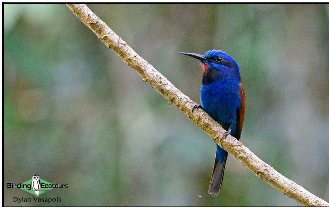
The scarce Blue-moustached Bee-eater occurs in the Atewa Range forests.

We set off early to maximize the cooler hours of the day, as we embark on a full day hike up the Atewa Range. Note that this is a challenging hike, both in distance covered and terrain. This hike takes us through varying degrees of forest habitat; first we start off with more open, forest edge habitat, before we gradually ascend into much taller and more mature stands of forest. The more mature stands of forest hold such prized specials as Nimba and Tessmann's Flycatchers , and the scarce Yellow-footed Honeyguide . We will also seek out the stunning Blue-moustached Bee-eater , arguably the best site in the country for this bird, along with Yellow-throated Cuckoo , Chocolate-backed Kingfisher , Red-cheeked Wattle-eye , Kemp's Longbill , Violet-backed Hyliota , Finsch's Rufous Thrush and White-tailed Alethe .