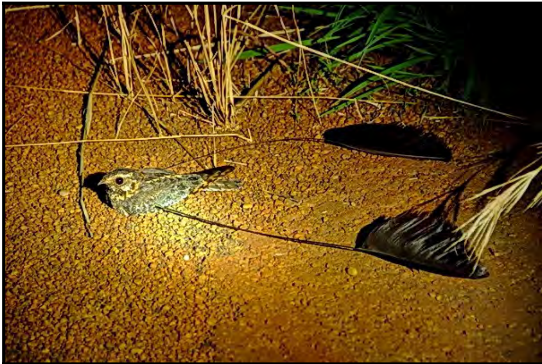
Ghana must rank as one of the best countries to find the incredible Standard-winged Nightjar.

Ghana certainly has a wide range of different habitats, and we look not only for forest birds at sites including one of Africa’s most impressive canopy walkways in Kakum National Park , but we also look for some charismatic arid-area birds. We ensure we have several days to spend exploring the mosaic of open wooded savannas of the fabulous Mole National Park . This is the country’s premier wildlife reserve, and megafauna like African Elephant are a regular feature (often bathing at the pools visible in front of our hotel). We also dip our toes into the Sahel zone (and some of its specials) up on the White Volta River along the border with Burkino Faso. Both Standard-winged Nightjar and the incomparable Egyptian Plover are other highly-desirable and major targets on this tour that is likely to feature a further 400 species of birds.