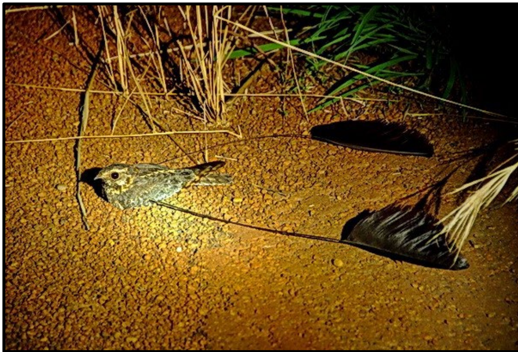
Ghana must rank as one of the best countries to find the incredible Standard-winged Nightjar.

Ghana certainly has a wide range of different habitats, and we look not only for forest birds at sites including one of Africa’s most impressive canopy walkways in Kakum National Park , but we also look for some charismatic arid-area birds. We ensure we have several days to spend exploring the mosaic of open wooded savannas of the fabulous Mole National Park . This is the country’s premier wildlife reserve, and megafauna like African Elephant are a regular feature (often bathing at the pools visible in front of our hotel). We also dip our toes into the Sahel zone (and some of its specials) up on the White Volta River along the border with Burkino Faso. Both Standard-winged Nightjar and the incomparable Egyptian Plover are other highly-desirable and major targets on this tour that is likely to feature a further 400 species of birds.