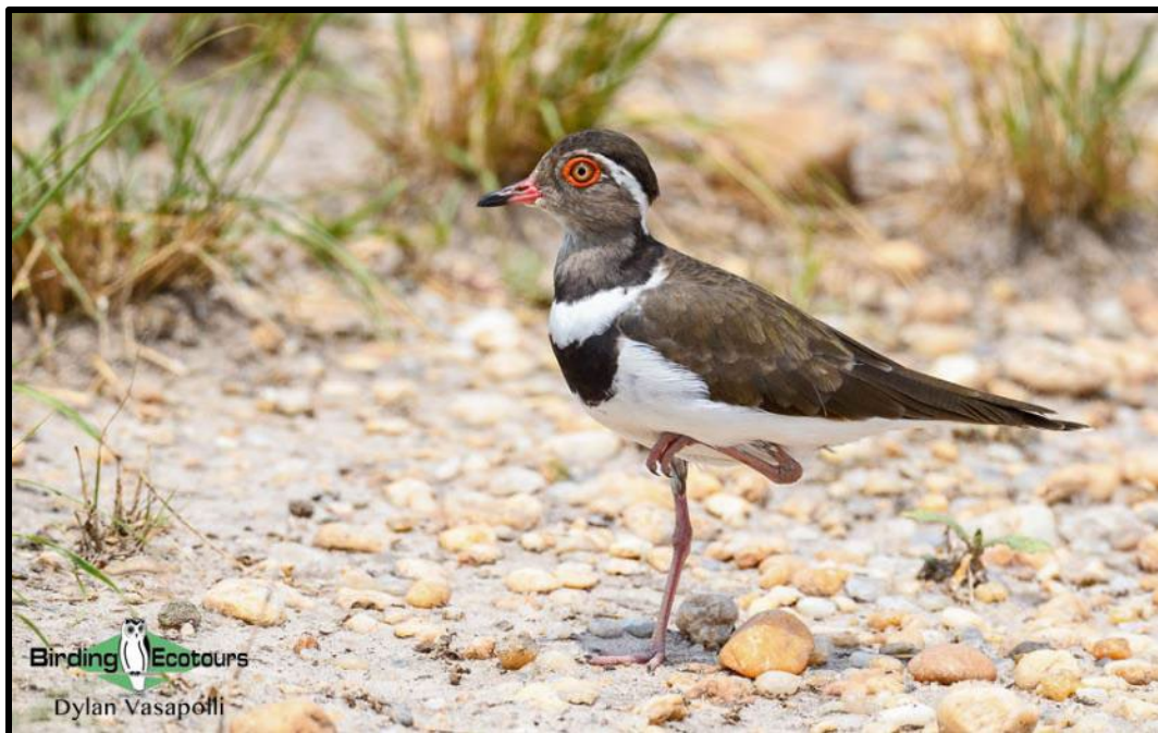
Forbes's Plover is a special of equatorial West Africa, occurring on the dry plains in Mole.

We will be sure to spend some time birding the more mature wooded areas, both around the hotel, and further afield. Core of our targets in this environment will be the scarce African Spotted Creeper (more of a miombo woodland bird in southern Africa), White-fronted Black Chat , the difficult trio of Emin's Shrike , and Rufous and Dorst's Cisticolas , along with Fine-spotted Woodpecker , White-crested Helmetshrike , White-breasted Cuckooshrike and Brown-rumped Bunting . More common and beautiful species also abound, and we're likely to see Red-throated Bee-eater , Bearded Barbet , Grey-headed Kingfisher , African Golden Oriole , the extravagant Long-tailed Glossy Starling , White-crowned Robin-Chat , both Pygmy and Beautiful Sunbirds (with their extravagantly long tails) and a number of colorful finches including Red-winged Pytilia , Orange-cheeked and Lavender Waxbills , Black-faced and Bar-breasted Firefinches and if we're lucky an Exclamatory Paradise Whydah .