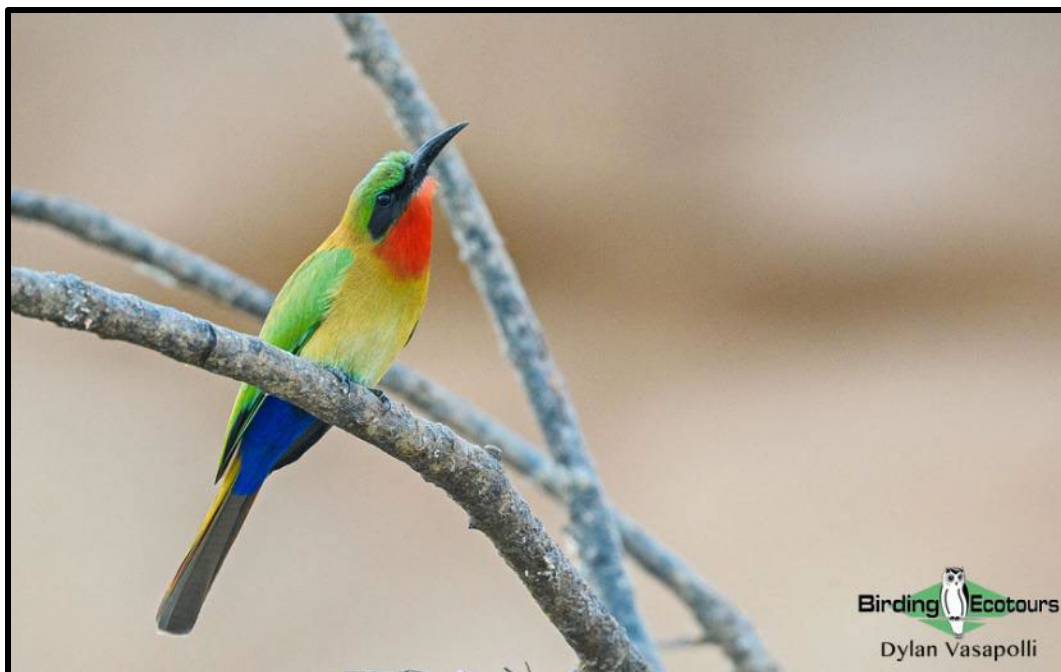
Delightful Red-throated Bee-eaters are abundant in Mole National Park.

The wetland in front of our hotel regularly brings in African Elephants (along with other mammals including Roan Antelope ), and often has a wide range of birds, including African Openbill and Senegal Thick-knee in attendance. Many raptors can also be sought in the park, and we'll be sure to keep an eye out for Beaudouin's Snake Eagle , Western Banded Snake Eagle , White-headed Vulture , Bateleur and the dry-country specialist, Grasshopper Buzzard . Our night time searches for Standard-winged Nightjar are also likely to produce other night birds, and in particular, we'll keep an eye out for African Scops and Northern White-faced Owls and Greyish Eagle-Owl , along with Long-tailed Nightjar .