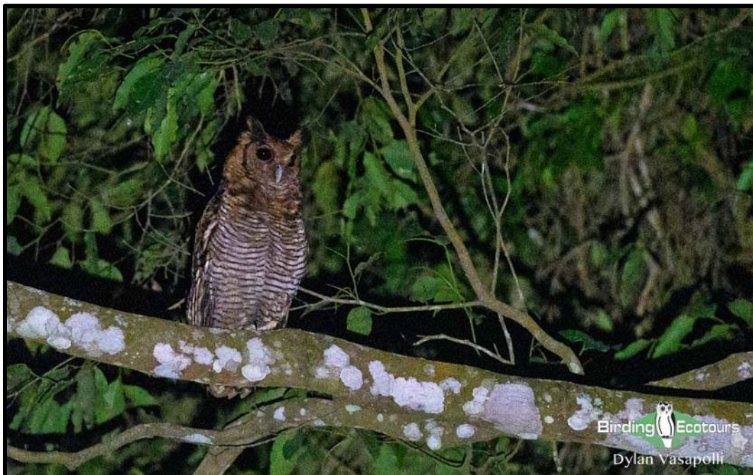
Night time searches will hopefully turn up the scarce Akun and Fraser's (pictured) Eagle-Owls .