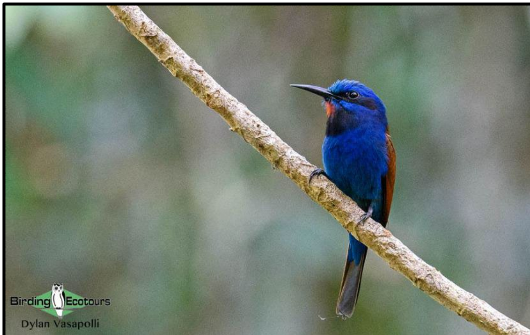
The scarce Blue-moustached Bee-eater occurs in the Atewa Range forests.

We set off early to maximize the cooler hours of the day, as we embark on a full day hike up the Atewa Range. Note that this is a challenging hike, both in distance covered and terrain. This hike takes us through varying degrees of forest habitat; first we start off with more open, forest edge habitat, before we gradually ascend into much taller and more mature stands of forest. The more mature stands of forest hold such prized specials as Nimba and Tessmann's Flycatchers , and the scarce Yellow-footed Honeyguide . We will also seek out the stunning Blue-moustached Bee-eater , arguably the best site in the country for this bird, along with Yellow-throated Cuckoo , Chocolate-backed Kingfisher , Red-cheeked Wattle-eye , Kemp's Longbill , Violet-backed Hylia , Finsch's Rufous Thrush and White-tailed Alethe .