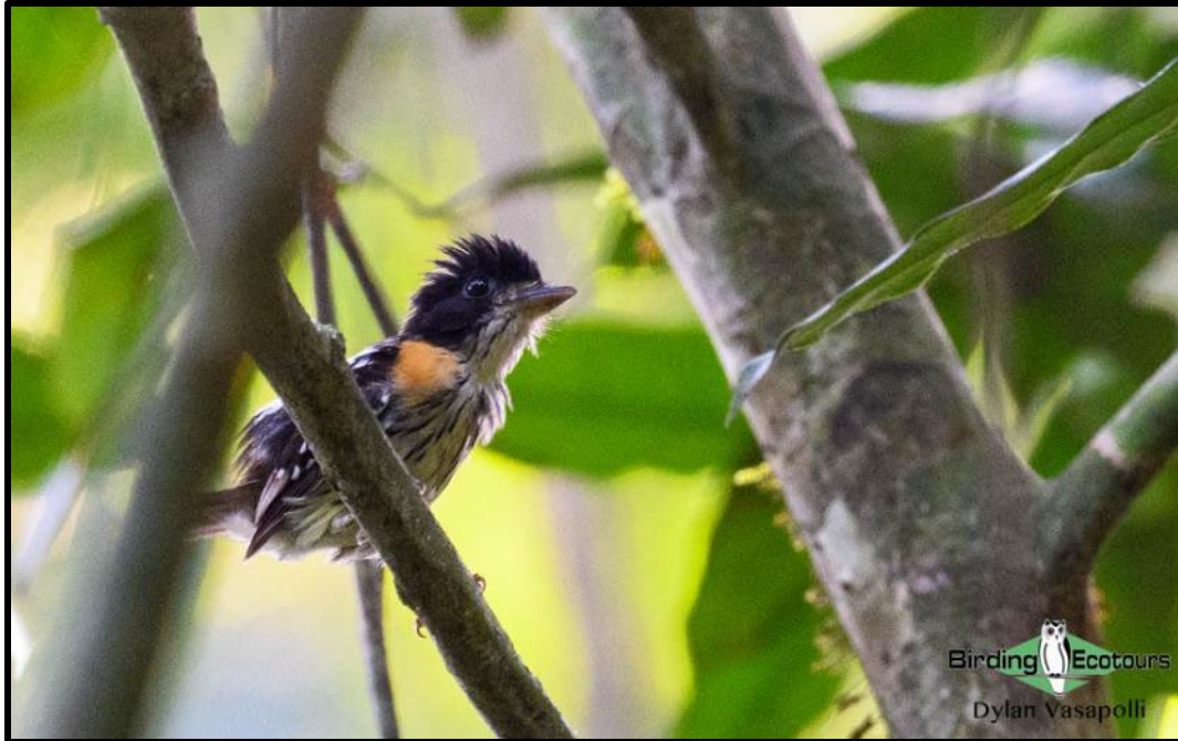
Watching a Rufous-sided Broadbill displaying is a highlight in the forests of Ghana.