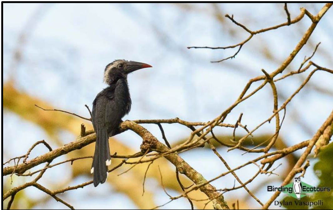
Black Dwarf Hornbill is a scarce resident in the Bobiri Butterfly Reserve.

Overnight: Royal Basin Resort (or similar), Kumasi