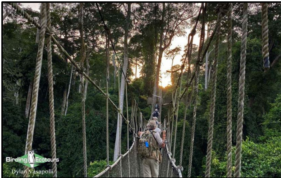
Sunrise on the canopy walkway in Kakum National Park provides unparalleled views.