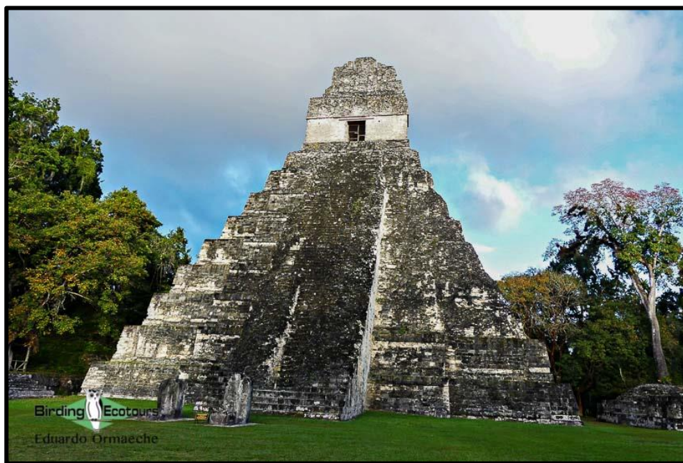
Tikal temples surrounded by Central American rainforest.