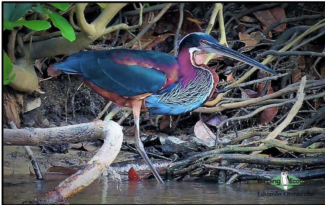
Agami Heron can be seen at Las Guacamayas Biological Station.

Overnight: Las Guacamayas Biological Station