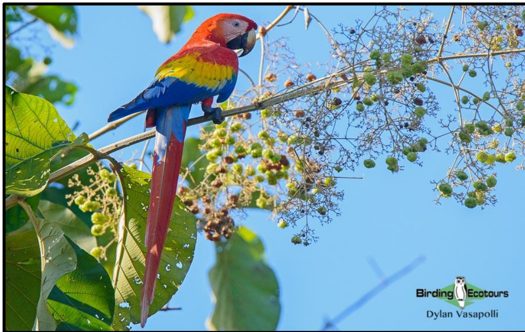
Scarlet Macaw seen at Las Guacamayas station.

We will have a domestic flight to Flores in northeast Guatemala, and be met by our ground crew to start our 4x4 drive to San Pedro River. The wetlands and pastures along the drive provide a good selection of introductory species such as Northern Jacana , Purple Gallinule , Sora (some luck required), American Coot , Black-bellied Whistling Duck , Wood Stork , Snail Kite , Belted, Ringed, Green and Amazon Kingfishers , Fork-tailed and Vermilion Flycatchers , Eastern Meadowlark , Morelet's Seedeater , Blue Ground Dove , Olive-throated Parakeet , Mangrove Swallow , Bronzed Cowbird , and Yellow-faced Grassquit . On arriving at the river, we will take the boat for a ride along the San Pedro River to the Las Guacamayas Biological Station which is part of the Laguna del Tigre National Park. From the boat it is possible to see Great Blue and Little Blue Herons , Anhinga , Neotropic Cormorant , Keel-billed Toucan and Pale-vented Pigeon . Once at the station we will get lunch and check the hummingbird feeders to tick the first Wedge-tailed Sabrewing , White-bellied Emerald , Rufous-tailed Hummingbird , and Green-breasted Mango .