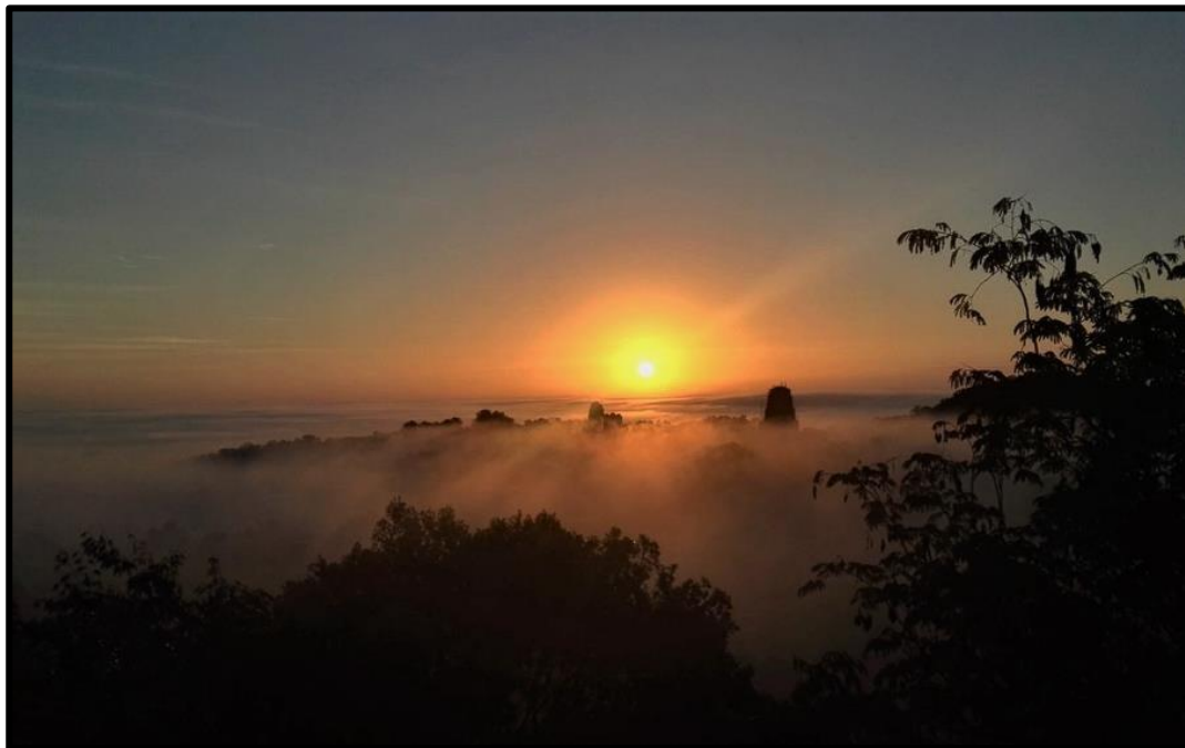
An impressive sunrise in Tikal National Park.

We will spend the full day admiring the Tikal pyramids and archaeological sites. Birding around Tikal provides unique encounters with forest species such as Ocellated Turkey , Scaly-throated Leaf-tosser , Tawny-crowned Greenlet , Dusky Antbird , Green Honeycreeper , Rufous Piha , Ruddy Quail-Dove , Northern Royal Flycatcher , Barred Forest Falcon , Brown-hooded Parrot , Red-lored Amazon , Slaty-tailed Trogon , Pheasant Cuckoo , Mayan Antthrush , Rufous Mourner , White-bellied Wren , Ruddy and Northern Barred Woodcreepers , Rose-throated Becard , Plumbeous Kite , and Pale-billed Woodpecker .