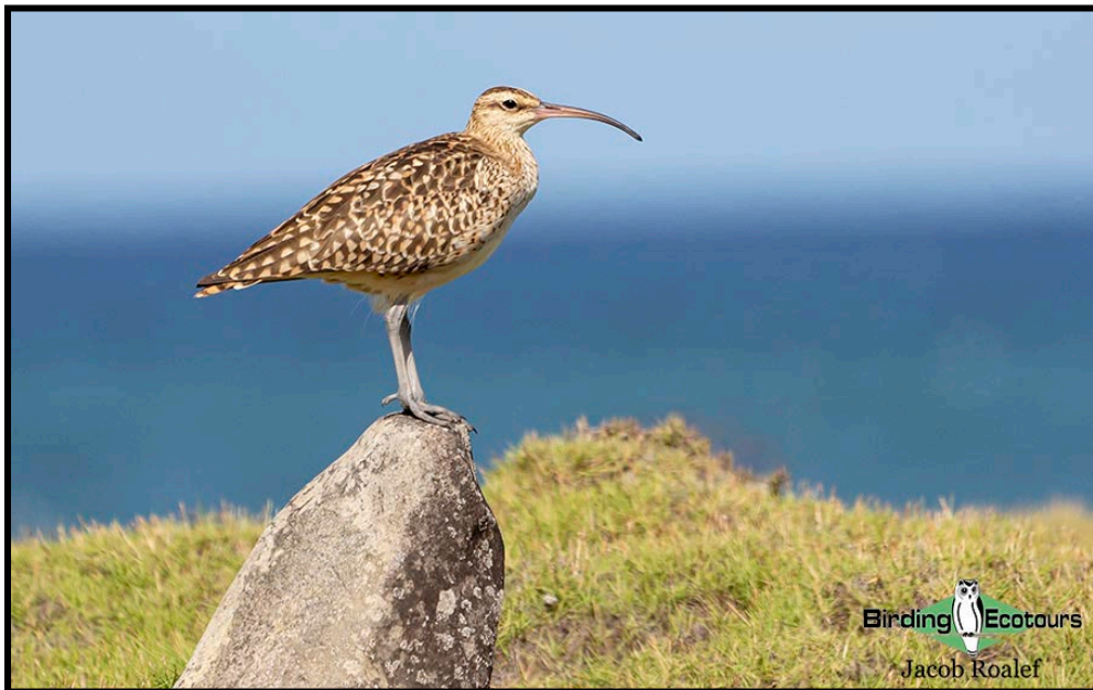
Bristle-thighed Curlew can be seen on O'ahu.

Overnight: Queen Kapi'olani Hotel, Waikiki