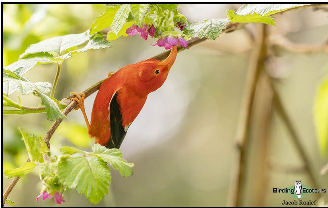
Iiwi is one of the most spectacular of Hawaii’s native birds.

O‘ahu, Kaua‘i, and Hawai‘i (Big Island). We visit pristine montane forests and coastal hotspots to target sought-after endemic species, such as Iiwi , Akiapolaau , Apapane , and Anianiau , along with common and widespread species like the Nene (Hawaiian Goose) – Hawaii’s state bird. Other highlights include Bristle-thighed Curlew , Hawaiian Petrel , Laysan Albatross , and Blue-billed White Tern , along with notable introduced species that now form part of Hawaii’s birding landscape. Unfortunately, since 2021, Palila has become very difficult to find; this Hawaii tour is definitely one to do as soon as possible before more species slip into extinction. We've slightly abbreviated our tour by a day as we will only make an attempt for Palila if we feel it worthwhile based on recent sightings.