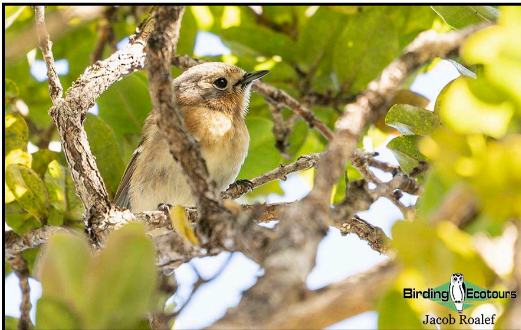
During this tour, we target all three endemic elepaio species including this Kauai Elepaio .

While Hawaii is renowned for its luxurious weddings, stunning beaches, world-class surfing, and premier vacation resorts, it is also a top birding destination. Due to its isolation, Hawaii has an incredibly high rate of endemism, with many strange and peculiar-looking birds found nowhere else. Unfortunately, competition and predation by invasive species (primarily from Europe and Asia), habitat loss, and the spread of avian malaria by mosquitoes have devastated Hawaii's birdlife , leading to extinctions and placing many species on the brink. It is one of those birding destinations to visit as soon as possible, before more endemics go extinct. Many species are now thinly distributed, becoming increasingly difficult to find.