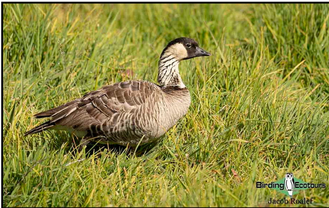
Nene (also known as Hawaiian Goose) is the state bird of Hawaii.

Overnight: Sheraton Kauai Coconut Beach Resort, Kapaa