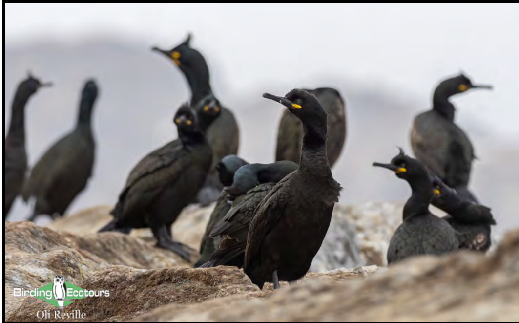
European Shag nest on the Snæfellsnes Peninsula and we will be sure to look out for them here.