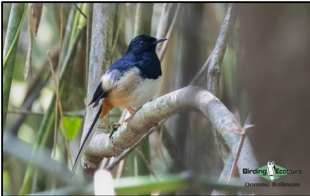
The attractive Andaman Shama can be seen in thick tangles in the undergrowth of forests.

Night birding in these forests is a must as the archipelago is home to a large species diversity of nocturnal avian predators, and although we might be lucky enough to find one or two of our targets on day roosts, we will likely need to spend plenty of time searching at night for the likes of Andaman Masked Owl , Andaman Scops Owl , Andaman Boobook , Hume's Boobook , and Andaman Nightjar , five species of endemic night birds! Furthermore, we should not neglect trying to find Oriental Scops Owl ; the endemic subspecies ( modestus ) occurring in the Andamans could be elevated to full species status and called "Walden's Scops Owl" in the future. So, it is definitely worth putting in the effort at night too. Luckily, darkness falls early, allowing us to owl before dinner