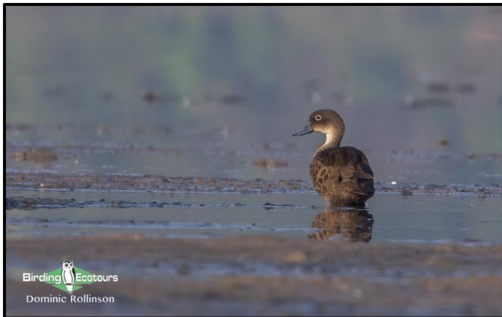
Andaman Teal can be seen in large numbers in the wetlands near Port Blair.

We will also spend time birding around the Kalatang area, and the forest here supports more of our endemic targets, with spectacular species such as Andaman Woodpecker – a large, all-black Dryocopus woodpecker with striking scarlet crown, crest, and malar stripe and pale eyes – found nearby. Additionally, we should see Andaman Coucal , Andaman Shama , Andaman Bulbul , and White-headed Starling . Other non-endemic species we might find here include Green Imperial Pigeon , Pied Imperial Pigeon , Black Baza , Chestnut-headed Bee-eater , Freckle-breasted Woodpecker , Common Hill Myna , Ornate Sunbird , and Asian Fairy-bluebird . Plume-toed Swiftlet and Brown-backed Needletail are usually seen whirling above the forest patches.