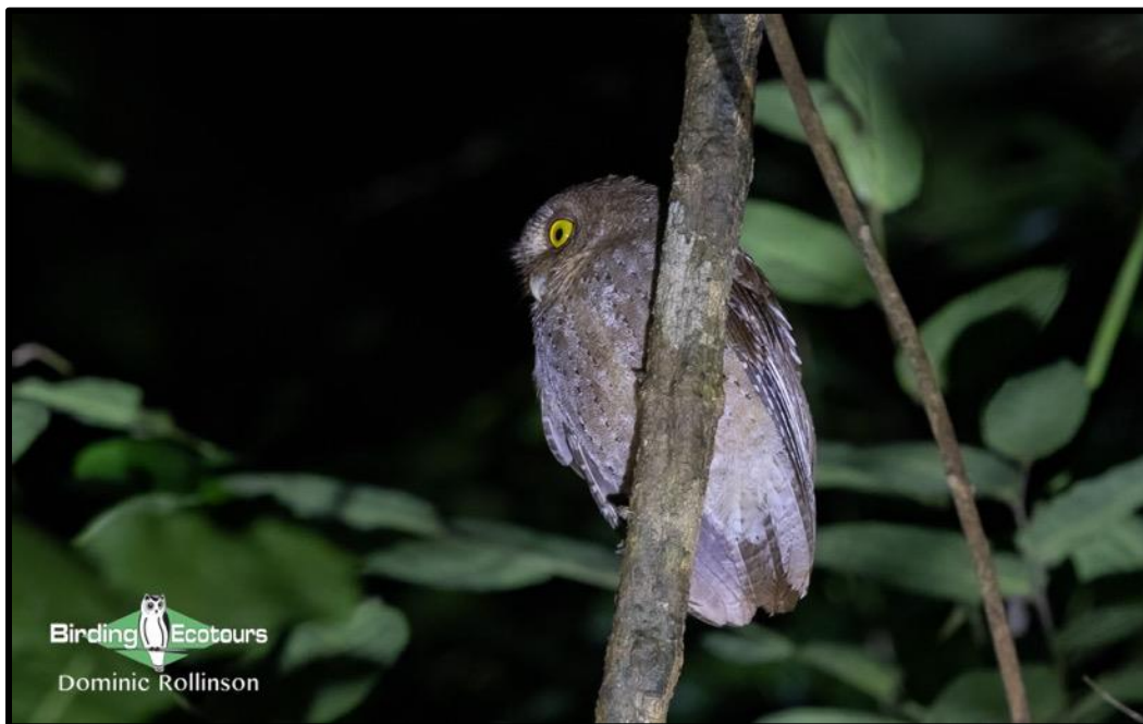
Andaman Scops Owl is another of our endemic targets.

The islands' isolation has produced many endemics, which are our main tour targets. These include Andaman Teal , Andaman Nightjar , Andaman Coucal , Andaman Wood Pigeon , Andaman Cuckoo-Dove , Andaman Green Pigeon , Andaman Crane , Andaman Serpent Eagle , Andaman Masked Owl , Andaman Scops Owl , Hume's Boobook , Andaman Boobook , Andaman Woodpecker , Andaman Cuckooshrike , Andaman Drongo , Andaman Treepie , Andaman Bulbul , White-headed Starling , Andaman Shama , and Andaman Flowerpecker . Pristine forest still remains in some areas, and we will spend the majority of our time in these areas, such as Chidiya Tapu and Mount Manipur (formerly Mount Harriet) National Park, where the vast majority of our endemic target birds occur. We will also visit Sippighat swamps, Shoal Bay, and other wetlands to search mangroves, mudflats, and waterbodies for an assortment of species.