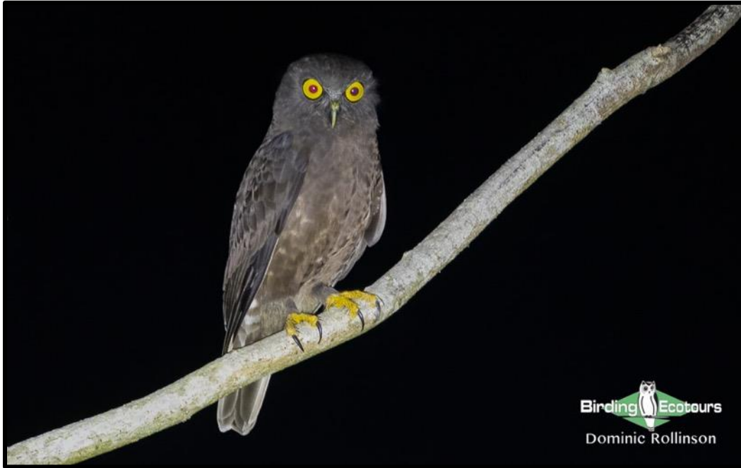
Hume's Boobook is one of four endemic owls we will target on this tour.

Please note that the itinerary cannot be guaranteed as it is only a rough guide and can be changed (usually slightly) due to factors such as availability of accommodation, updated information on the state of accommodation, roads, or birding sites, the discretion of the guides, and other factors. In addition, we sometimes have to use a different guide from the one advertised due to tour scheduling or other factors.