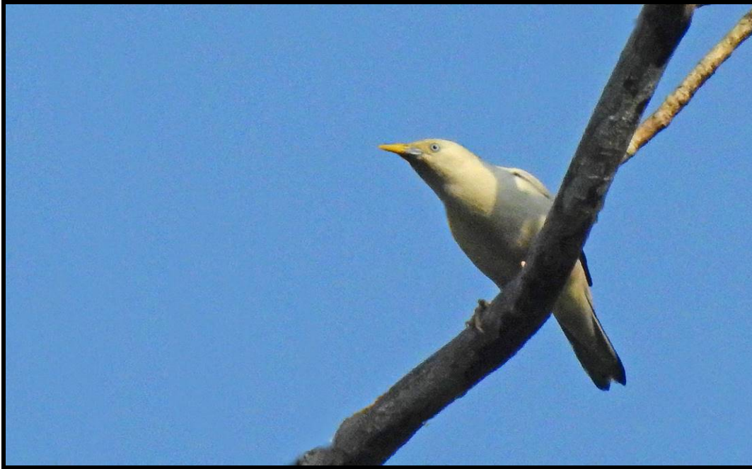
The endemic White-headed Starling is a beautiful bird.

Secretive in the extreme is the Andaman Crake . We hope to see this absolutely spectacular and tough forest-dwelling endemic during our time in suitable habitat. Other species possible skulking about on the forest floor include Forest Wagtail and Orange-headed Thrush , the former a nonbreeding winter visitor, the latter a resident species (an endemic subspecies and possible future split).