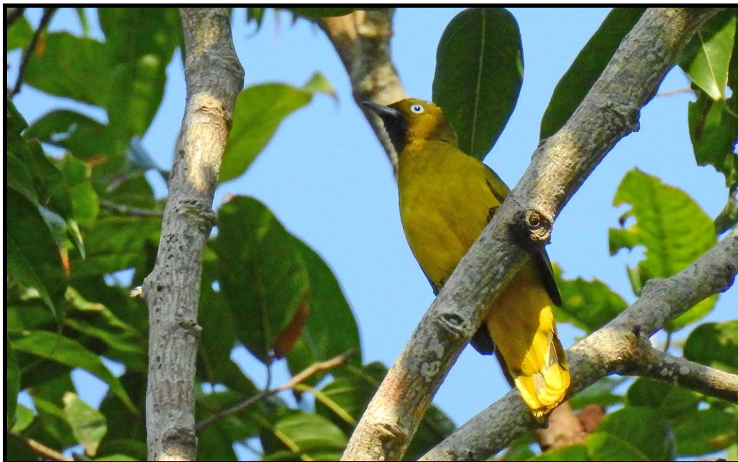
Andaman Bulbul is fairly common but rather striking with its pale eye.

Our accommodation for two nights is located in the Chidiya Tapu area, and the forest here supports more of our endemic targets, with spectacular species such as Andaman Woodpecker – a large, all-black Dryocopus woodpecker with striking scarlet crown, crest, and malar stripe and pale eyes – found nearby. Additionally, we should see Andaman Coucal , Andaman Shama , Andaman Bulbul , and White-headed Starling .