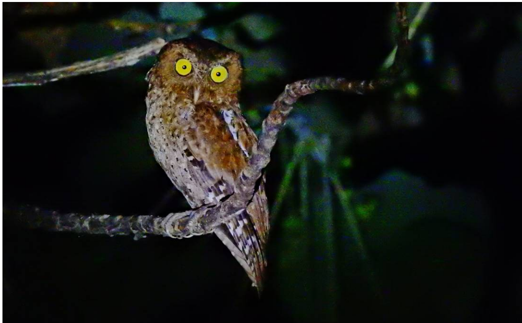
Another of our endemic targets is Andaman Scops Owl.

Due to the remote location and age of these islands a number of endemic birds have evolved here, and these are the main targets of the tour and will include Andaman Teal, Andaman Nightjar, Andaman Coucal, Andaman Wood Pigeon, Andaman Cuckoo-Dove, Andaman Green Pigeon, Andaman Crake, Andaman Serpent Eagle, Andaman Masked Owl, Andaman Scops Owl, Hume's Hawk-Owl, Andaman Hawk-Owl, Andaman Woodpecker, Andaman Cuckooshrike, Andaman Drongo, Andaman Treepie, Andaman Bulbul, White-headed Starling, Andaman Shama, and Andaman Flowerpecker . Pristine forest still remains in some areas, and we will spend the majority of our time in these areas, such as Chidiya Tapu and Mount Harriet National Park, where the vast majority of our endemic target birds occur. We will also be sure to visit other habitats, such as the Sippighat swamps, North Wandoor, and other locations where we will check waterbodies, swamps, mangrove forests, and mudflats for a wide assortment of birds.