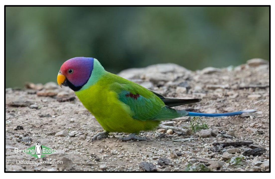
The colorful Plum-headed Parakeet is one of the few parakeet species we hope to encounter on this tour.

We can also arrange this trip to fit before or after any of our other India birding tours, though the costs for this may vary from the costs provided for the dates given here.