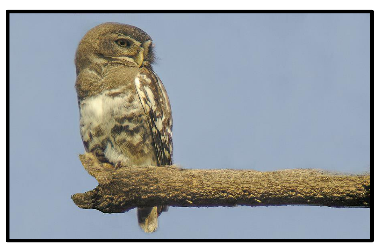
Forest Owlet is the primary target of this special extension.

22 - 25 FEBRUARY 2026 22 - 25 FEBRUARY 2027