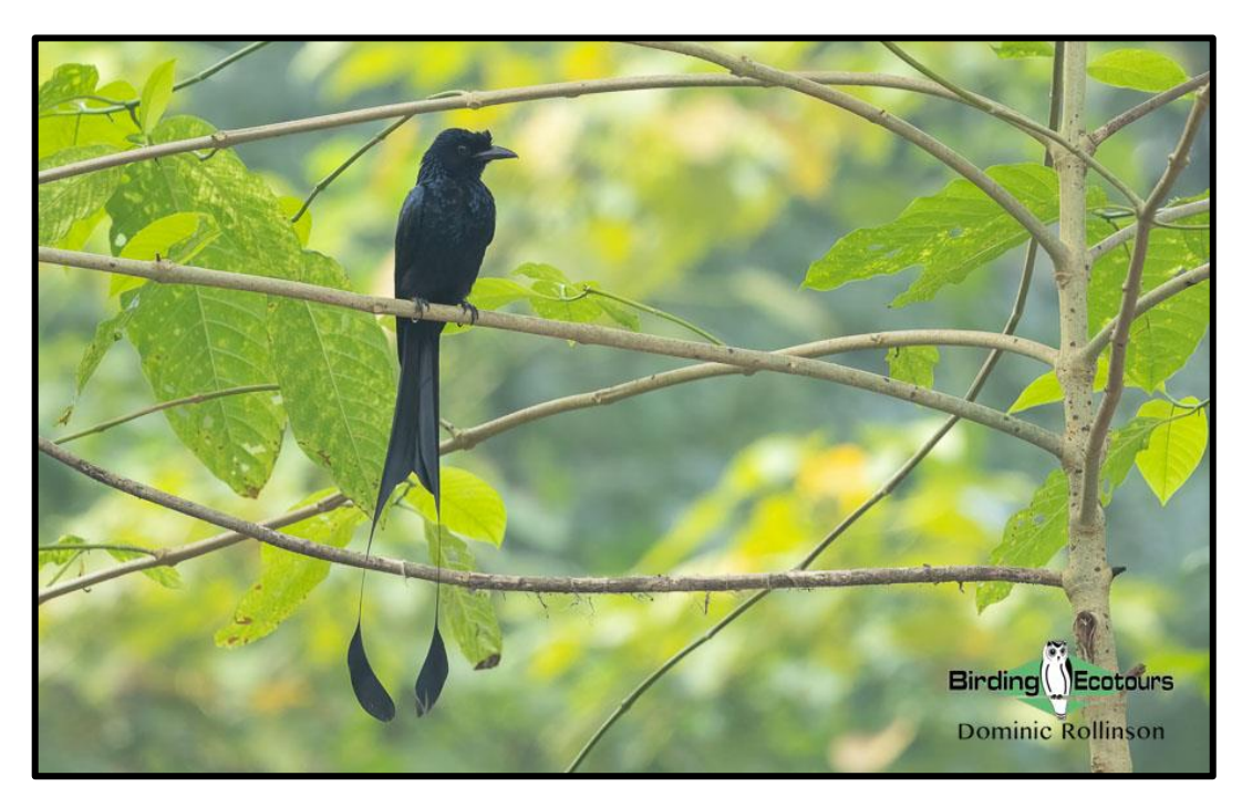
The stunning Greater Racket-tailed Drongo occurs in Tansa Wildlife Sanctuary, and we will look for this stunning species while searching for Forest Owlet.

We will spend the full day birding in and around the Tansa Wildlife Sanctuary, where we will continue looking for Forest Owlet . The teak forests here hold numerous other good birds, such as Malabar Trogon (difficult here) White-cheeked Barbet , Vigors's Sunbird , and Bluewinged (Malabar) Parakeet .