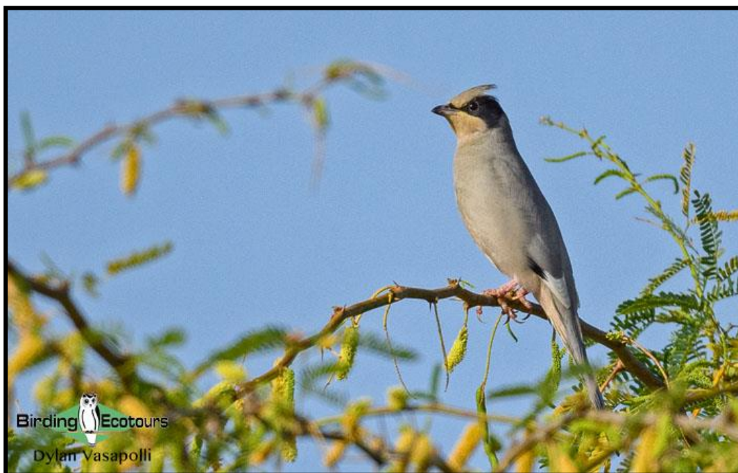
The monotypic Grey Hypocolius in the Great Rann of Kutch will be a big tour highlight.

We usually aim to finish one afternoon in the bush with the aim of looking for Indian Nightjar or potentially some other animals of interest.