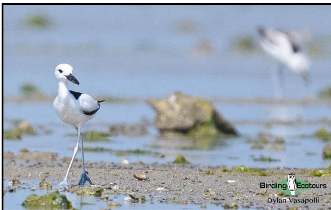
The monotypic Crab-plover at Jamnagar will be a major tour highlight.