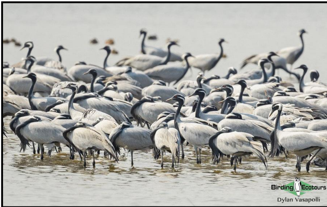
Flocks of Demoiselle Cranes should be seen on this tour.

and Bluethroat . We will also come back to the lake shore one night to look for the rather compact-looking Sykes's Nightjar as well as Indian Nightjar and interesting mammals.