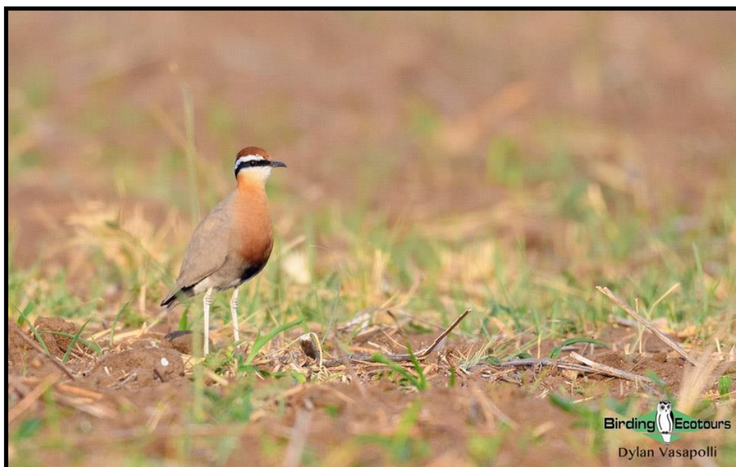
The highly sought-after and rather dapper-looking Indian Courser .

You could combine this tour with our very popular Birding Tour India: The North – Tigers, Amazing Birds, and the Himalayas that runs directly before this tour, and you could follow it up with our short Birding Tour India: The West – Forest Owlet Extension , a bird with a fascinating history (click the link to find out about it. Other extensions at each location are also possible if you would like to prolong your stay in this wonderful and vibrant country, details here .