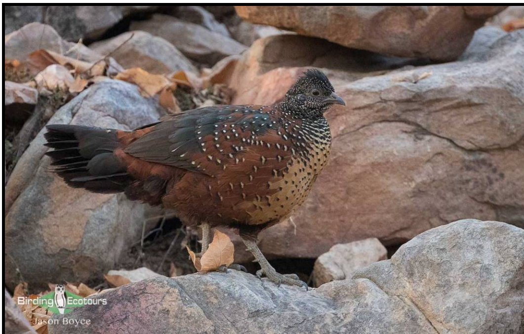
Certainly one of our biggest avian targets in Ranthambhore, Painted Spurfowl