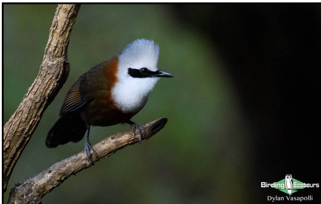
White-crested Laughingthrush can be seen moving through the undergrowth.