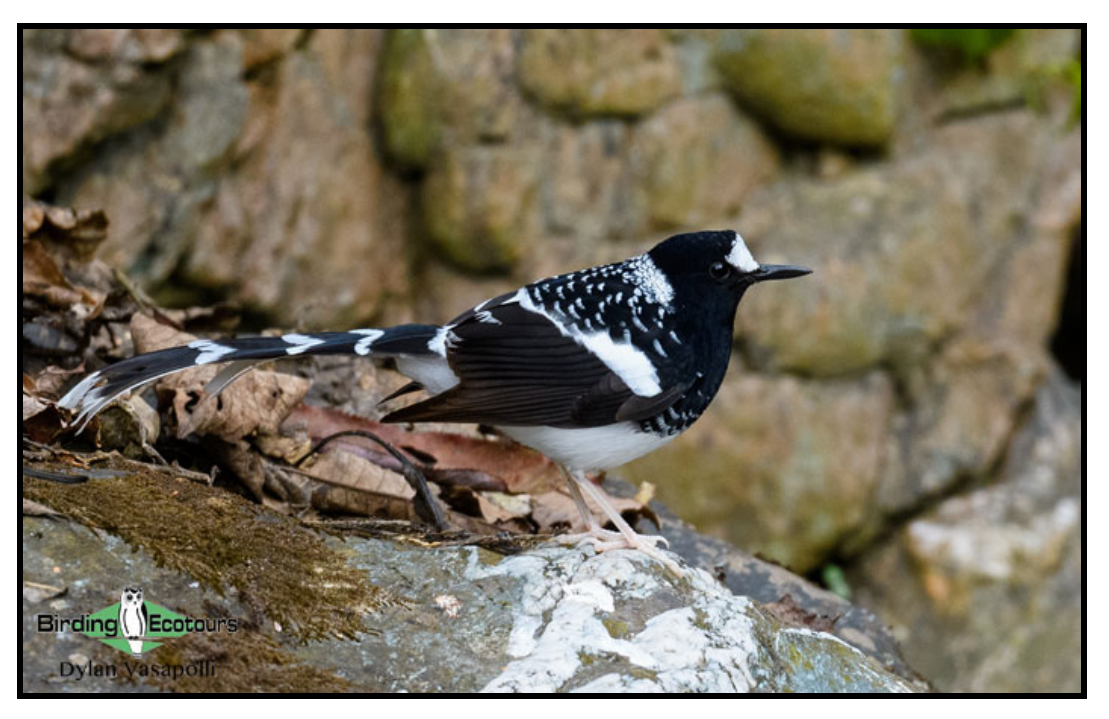
The Spotted Forktail is one of the most beautiful in the whole family.