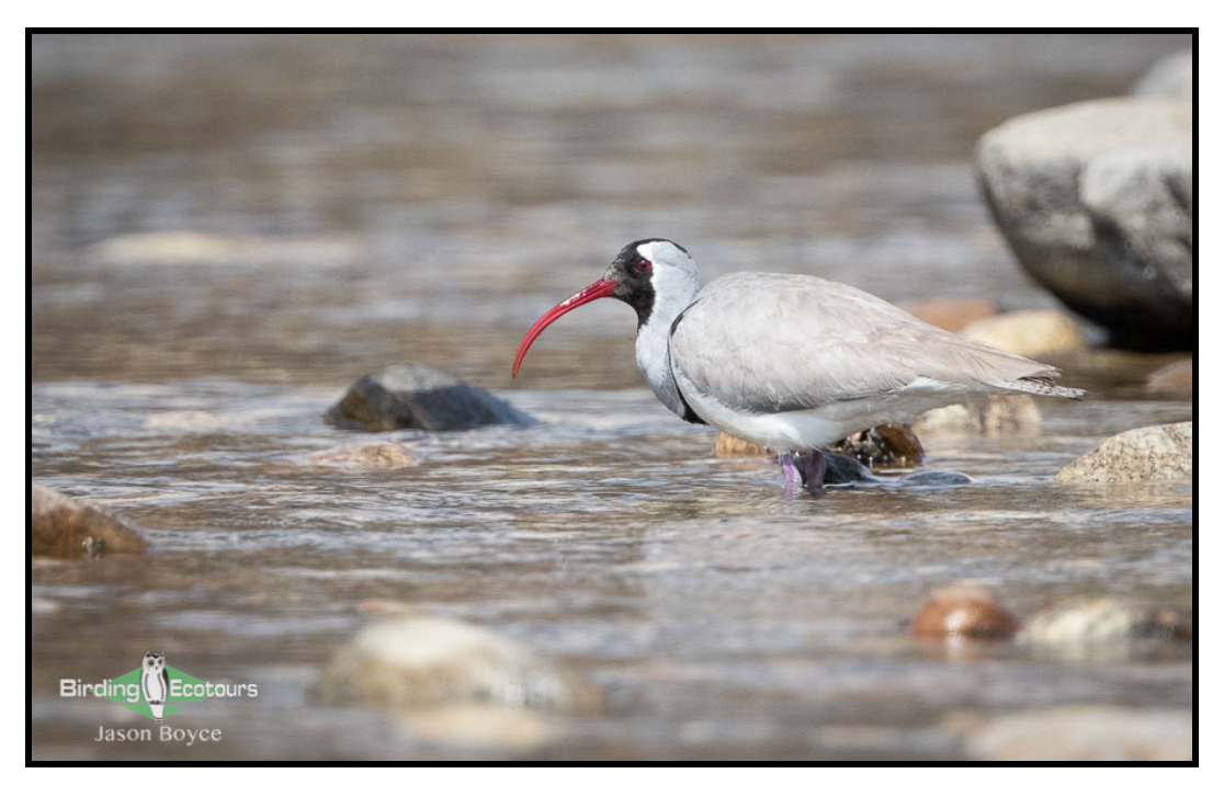
Ibisbill is the sole member of its own family and a huge target bird for any family listers or world birders.

The tour gives the possibility of connecting with numerous exciting birds, such as Ibisbill (a monotypic family), Indian Skimmer , Indian Courser , Kalij Pheasant , Koklass Pheasant , Cheer Pheasant , Painted Spurfowl , Bearded Vulture (Lammergeier), Indian Vulture , Indian Spotted Eagle , Collared Falconet , Sarus Crane , Painted Sandgrouse , Black-bellied Tern , River Tern , Tawny Fish Owl , Brown Fish Owl , Blue-bearded Bee-eater , Great Hornbill , Sirkeer Malkoha , Great Slaty Woodpecker , Himalayan Woodpecker , Long-billed Thrush , Spotted Forktail , Slaty-backed Forktail , Little Forktail , Brown Dipper , Golden Bush Robin , Himalayan Bluetail , Himalayan Rubythroat , Rufous-breasted Accentor , Altai Accentor , White-capped Bunting , and Wallcreeper (another monotypic family). Furthermore the tour offers the chance to search out one of the world's most highly sought but elusive big cats, the Bengal Tiger , with a supporting cast that could include Indian Leopard , Asian Elephant , Ganges River Dolphin , Gharial , Mugger , and Indian Python .