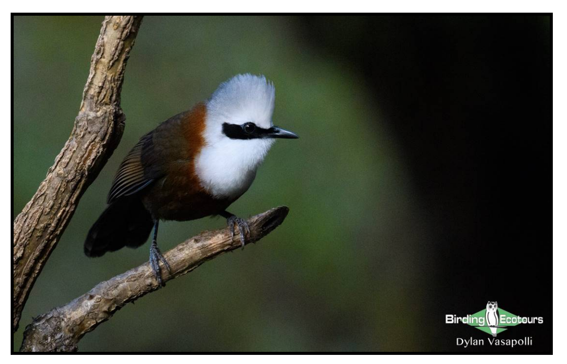
White-crested Laughingthrush can be seen moving through the undergrowth.