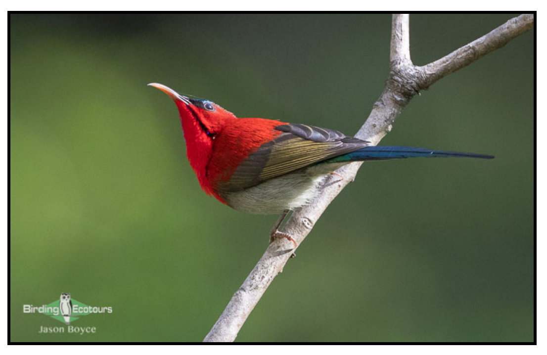
Sighting after sighting, northern India produces so many extraordinary species and never ceases to amaze. Pictured here is a Crimson Sunbird .