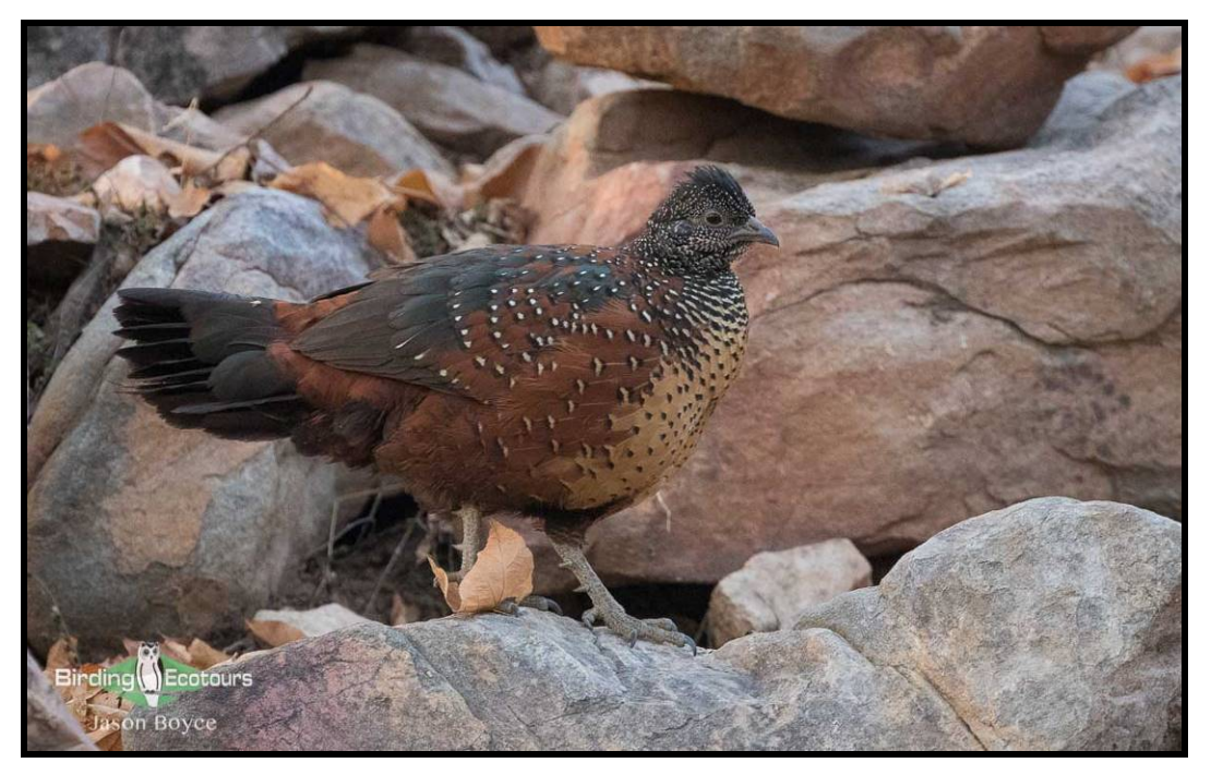
Certainly one of our biggest avian targets in Ranthambhore, Painted Spurfowl