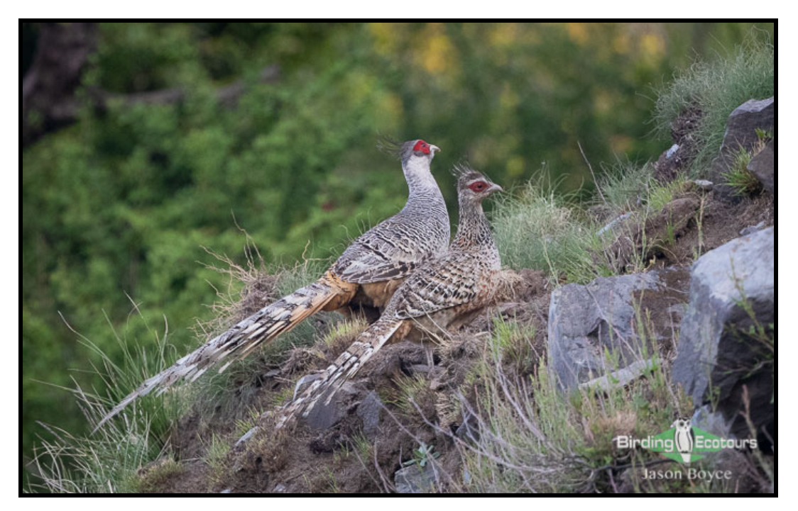
A pair of the prized Cheer Pheasant found above our base in Pangot