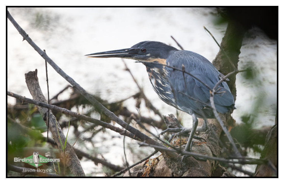
Keoladeo National Park can produce sightings of three bitterns; pictured here is Black Bittern.