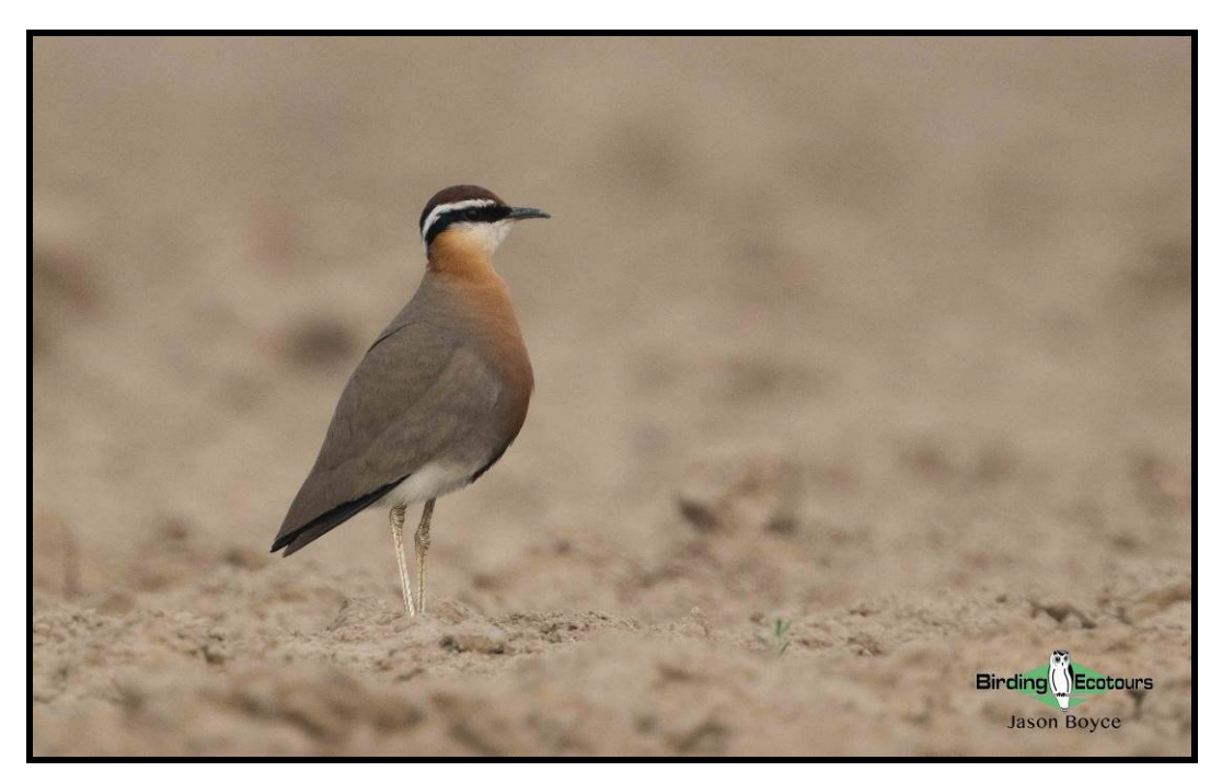
The beautiful Indian Courser can be found in agricultural fields near the town of Bharatpur.

Oriental Skylark, Citrine Wagtail, Western Yellow Wagtail, White-browed Wagtail, Tawny Pipit, and the stunning Indian Roller.