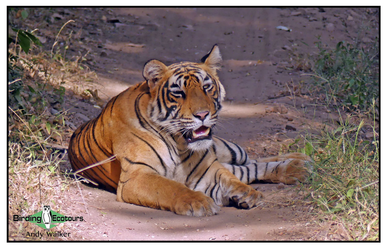
Bengal Tiger is the big mammalian target on this trip.

21 JANUARY – 06 FEBRUARY 2025 22 JANUARY – 07 FEBRUARY 2026