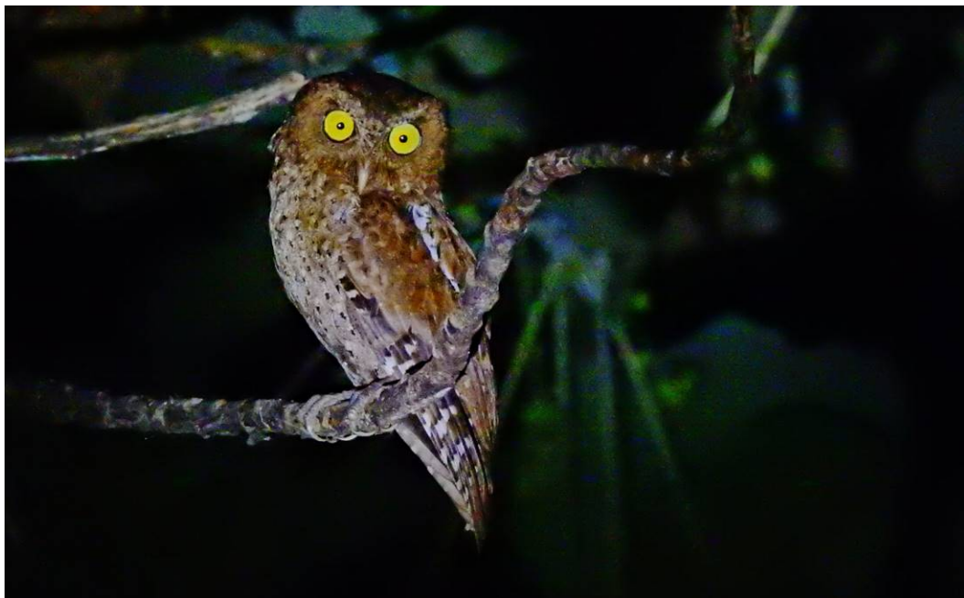
Another of our endemic targets is Andaman Scops Owl.

Due to the remote location and age of these islands a number of endemic birds have evolved here, and these are the main targets of the tour and will include Andaman Teal, Andaman Nightjar, Andaman Coucal, Andaman Wood Pigeon, Andaman Cuckoo-Dove, Andaman Green Pigeon, Andaman Crake, Andaman Serpent Eagle, Andaman Masked Owl, Andaman Scops Owl, Hume's Hawk-Owl, Andaman Hawk-Owl, Andaman Woodpecker, Andaman Cuckooshrike, Andaman Drongo, Andaman Treepie, Andaman Bulbul, White-headed Starling, Andaman Shama, and Andaman Flowerpecker . Pristine forest still remains in some areas, and we will spend the majority of our time in these areas, such as Chidiya Tapu and Mount Harriet National Park, where the vast majority of our endemic target birds occur. We will also be sure to visit other habitats, such as the Sippighat swamps, North Wandoor, and other locations where we will check waterbodies, swamps, mangrove forests, and mudflats for a wide assortment of birds.