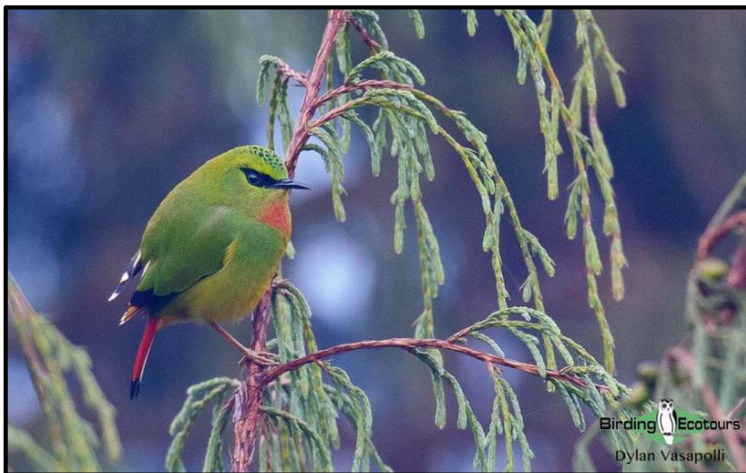
The spectacular Fire-tailed Myzornis provides an incredible hit of color.

wide elevational range to maximize our chances for the most exciting species and mixed-flocks/bird-waves on offer here. Barwings, yuhinas, laughingthrushes, and related species are likely to be evident, such as Red-faced Liocichla , Himalayan Cutia , Fire-tailed Myzornis , Blue-winged Minla , Red-billed Leiothrix , Silver-eared Mesia , Rusty-fronted and Streak-throated Barwings , Long-tailed and Beautiful Sibias , White-naped , Whiskered , and Rufous-vented Yuhinas , Golden-breasted Fulvetta , and Blue-winged , Bhutan , and Black-faced Laughingthrushes . Beautiful Nuthatch and Rusty-flanked Treecreeper along with Yellow-cheeked and Sultan Tits are likely to be in the bird-waves. A range of parrotbills too could be on offer, with Black-headed , Pale-billed and Brown Parrotbills all possible. Some color and further quality might be provided by Ward's Trogon , Red-headed Trogon , Yellow-billed Blue Magpie , Rufous-necked Hornbill , and Scarlet Finch .