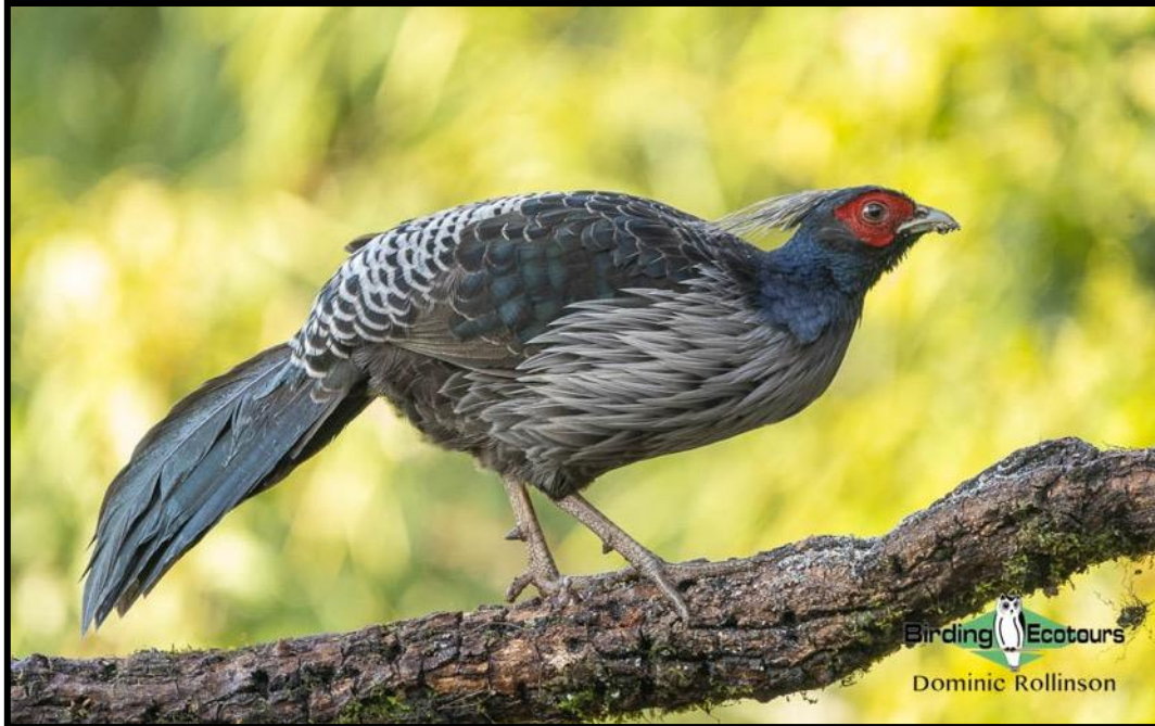
The fantastic male Kalij Pheasant .