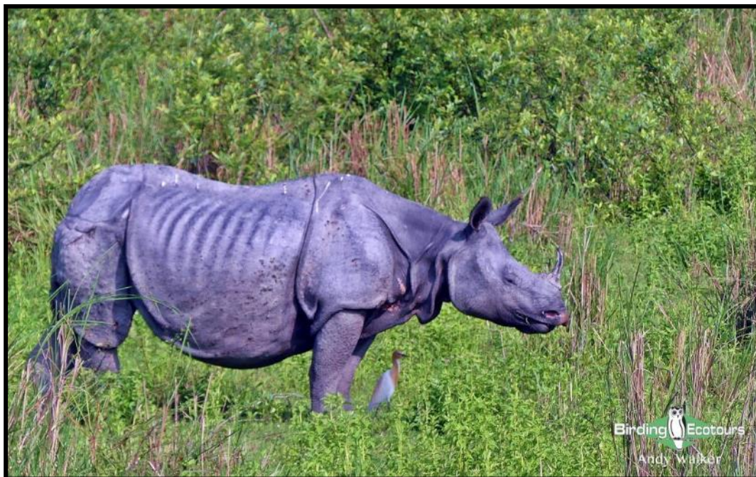
The Greater One-horned (Indian) Rhinoceros is an incredible sight.

A fine suite of mammals also occurs in Kaziranga National Park, and we will look for Greater One-horned (Indian) Rhinoceros, Asian Elephant, Gaur, Wild Water Buffalo, Barasingha (Swamp Deer), Sloth Bear, and Western Hoolock Gibbon . With some luck we may even come