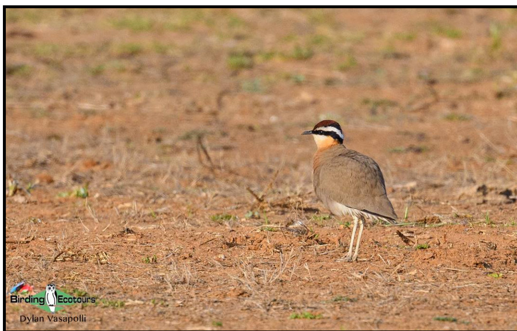
Indian Courser can often be found in the fields around Jaipur.