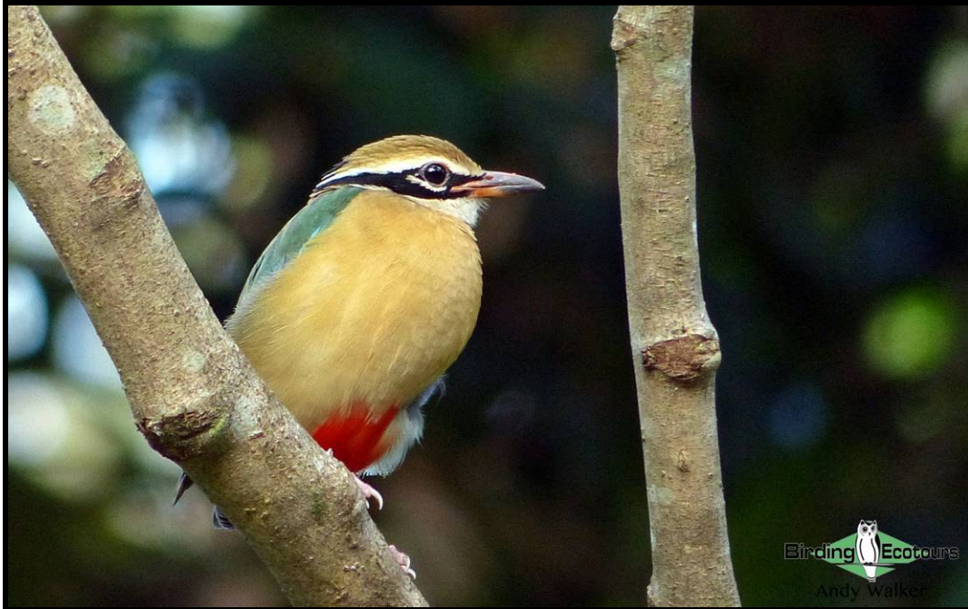
The gorgeous Indian Pitta will be one of our avian targets in Jaipur.