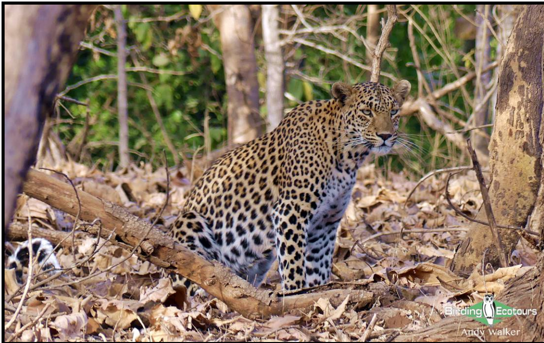
Indian Leopard is one beautiful cat, and we hope to find it in Jhalana Safari Park while also looking for Indian Pitta.