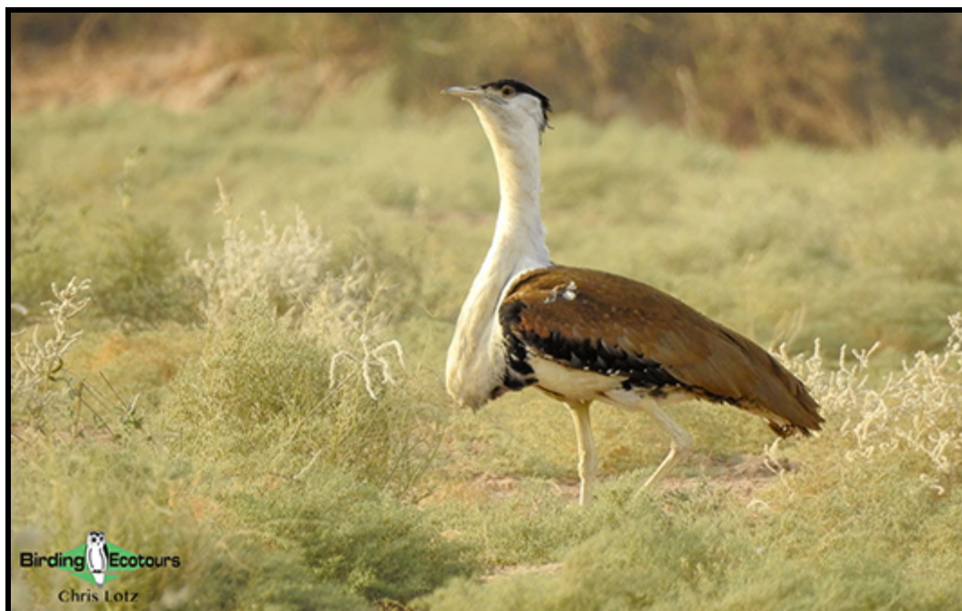
The huge Great Indian Bustard is now Critically Endangered (IUCN).