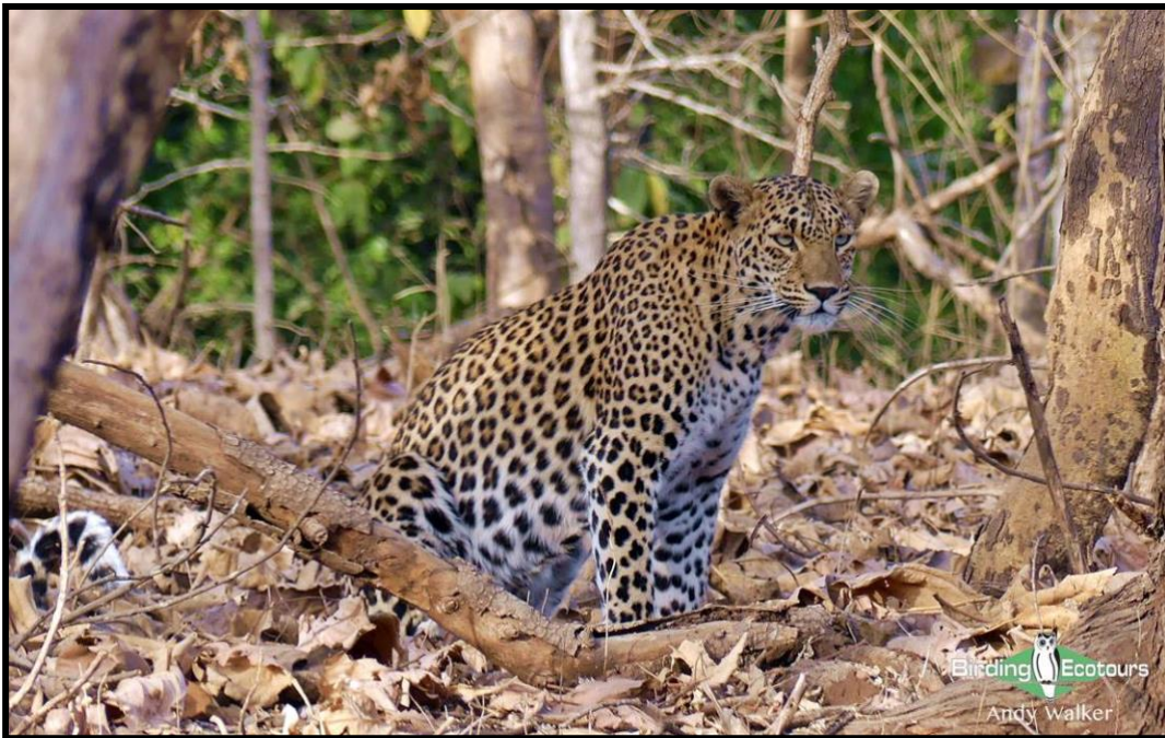
Indian Leopard is one beautiful cat, and we hope to find it in Jhalana Safari Park while also looking for Indian Pitta.