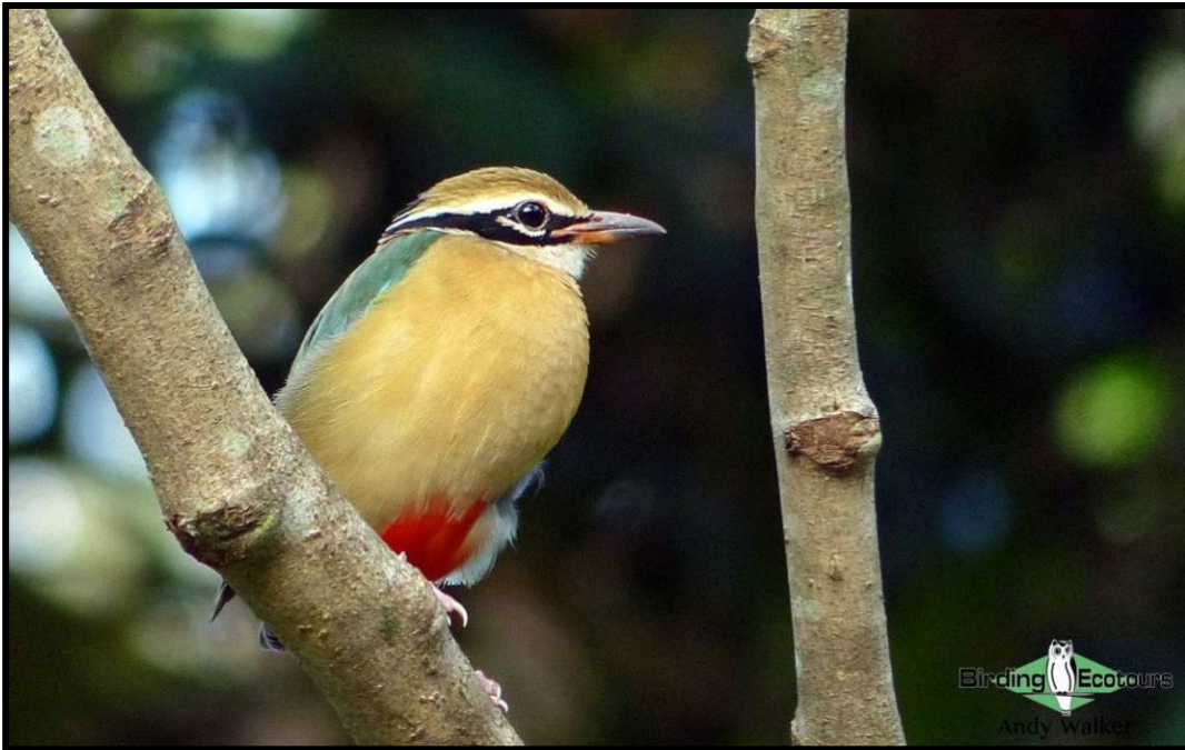
The gorgeous Indian Pitta will be one of our avian targets in Jaipur.