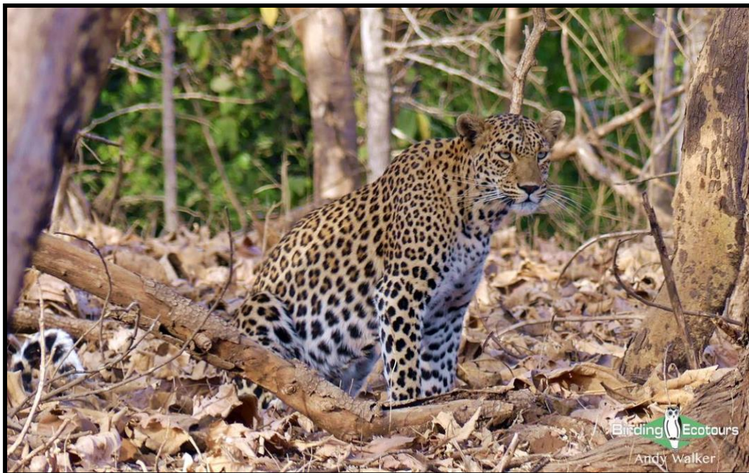
Indian Leopard is one beautiful cat, and we hope to find it in Jhalana Safari Park while also looking for Indian Pitta.