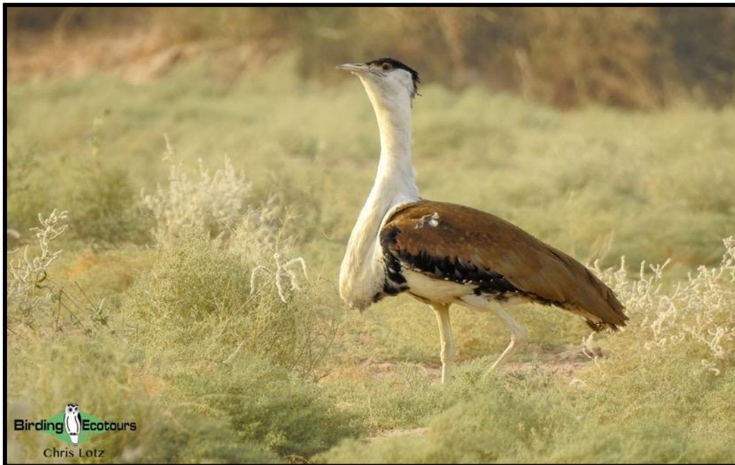
The huge Great Indian Bustard is now Critically Endangered (IUCN).