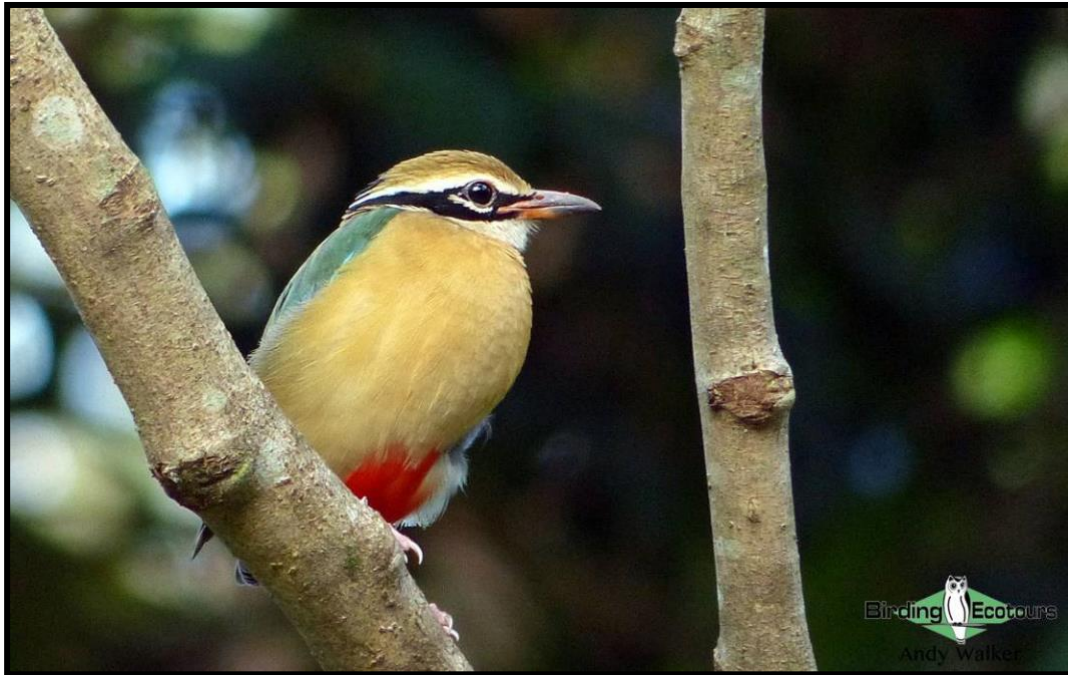
The gorgeous Indian Pitta will be one of our avian targets in Jaipur.