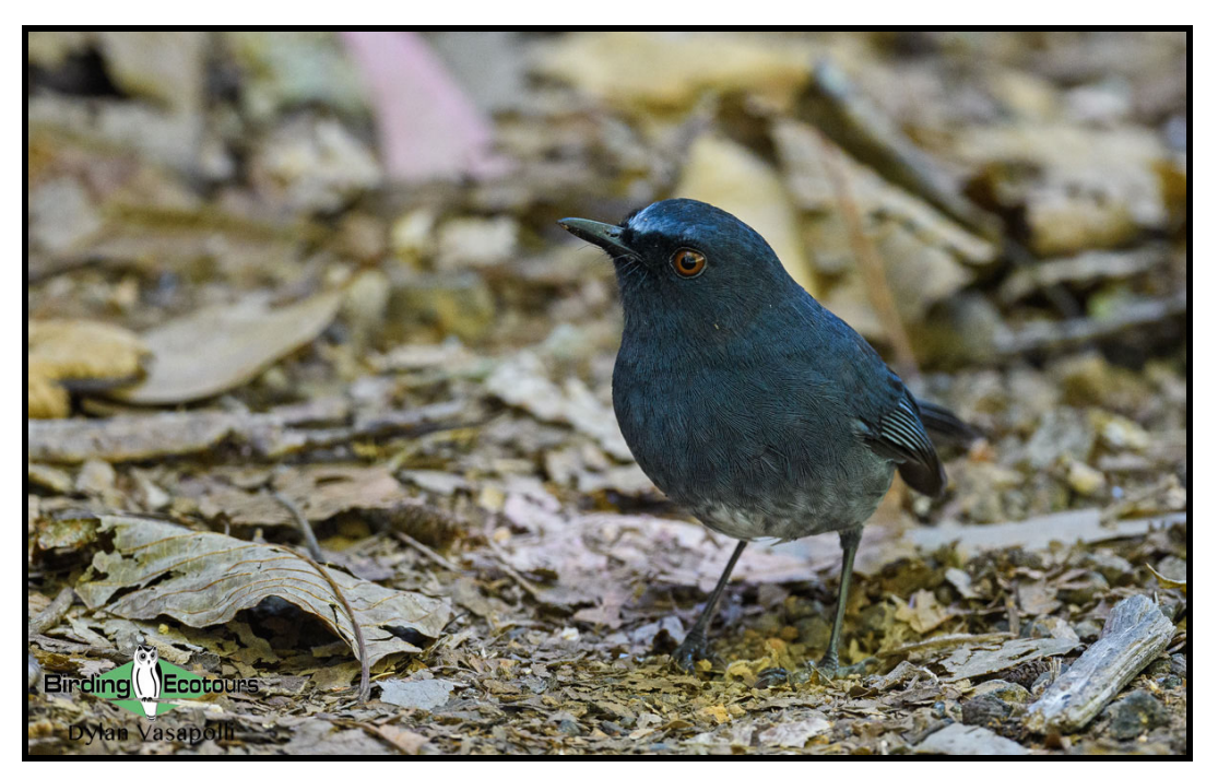
One of our targets in the Munnar area will be the often-secretive White-bellied Blue Robin.