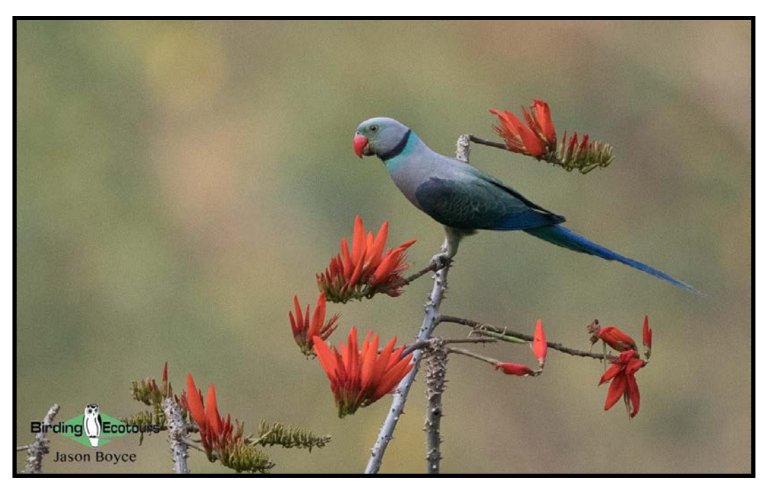
Formerly known as Malabar Parakeet, the Blue-winged Parakeet is another of southern India's endemics.