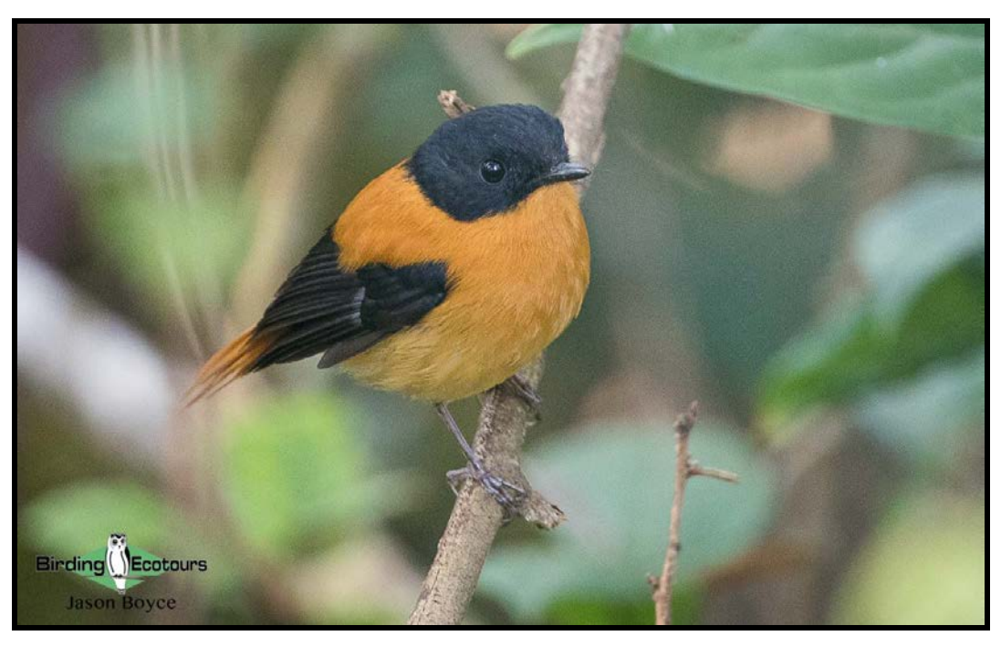
The tiny Black-and-orange Flycatcher is gorgeous and endemic to southern India.