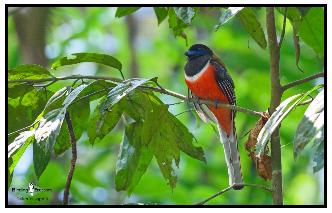
The stunning Malabar Trogon is one of our targets on this trip.