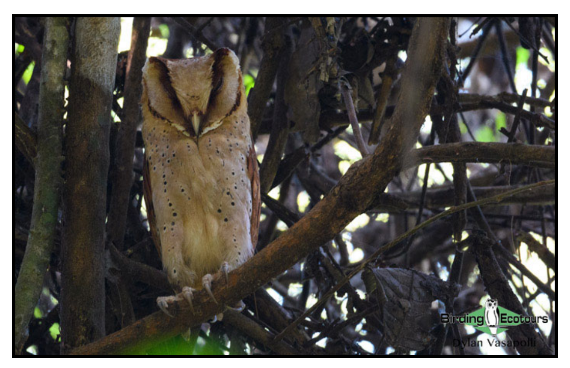
Sri Lanka Bay Owl is one of the toughest birds on the tour, but we hope to repeat our success of previous tours with views of this highly sought owl.

Diurnal and nocturnal specialties here are many and include Indian Pitta, Grey Junglefowl, Flame-throated Bulbul, Grey-headed Bulbul, White-bellied Treepie, Malabar Woodshrike, Sri Lanka Frogmouth, Malabar Trogon, Red Spurfowl, Indian Swiftlet, Jungle Owlet, Sri Lanka Bay Owl, Spot-bellied Eagle-Owl, Rufous Babbler, Orange Minivet, Blue-faced Malkoha, Brown-breasted Flycatcher, White-bellied Blue Flycatcher, Rusty-tailed Flycatcher, Malabar Starling, Asian Fairy-bluebird, Loten's Sunbird, Black-hooded Oriole, Common Emerald Dove, Black-rumped Flameback, and Thick-billed Warbler.