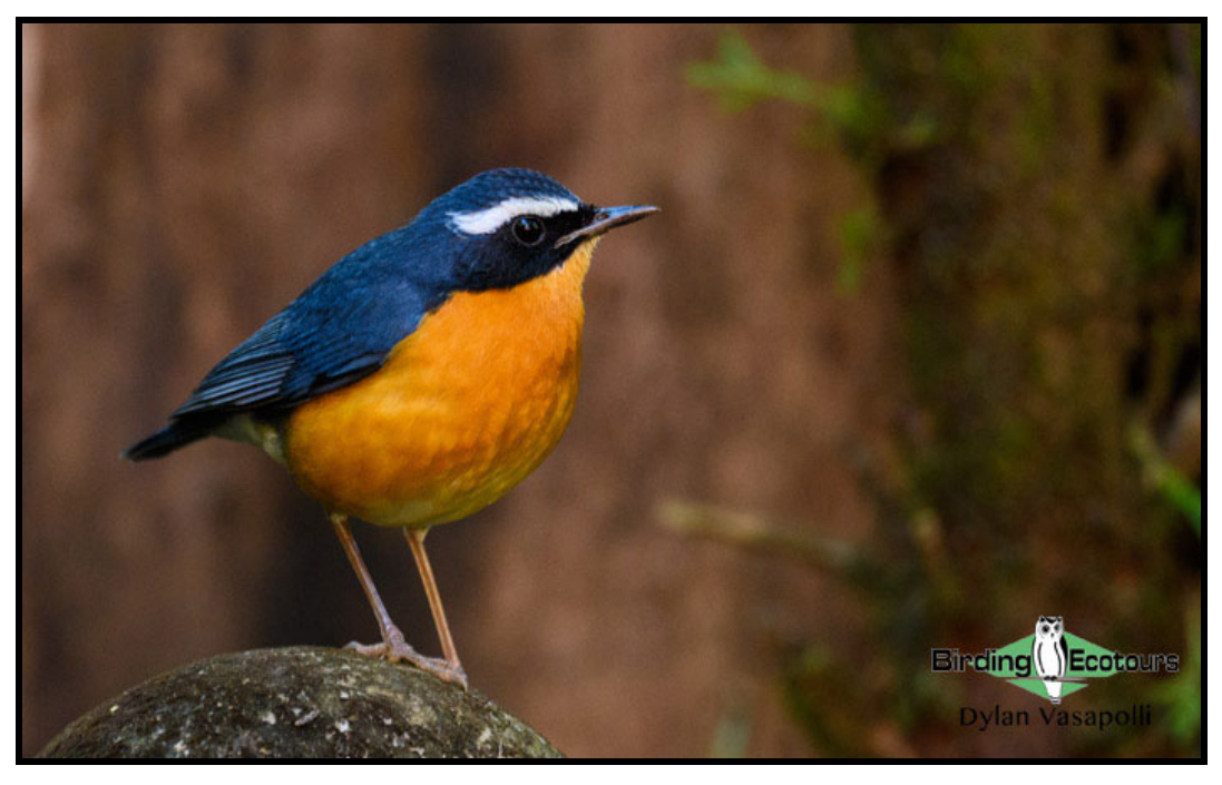
The striking Indian Blue Robin will be a highlight during the tour; the colors of this beautiful bird are just incredible.

We can also easily offer you birding, wildlife-watching, or cultural extensions at each location if you would like to extend your stay in this wonderful, diverse, and vibrant country.