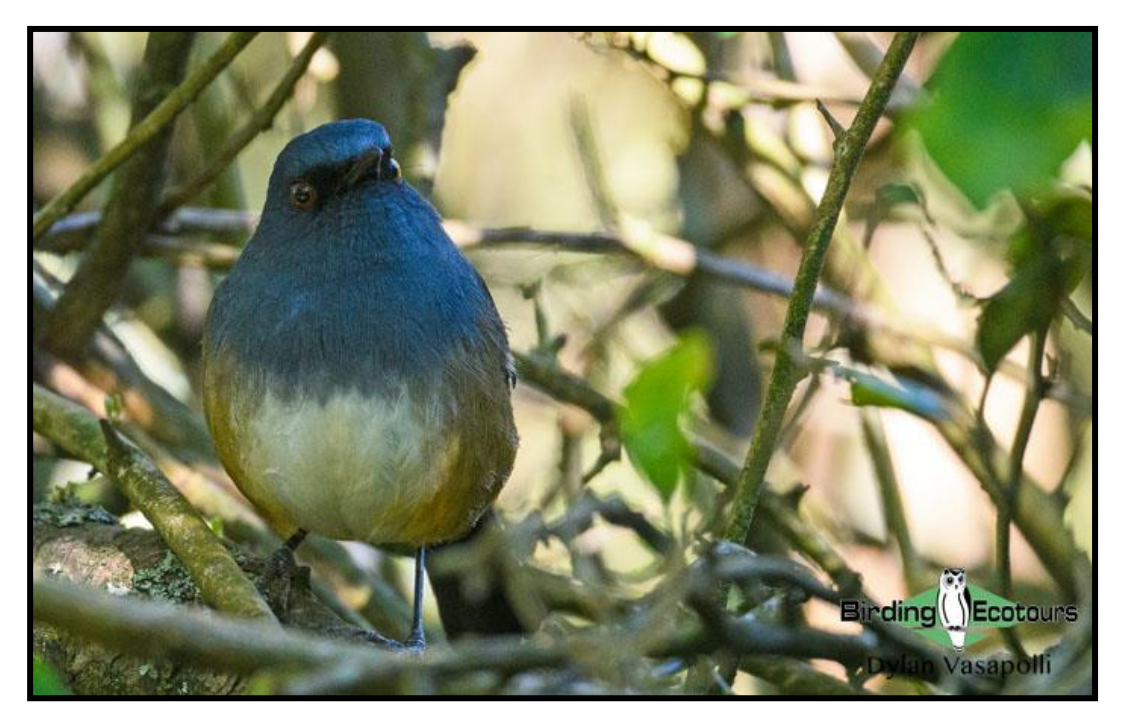
Nilgiri Blue Robin can be a skulker, but with patience we can achieve great views.