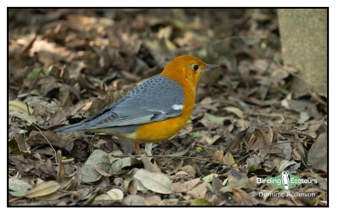
The attractive Orange-headed Thrush can be seen feeding in the leaf litter.