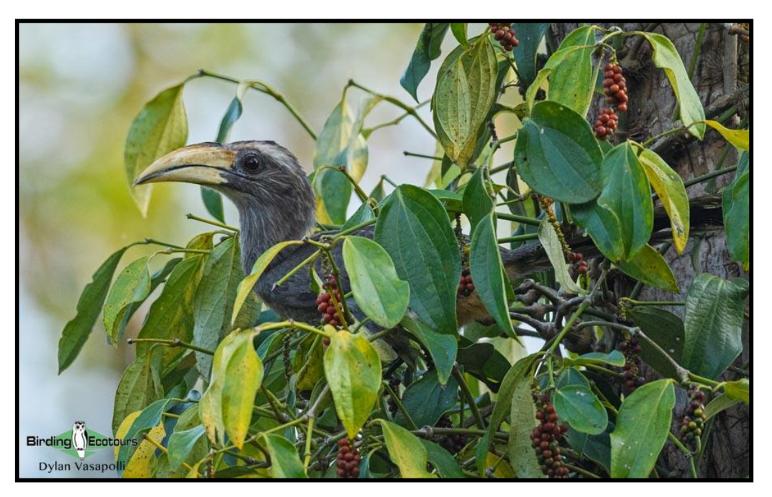
Malabar Grey Hornbill is fairly common in this part of the country.

Some highlights on this tour are likely to include Black-and-orange Flycatcher, Indian Blue Robin, Nilgiri Blue Robin, White-bellied Blue Robin, Nilgiri Thrush, Nilgiri Laughingthrush, Palani Laughingthrush, Wayanad Laughingthrush (formerly called Wynaad Laughingthrush), White-bellied Treepie, Malabar Woodshrike, Malabar Barbet, Nilgiri Wood Pigeon, Nilgiri Flycatcher, Nilgiri Pipit, Sri Lanka Bay Owl, Malabar Whistling Thrush, Blue-winged (Malabar) Parakeet, Malabar Grey Hornbill, Malabar Trogon, Sri Lanka Frogmouth, Indian Pitta, Painted Bush Quail, Red Spurfowl, Great Eared Nightjar, White-bellied Minivet, and, with luck, Indian Vulture and White-rumped Vulture (both Critically Endangered IUCN) and the rare migrant Kashmir Flycatcher.