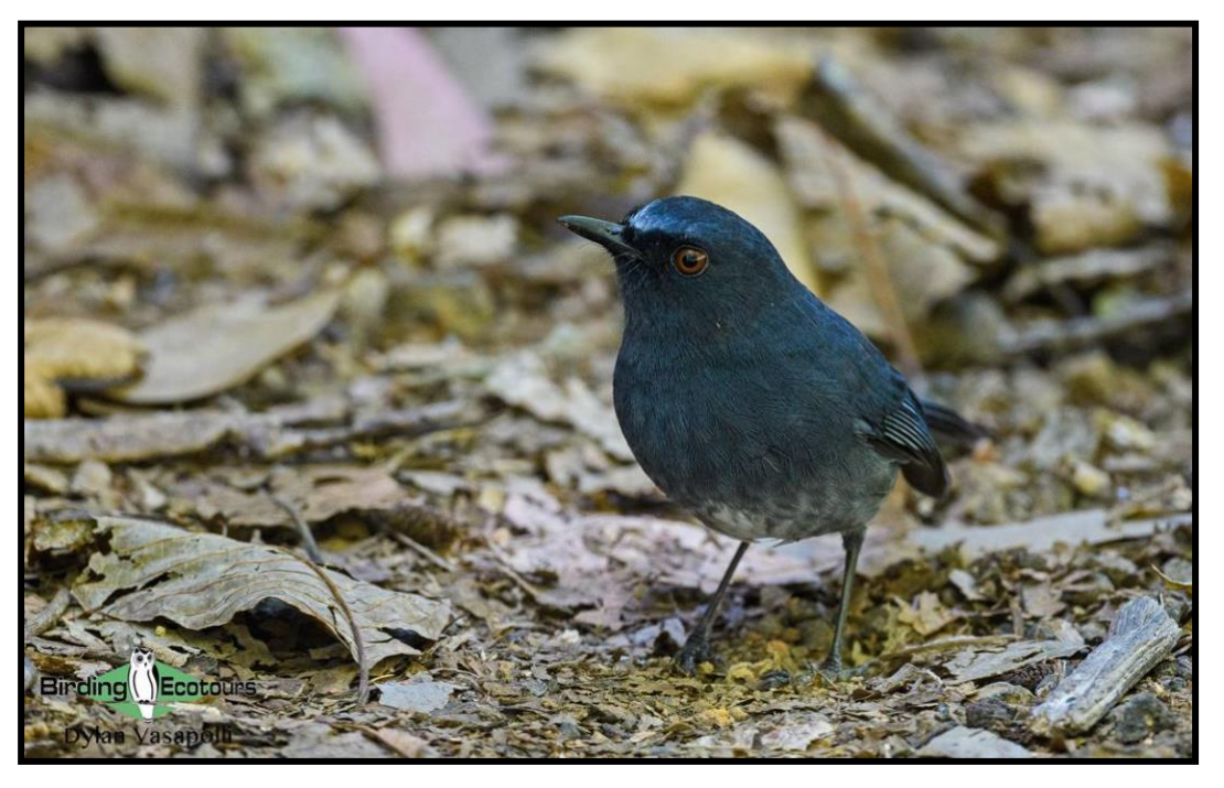
One of our targets in the Munnar area will be the often-secretive White-bellied Blue Robin.