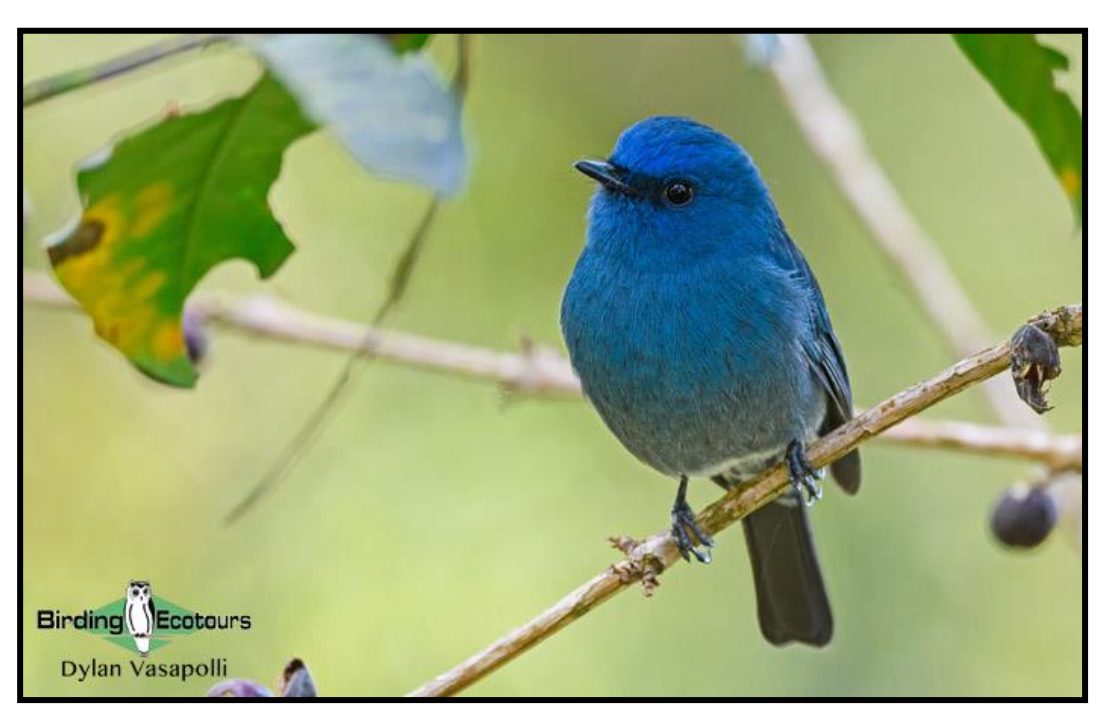
The pretty Nilgiri Flycatcher is sure to delight.