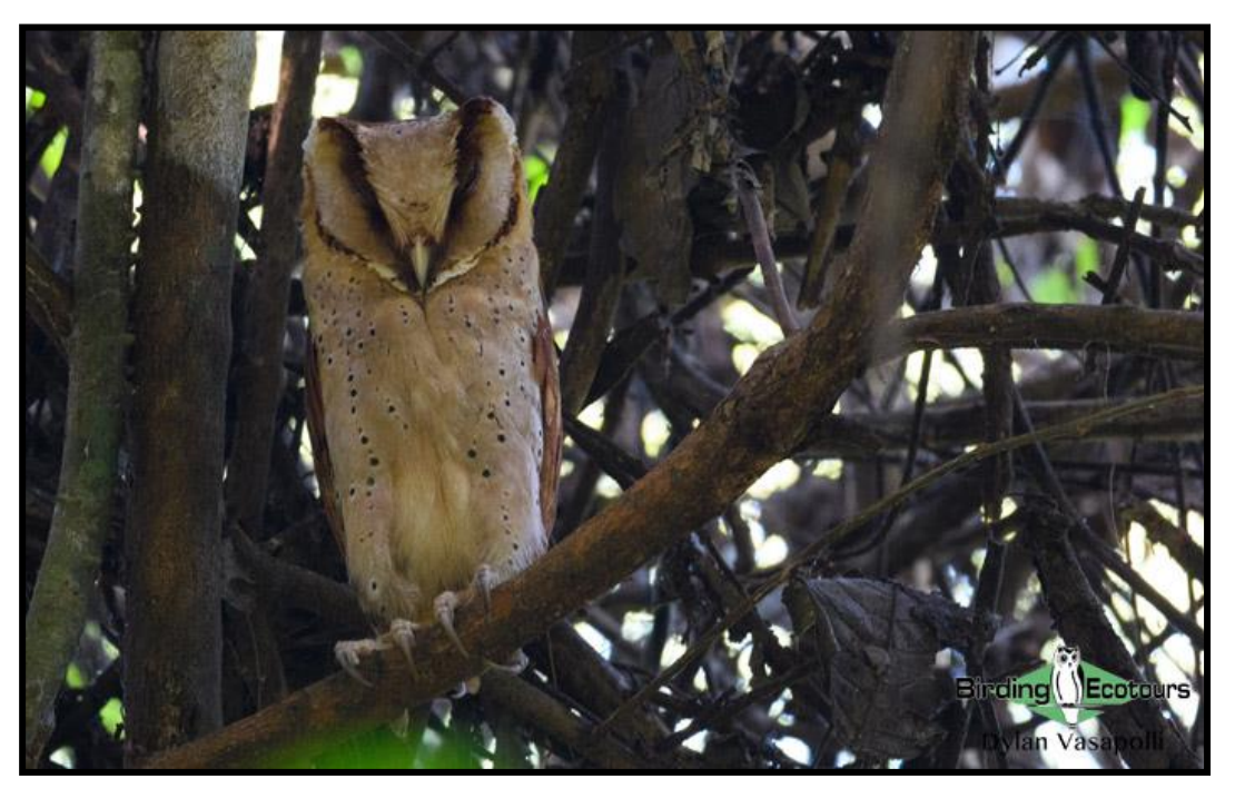
Sri Lanka Bay Owl is one of the toughest birds on the tour, but we hope to repeat our success of previous tours with views of this highly sought owl.

Diurnal and nocturnal specialties here are many and include Indian Pitta, Grey Junglefowl, Flame-throated Bulbul, Grey-headed Bulbul, White-bellied Treepie, Malabar Woodshrike, Sri Lanka Frogmouth, Malabar Trogon, Red Spurfowl, Indian Swiftlet, Jungle Owlet, Sri Lanka Bay Owl, Spot-bellied Eagle-Owl, Rufous Babbler, Orange Minivet, Blue-faced Malkoha, Brown-breasted Flycatcher, White-bellied Blue Flycatcher, Rusty-tailed Flycatcher, Malabar Starling, Asian Fairy-bluebird, Loten's Sunbird, Black-hooded Oriole, Common Emerald Dove, Black-rumped Flameback, and Thick-billed Warbler.