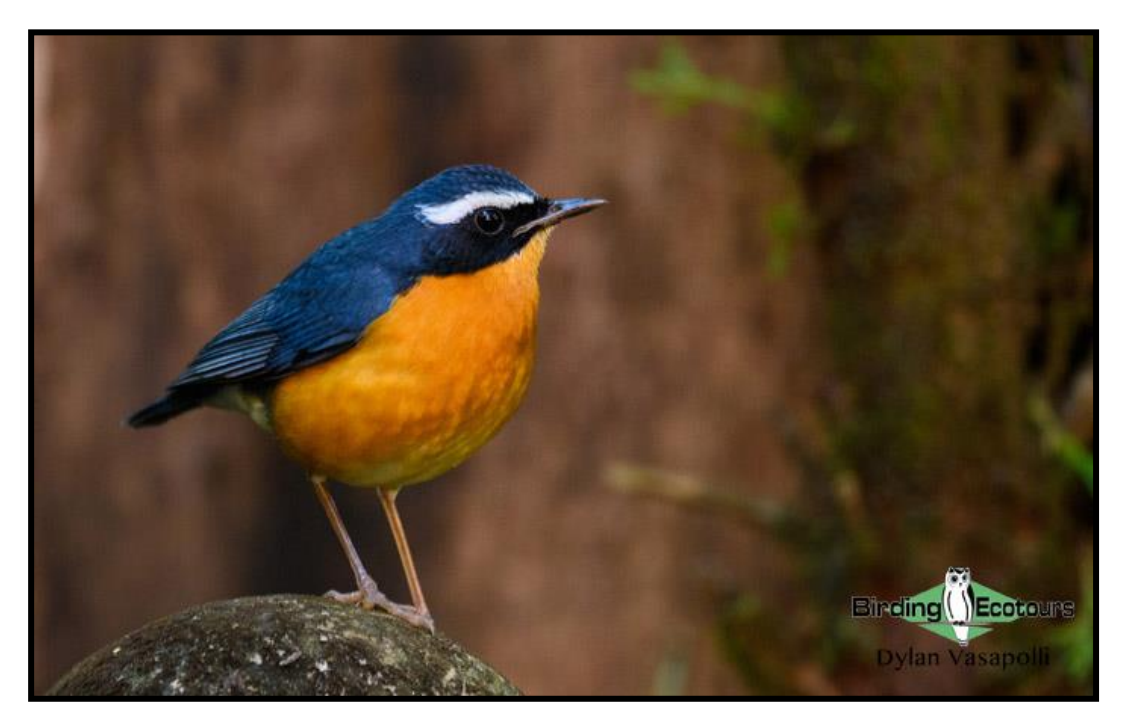
The striking Indian Blue Robin will be a highlight during the tour; the colors of this beautiful bird are just incredible.

We can also easily offer you birding, wildlife-watching, or cultural extensions at each location if you would like to extend your stay in this wonderful, diverse, and vibrant country.