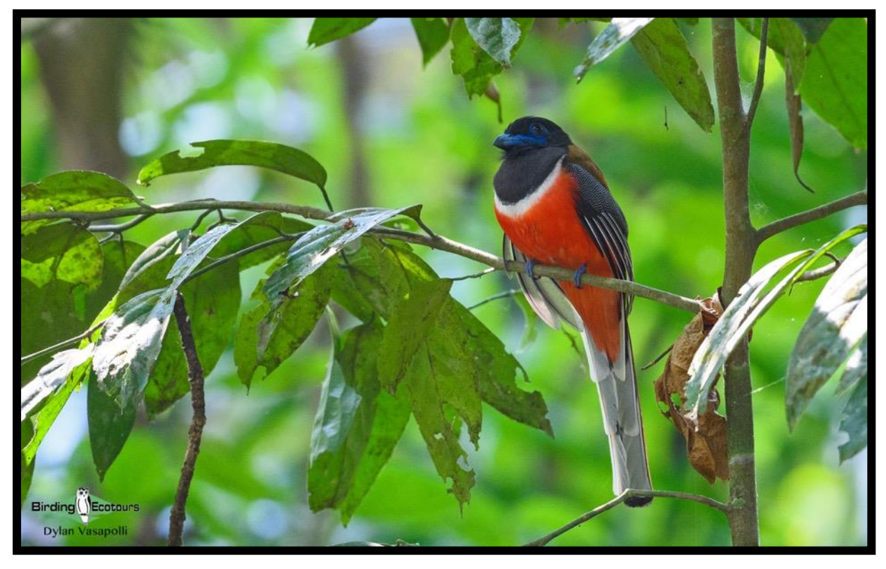
The stunning Malabar Trogon is one of our targets on this trip.

<u>www.birdingecotours.com</u> <u>info@birdingecotours.com</u> Birding