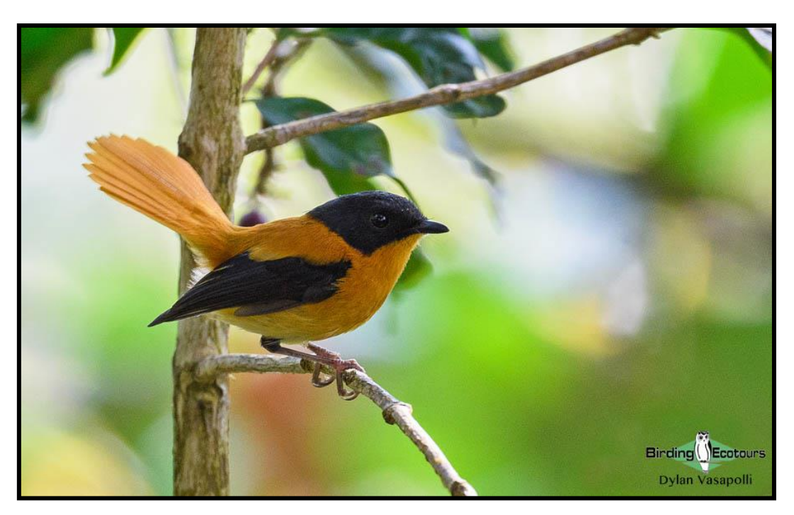
The tiny Black-and-orange Flycatcher is gorgeous and endemic to southern India.