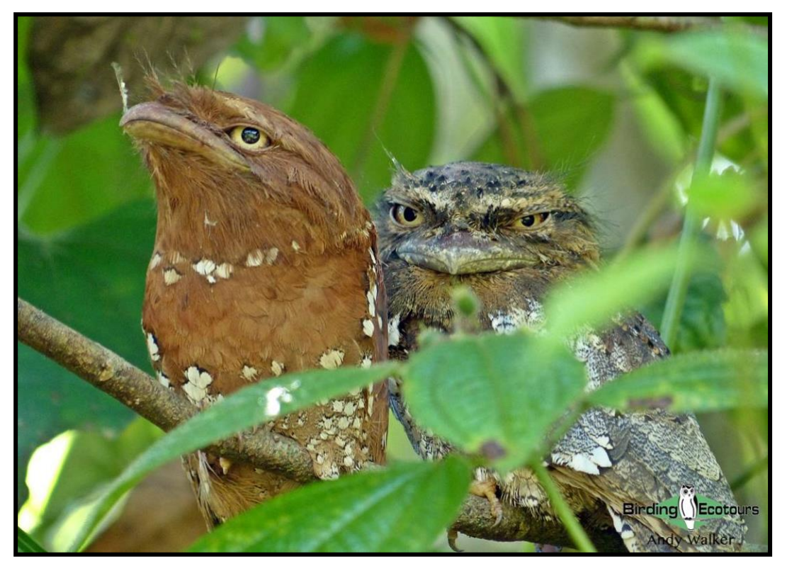
The rather odd-looking Sri Lanka Frogmouth is one of the smaller members of the family, yet it is a big target on this tour.