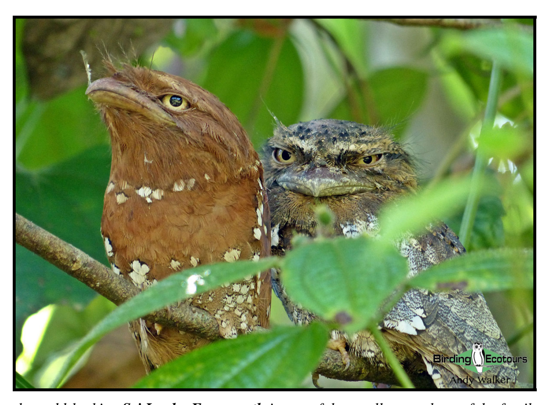
The rather odd-looking Sri Lanka Frogmouth is one of the smaller members of the family, yet it is a big target on this tour.