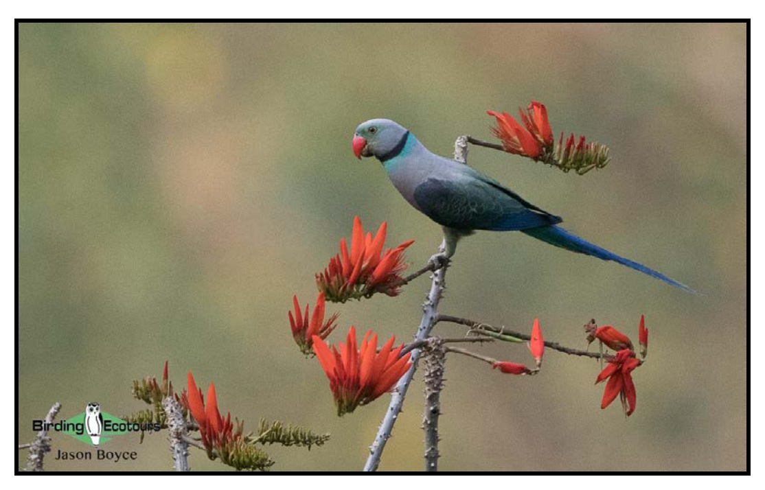
Formerly known as Malabar Parakeet, the Blue-winged Parakeet is another of southern India's endemics.