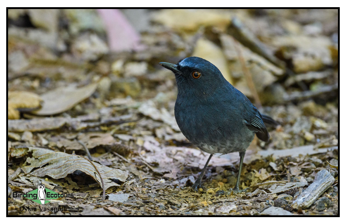
One of our targets in the Munnar area will be the often-secretive White-bellied Blue Robin.