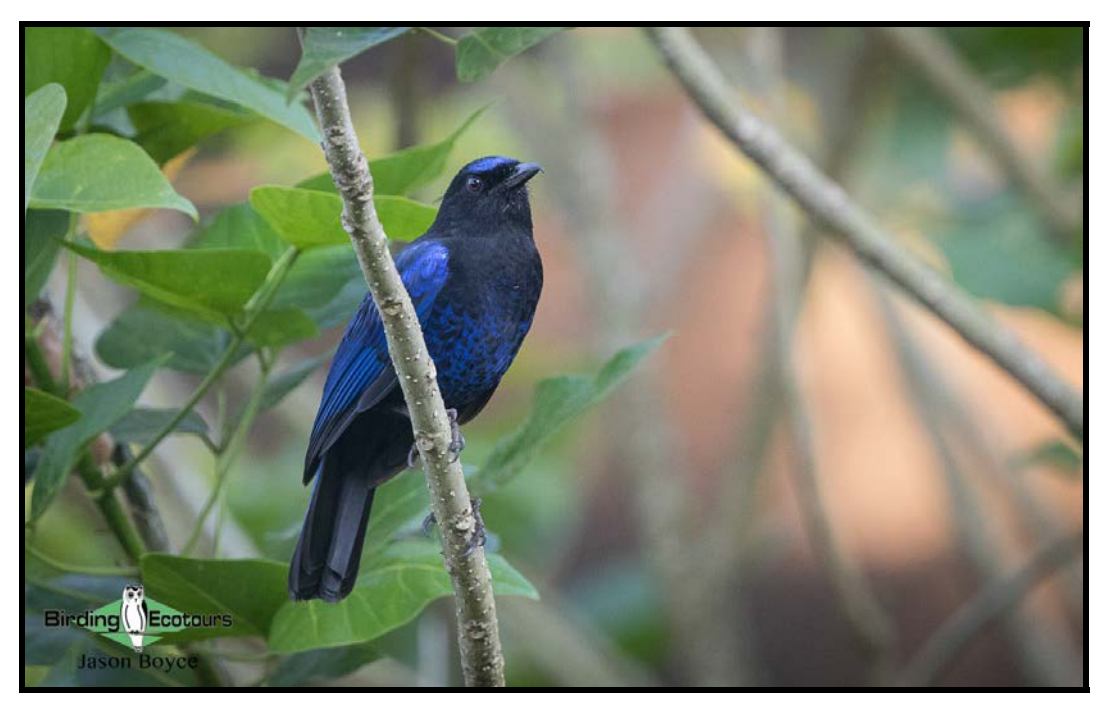
Malabar Whistling Thrush is fairly common in this part of the country and is a taste for the delights to come as you explore southern India.

Some highlights on this tour are likely to include Black-and-orange Flycatcher, Indian Blue Robin, Nilgiri Blue Robin, White-bellied Blue Robin, Nilgiri Thrush, Nilgiri Laughingthrush, Palani Laughingthrush, Wayanad Laughingthrush (formerly called Wynaad Laughingthrush), White-bellied Treepie, Malabar Woodshrike, Malabar Barbet, Nilgiri Wood Pigeon, Nilgiri Flycatcher, Nilgiri Pipit, Sri Lanka Bay Owl, Malabar Whistling Thrush, Blue-winged (Malabar) Parakeet, Malabar Grey Hornbill, Malabar Trogon, Sri Lanka Frogmouth, Indian Pitta, Painted Bush Quail, Red Spurfowl, Great Eared Nightjar, White-bellied Minivet, and, with luck, Indian Vulture and White-rumped Vulture (both Critically Endangered IUCN) and the rare migrant Kashmir Flycatcher.