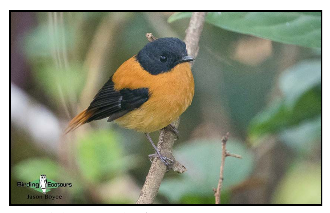
The tiny Black-and-orange Flycatcher is gorgeous and endemic to southern India.