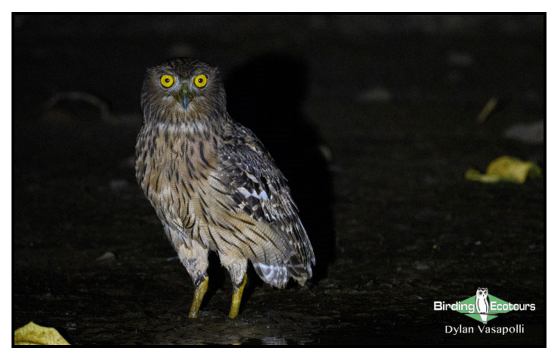
We had incredible views of Brown Fish Owl on our 2020 tour and hope to repeat this during future trips.