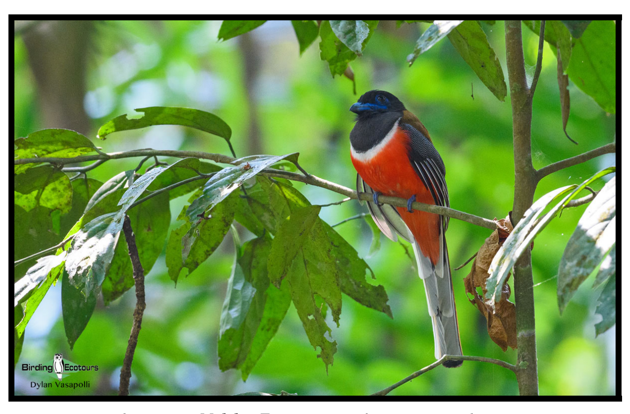
The stunning Malabar Trogon is one of our targets on this trip.