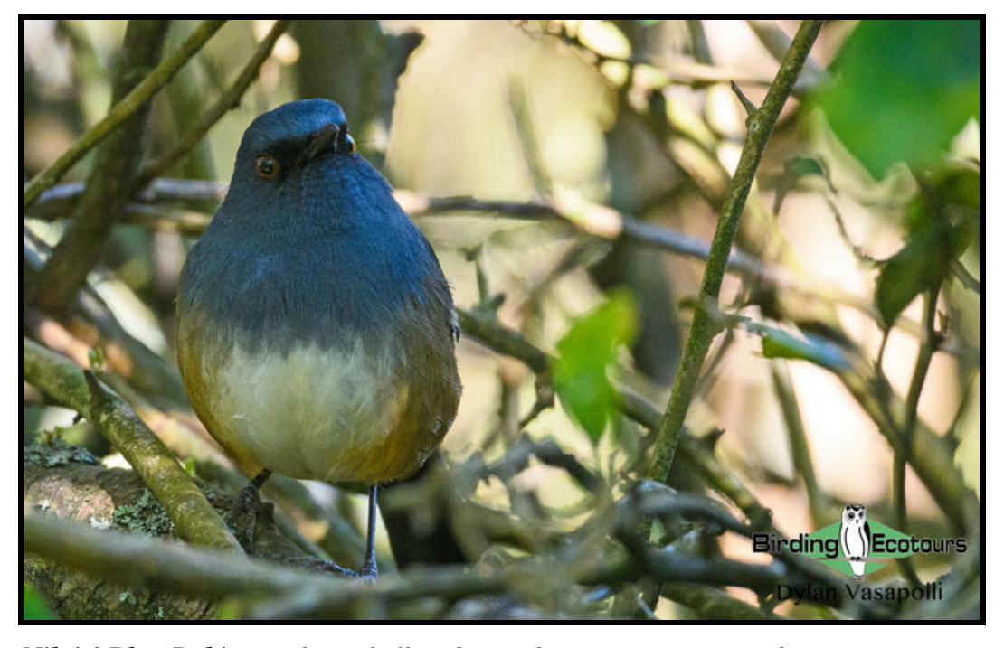
Nilgiri Blue Robin can be a skulker, but with patience we can achieve great views.