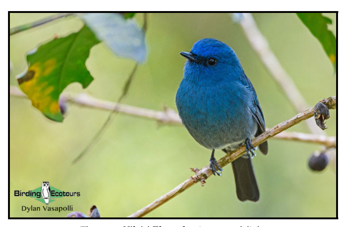
The pretty Nilgiri Flycatcher is sure to delight.