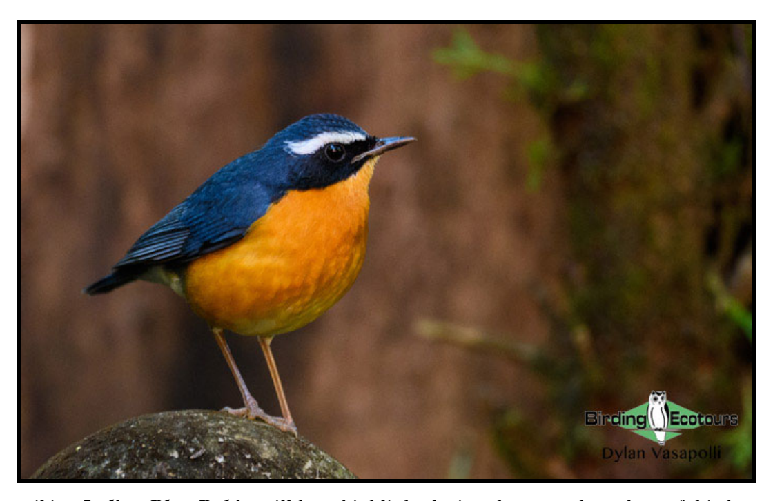
The striking Indian Blue Robin will be a highlight during the tour; the colors of this beautiful bird are just incredible.

We can also easily offer you birding, wildlife-watching, or cultural extensions at each location if you would like to extend your stay in this wonderful, diverse, and vibrant country.