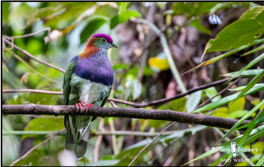
A potential future split, (Western) Superb Fruit Dove gave some remarkable views.

In the afternoon we headed back out into the national park again and enjoyed more great birds, until the rain came and ended things prematurely. Some of the top picks included an incredibly showy pair of (Western) Superb Fruit Doves , Grey-headed Imperial Pigeon , White-bellied Imperial Pigeon , Sulawesi Hawk-Eagle , Crimson Sunbird , and a gorgeous Fiery-browed Starling giving the best views so far.