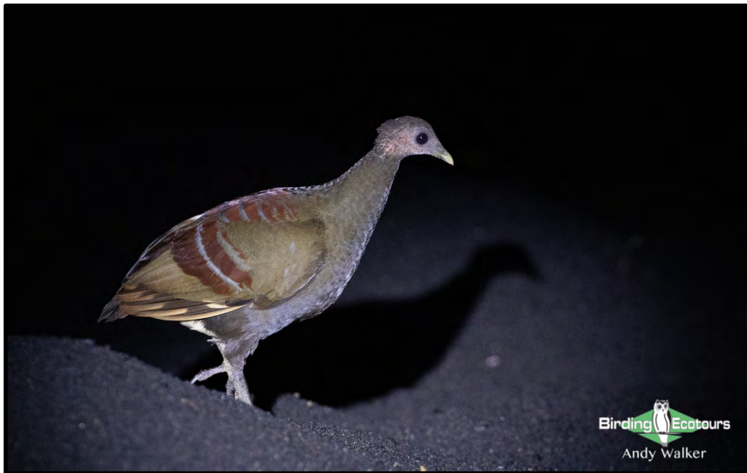
Moluccan Megapode was a massive highlight on the Halmahera leg of this tour.

We recorded 232 species on the tour (nine of these heard only). Some of the birding highlights included Moluccan Megapode , Maleo , White (Umbrella) Cockatoo , Moluccan King Parrot , Golden-mantled Racket-tail , Moluccan Hanging Parrot , Knobbed Hornbill , Sulawesi Hornbill , Blyth's Hornbill , Goliath Coucal , Sulawesi Hawk-Eagle , Gurney's Eagle , Pygmy Eagle , Barred (Sulawesi) Honey Buzzard , Sulawesi Masked Owl , Eastern Grass Owl , Ochre-bellied Boobook , Speckled Boobook , Halmahera Boobook , Satanic Nightjar , Scaly-breasted Kingfisher , Green-backed Kingfisher , Sulawesi Lilac Kingfisher , Great-billed Kingfisher , Blue-and-white Kingfisher , Sombre Kingfisher , Common (Halmahera) Paradise Kingfisher , Purple-bearded Bee-eater , Halmahera Paradise-crow , (Wallace's) Standardwing , Hylocitrea , Malia , Lompobattang Flycatcher , and Lompobattang Leaf Warbler .