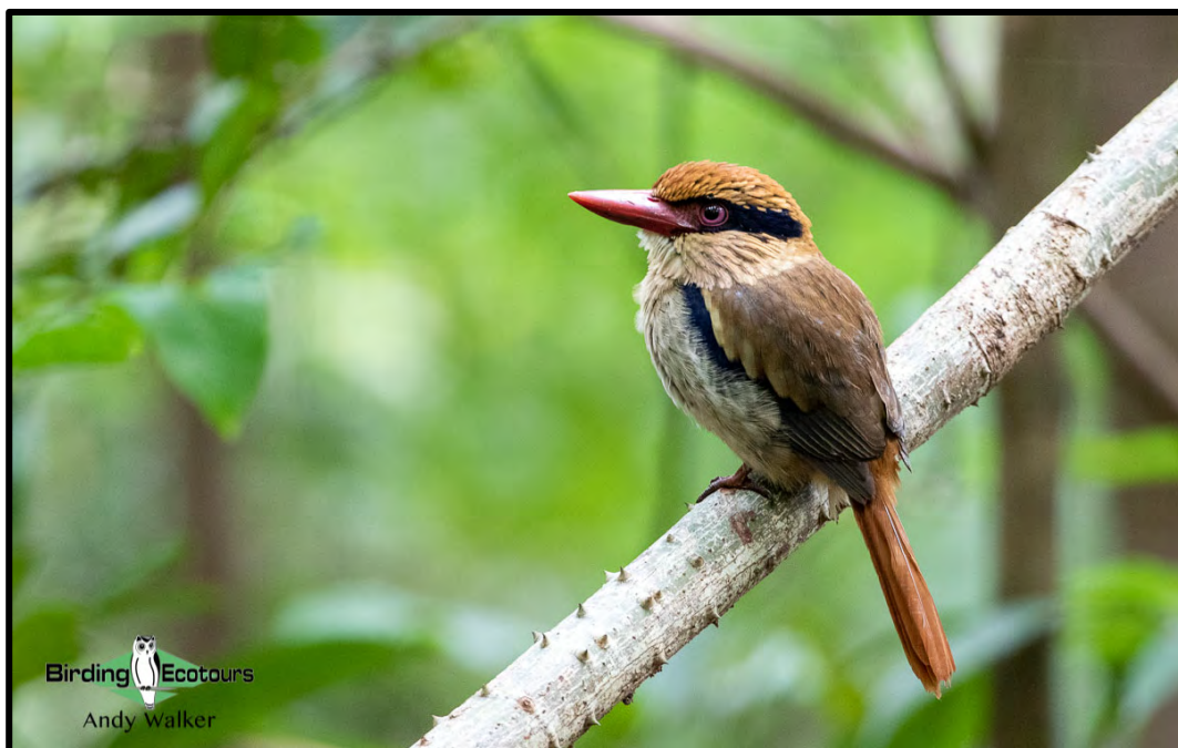
Sulawesi Lilac Kingfisher was one of several kingfisher species enjoyed on the tour.

We had another walk in the park during the afternoon and picked up some more bird sightings, including Purple-winged (Sulawesi) Roller , but best of all was our sightings of a few Gursky's Spectral Tarsiers , magnificent little critters!