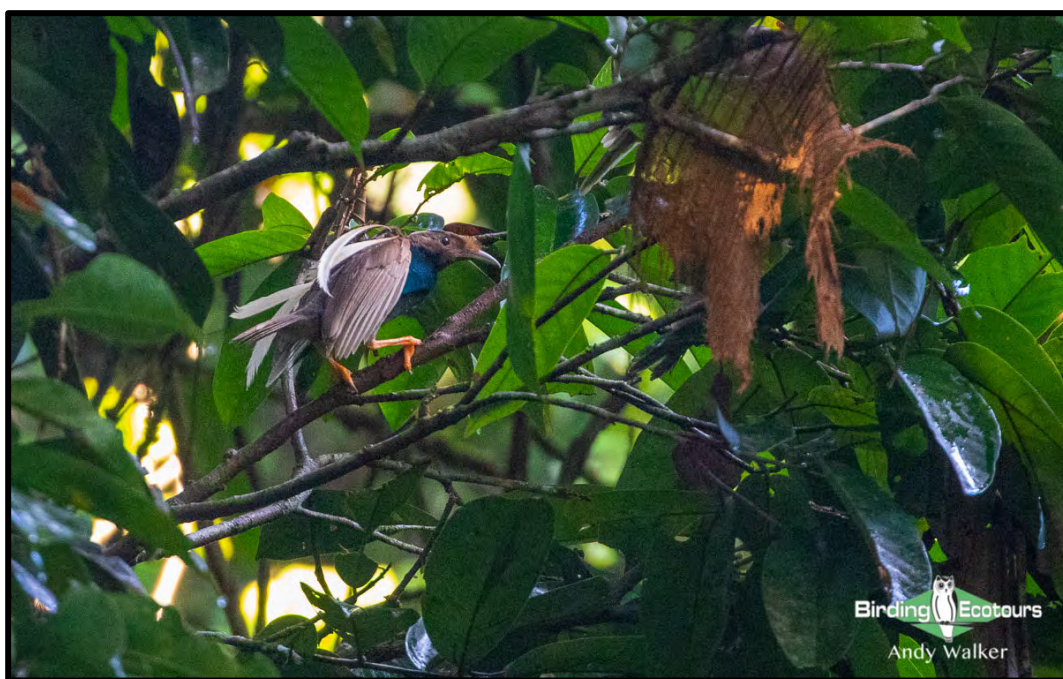
This male (Wallace's) Standardwing (Bird-of-paradise) was attracting three females!

We had a very long day, but it was well worth it with loads of great birds. An early start saw us in a 4x4 vehicle climbing into a patch of forest where we had fleeting glimpses of a pair of Halmahera Boobooks . Shortly afterwards we commenced our hike down a slope and got into place as the sounds of the forest came alive with the introduction of our main target for the day, the impressive (Wallace's) Standardwing (Bird-of-paradise). We spent quite a bit of time watching the birds at their lek, one male attracting the attention of three females! After enjoying our time with these great birds we hiked back up the hill and enjoyed breakfast in the forest. We then took a walk along road in some partially logged forest, this walk yielded some great birds, including Moluccan Monarch , Moluccan Flycatcher , White-naped Monarch , Moluccan Cuckooshrike , Rufous-bellied Triller , Common Cicadabird , Dusky-brown (Halmahera) Oriole , (Halmahera) Spangled Drongo , Drab Whistler , Moluccan Myzomela , and Pacific Baza . The trail was also alive with butterflies and dragonflies, which provided lots of distractions!