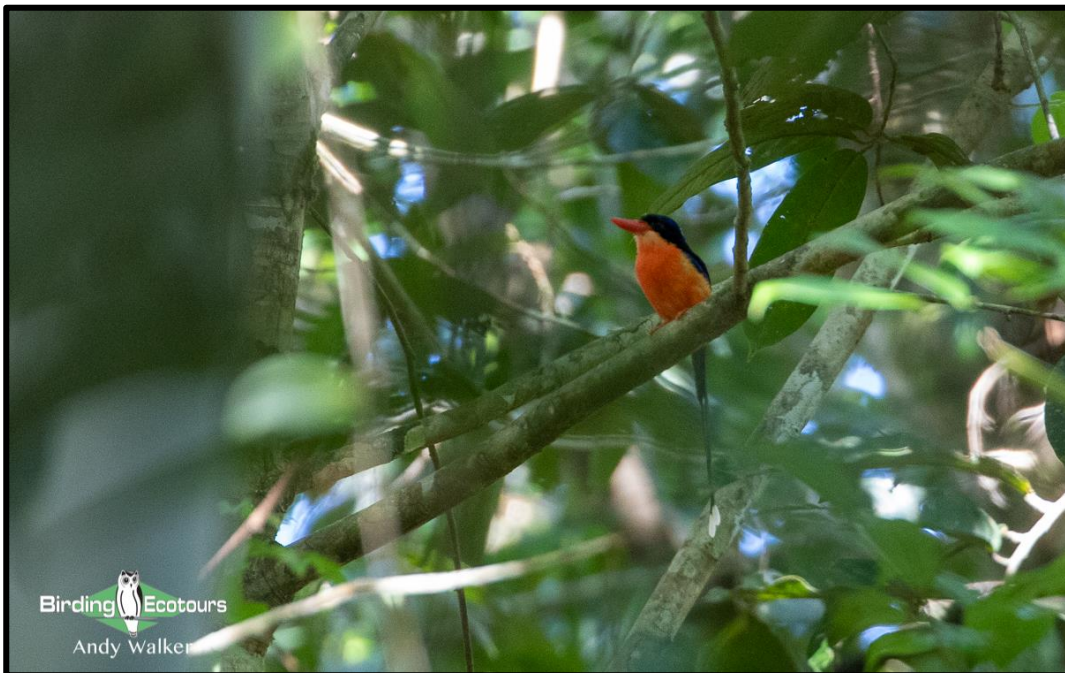
The locally distributed Red-breasted Paradise Kingfisher was a big target for our birding near Sorong, and we got some good looks at this attractive species.