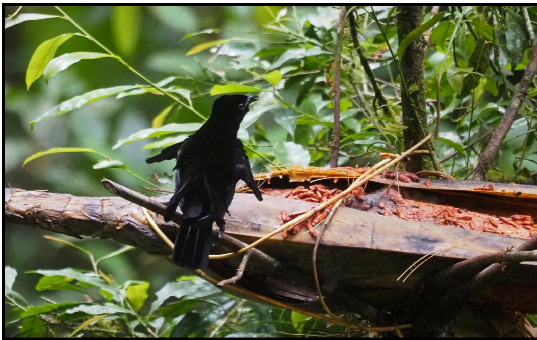
The bizarrely shaped Crescent-caped Lophorina.

After enjoying the birds-of-paradise we commenced our walk out of the forest, noting Slater’s Whistler , Vogelkop Whistler , Capped White-eye , Arfak Honeyeater , Friendly Fantail , Black Fantail , Slaty Robin , Rusty Mouse-warbler , Large Scrubwren , and Vogelkop Scrubwren . As we reached the road the clouds descended and stayed like that (with some rain) for most of the rest of the day.