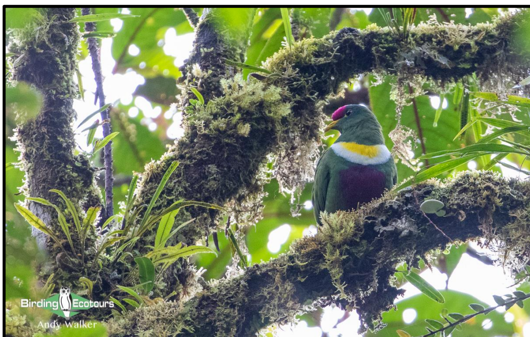
The stunning White-bibbed (Mountain) Fruit Dove was one of many attractive features of the birding while in the Arfak Mountains, and one of many stunning pigeons seen on the tour.

Those of us camping in the high elevation zone headed out early into the beautiful mossy forest, where we searched for, then found a feeding male Arfak Astrapia . This large bird-of-paradise gave some good views and was the last of our major bird-of-paradise targets for this overnight trip. Other good birds seen on the mountain and on the trek down, included (Western) Ornate Fruit Dove , White-bibbed (Mountain) Fruit Dove , Papuan Mountain Pigeon , Modest Tiger Parrot , Pygmy Lorikeet , Papuan Lorikeet , Vogelkop Bowerbird , Cinnamon-browed Melidectes , Vogelkop Melidectes , Long-tailed Paradigalla , and Crescent-caped Lophorina .