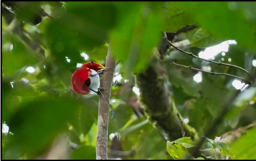
The rather small King Bird-of-paradise was yet another attractive bird-of-paradise that we enjoyed on the tour.