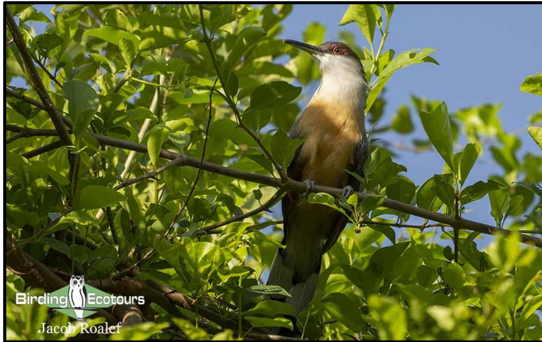
Yet another of our endemic targets; Jamaican Lizard Cuckoo .