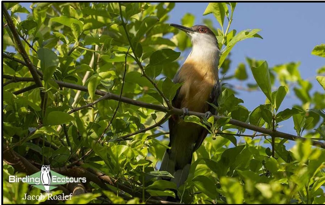
Yet another of our endemic targets; Jamaican Lizard Cuckoo .