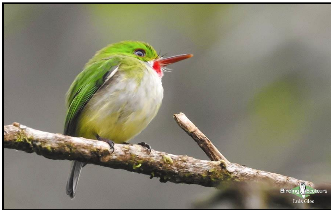
The endemic Jamaican Tody is one of our special targets on this trip.

Overnight: Starlight Chalet. This is basic accommodation but is in the best position for birding.