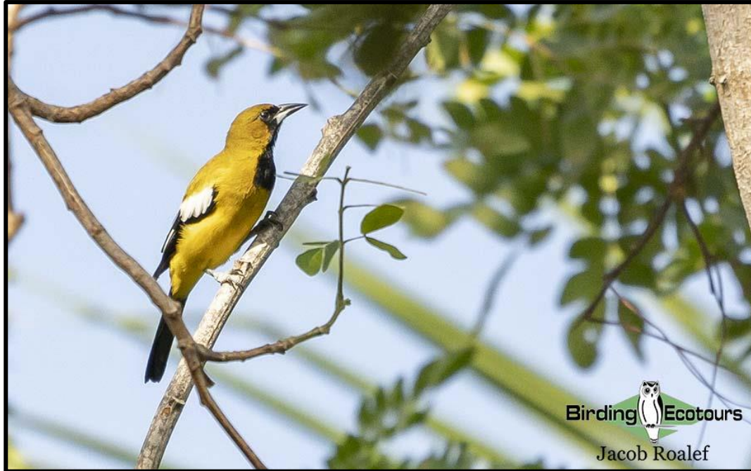
Jamaican Oriole can be seen around Starlight Chalet.