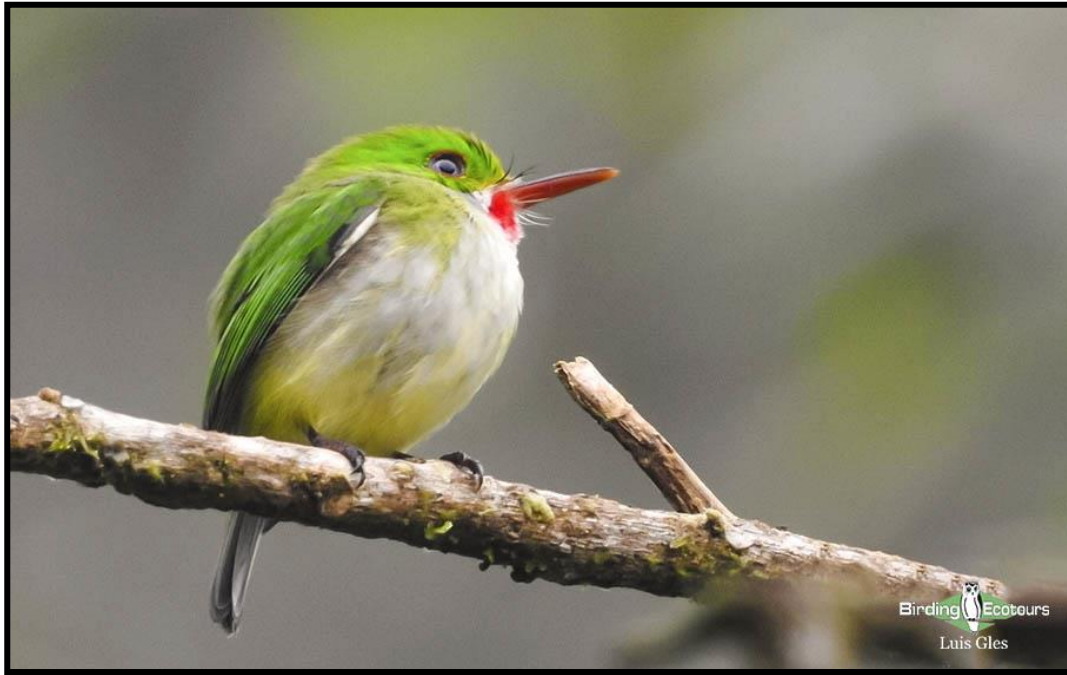
The endemic Jamaican Tody is one of our special targets on this trip.

Overnight: Starlight Chalet. This is basic accommodation but is in the best position for birding.