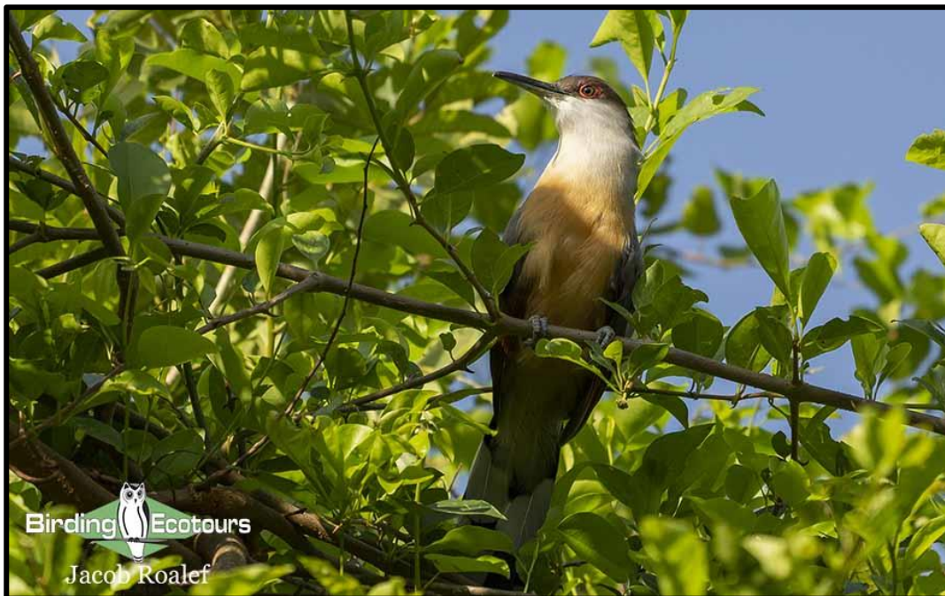
Yet another of our endemic targets; Jamaican Lizard Cuckoo.