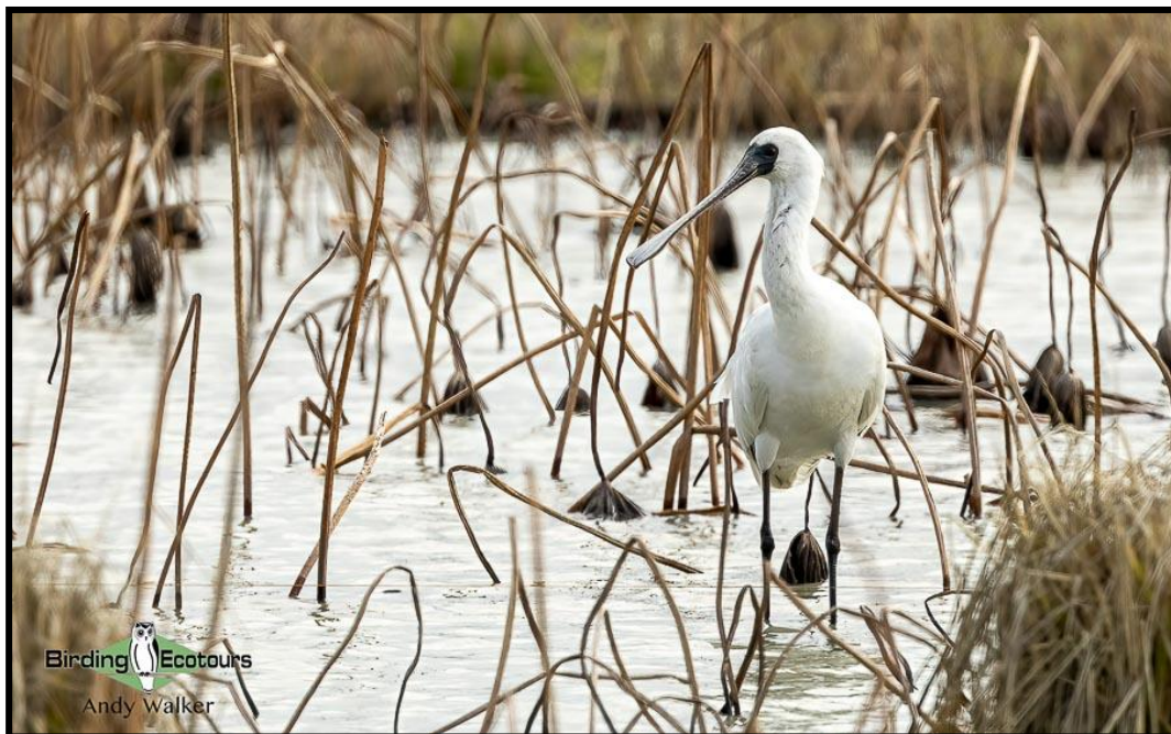
Black-faced Spoonbill may be seen around Tokyo Bay.

Our first day can be spent at your leisure, or we could go enjoy some fine Tokyo birding. As we will have just completed our main tour, we will see if there are any species the group has not seen properly yet or if there are any potential new species available to us. There are sure to be loads of great birding options on offer, Tokyo Bay in the winter is a fantastic birding area, particularly for wildfowl and gulls.