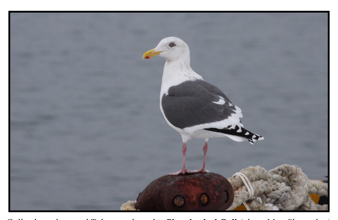
Gulls abound around Tokyo, such as this Slaty-backed Gull (photo Matt Slaymaker).

Our first day will see us birding around Tokyo. As we will have just completed our main tour, we will see if there are any species the group has not seen properly yet or if there are any potential new species available to us (we will have also spent a week birding on Honshu – the island home to Tokyo – right at the beginning of the tour). There are sure to be loads of great birding options on offer, Tokyo Bay in the winter is a fantastic birding area, particularly for wildfowl and gulls.