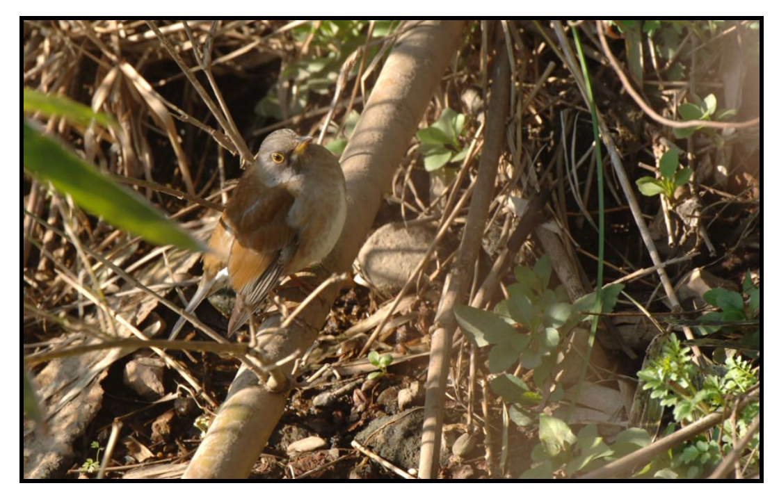
Pale Thrush is one of several thrush species we will be looking for on Miyake-Jima, the others being Izu Thrush and Brown-headed Thrush.

billed Crow, Japanese Tit, Brown-eared Bulbul, Japanese Bush Warbler, Warbling Whiteeye, Eurasian Wren, Pale Thrush, Red-flanked Bluetail, Eurasian Bullfinch, Grey-capped Greenfinch, Eurasian Siskin, Meadow Bunting, and Black-faced Bunting.