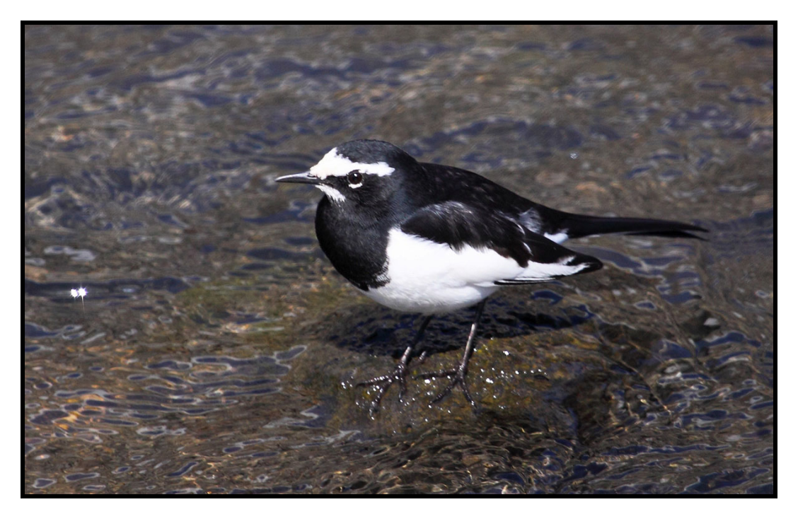
Japanese Wagtail is one of the localized passerines that can be found around Tokyo.

cheeked Starling, Brown-headed Thrush, Pale Thrush, Dusky Thrush, Red-flanked Bluetail, Blue Rock Thrush, Grey Wagtail, Japanese Wagtail, White Wagtail, (Japanese) Buff-bellied Pipit, Hawfinch, Grey-capped Greenfinch, Meadow Bunting, Common Reed Bunting, Rustic Bunting, Black-faced Bunting, and Grey Bunting. There is lots on offer here!