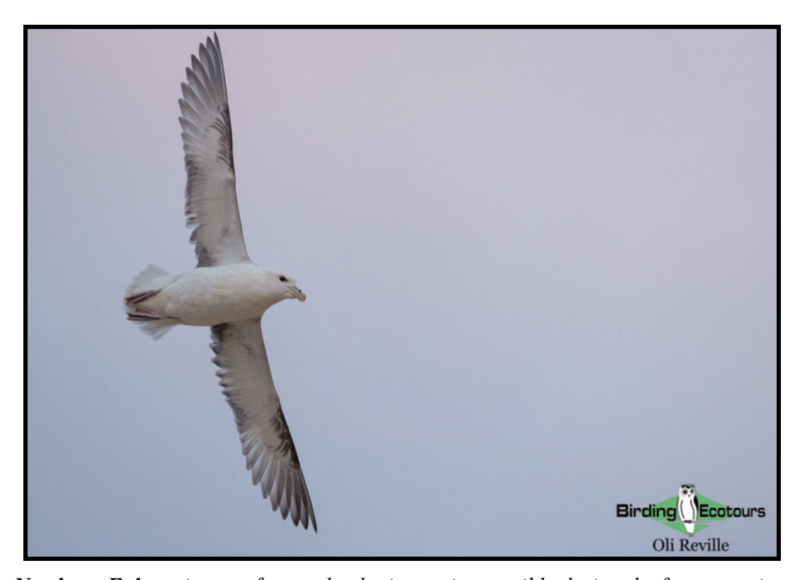
Northern Fulmar is one of several pelagic species possible during the ferry crossing.