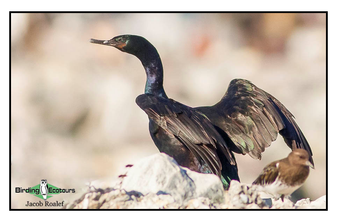
Pelagic Cormorant can be found around Tokyo and should be seen on this extension.