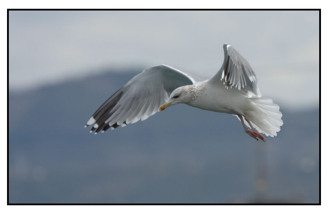
Vega Gull will be one of many gull species encountered around Tokyo.

One group of birds we might like to look at here are the gulls. Numerous species and subspecies thereof, can be found, including Slaty-backed Gull , Glaucous-winged Gull , Mew (Common) Gull , of the kamtschatschensis subspecies, a possible future split as Kamchatka Gull, Black-legged Kittiwake , Black-tailed Gull , Vega Gull , treated as part of the widespread "Herring Gull" complex by some authorities (of either the vegae subspecies or the mongolicus subspecies – a potential further split as Mongolian Gull), Black-headed Gull , Iceland Gull , of the thayeri subspecies formerly known as Thayers Gull, Glaucous Gull , Lesser Black-backed Gull , of the heuglini subspecies split by some as Heuglin's Gull, and maybe even the rare (classified as Vulnerable by <u>BirdLife International</u>) Saunders's Gull . Identifying the gulls here is sure to be an educational, and hopefully, very rewarding experience!