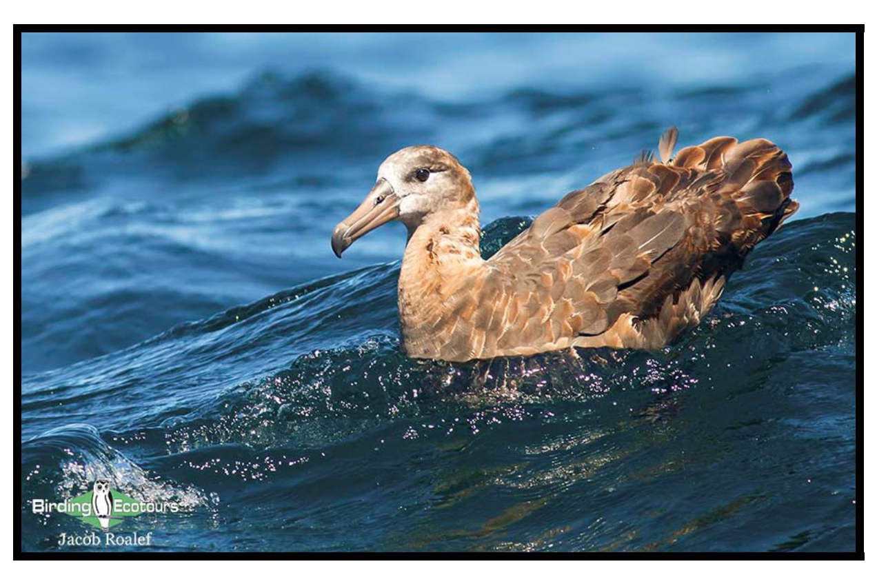
Black-footed Albatross is one of three albatross species possible on this short extension.