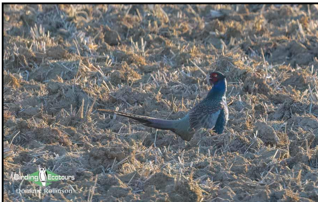
Green Pheasant, one of several Japanese endemics we will be looking for on this tour.

Please note, depending on availability of services (and other factors beyond our control) we may have to switch the ordering of the three islands/legs of this trip. We will, however, ensure we spend the same number of nights as described below, and target the same species.