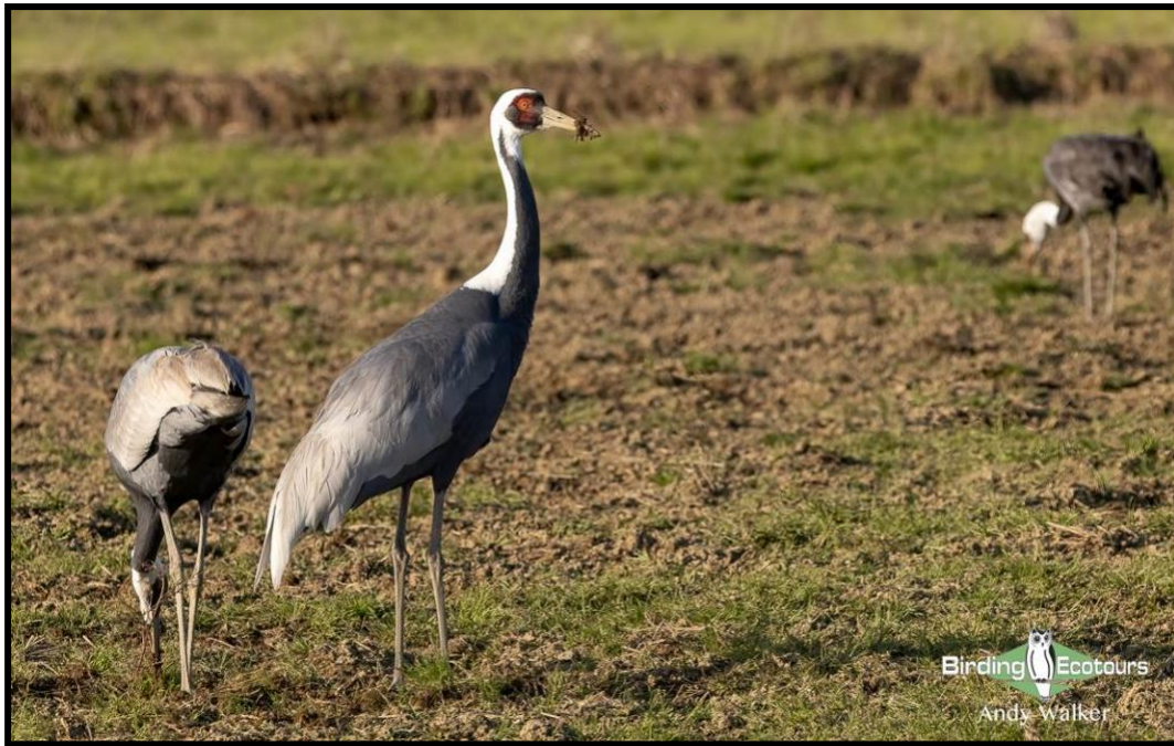
White-naped Crane will be enjoyed on our Japan birding tour.

This Japanese winter birding tour is designed around the spectacular gatherings of cranes and sea eagles which make Japan their winter home, as well as a range of Japanese endemic birds on offer. The first leg of this Japan bird tour will be around the island of Kyushu, this will be the furthest southwest we venture, and here we will search for the localized Japanese Murrelet and the wintering hordes of Hooded Cranes and White-naped Cranes , with an accompanying cast of other winter visitors, which may include tough world birds like Black-faced Spoonbill and Saunders's Gull .