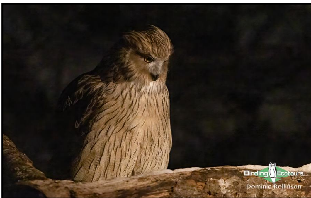
Blakiston's Fish Owl is one of the special targets on this tour.

This trip could well be one of the tour highlights (and that is quite something, given what we will have already experienced!). Along with excellent looks at the sea eagles, we could find other exciting species like White-tailed Eagle , Harlequin Duck , Long-tailed Duck , Common Goldeneye , Common Murre (Common Guillemot), Spectacled Guillemot , Black-tailed Gull , Slaty-backed Gull , Glaucous Gull , Glaucous-winged Gull , Common (Kamchatka) Gull , Red-throated Loon (Red-throated Diver), Black-throated Loon (Black-throated Diver), Pacific Loon (Pacific Diver), Pelagic Cormorant , and Japanese Cormorant .