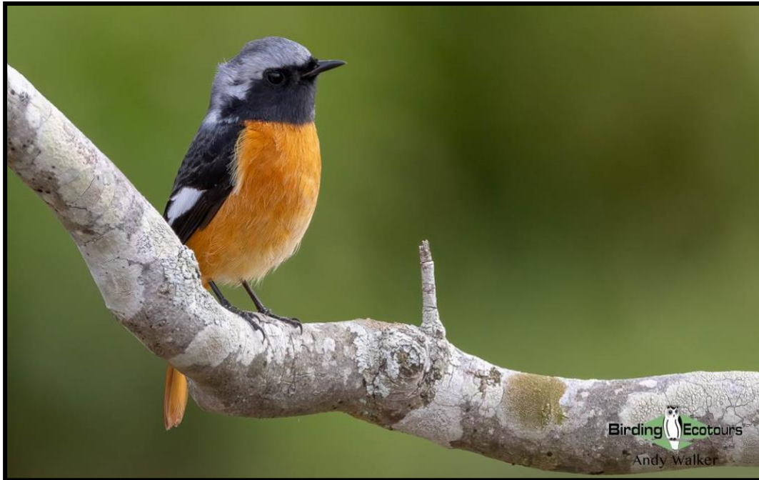
Daurian Redstart adds a splash of color to the Japanese woodlands.