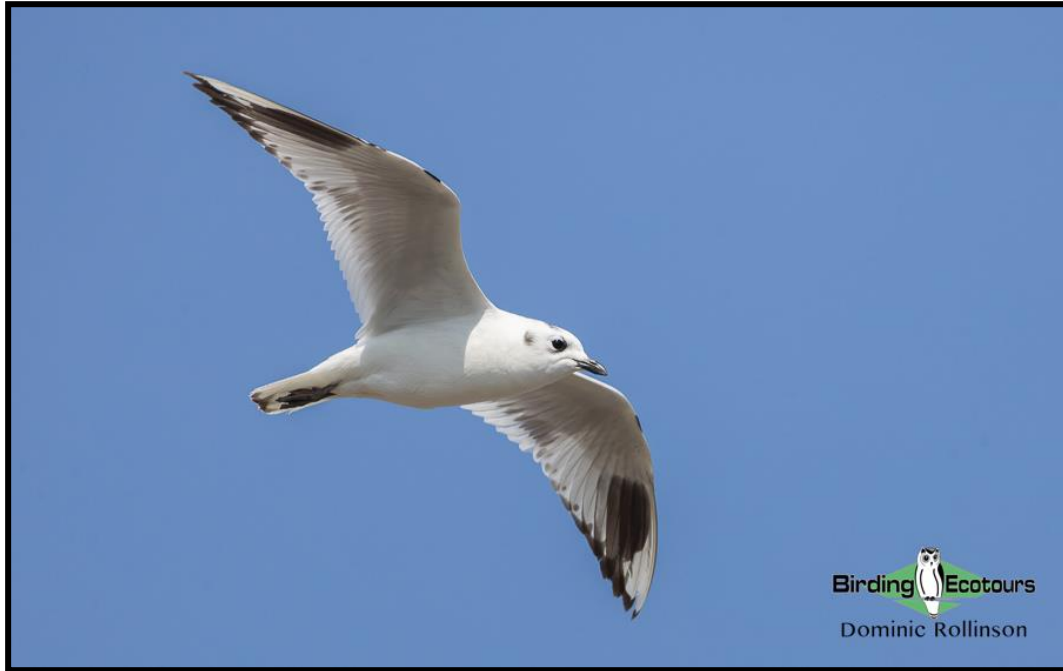
Gulls abound in Japan, such as this Saunders's Gull .