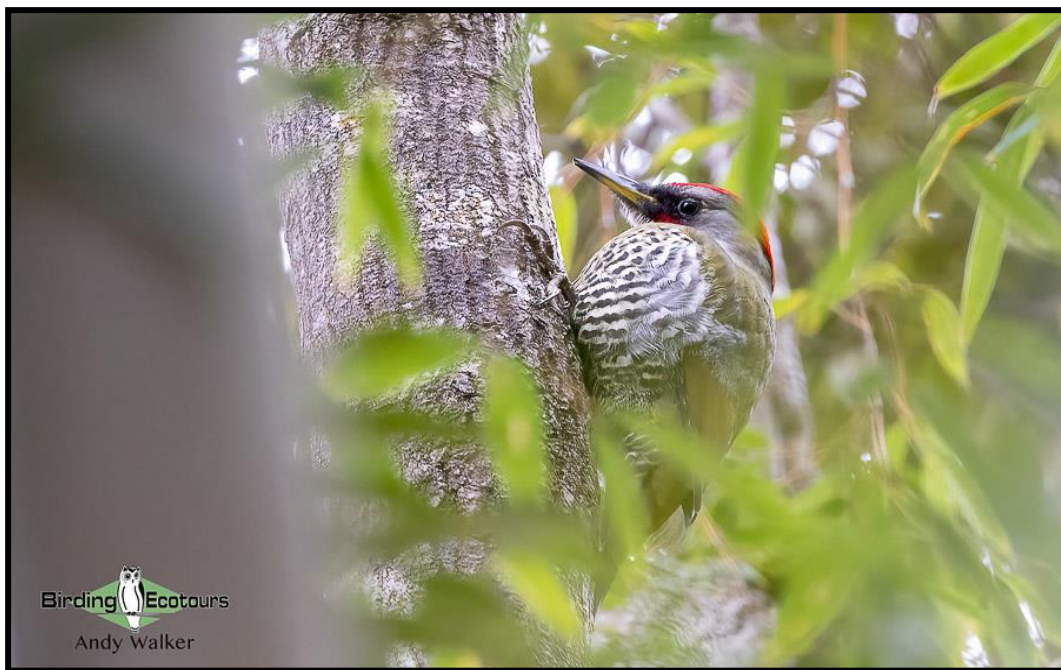
The endemic Japanese Green Woodpecker can be seen around Kogawa Reservoir.

We often see interesting passerines in the area too, such as Bull-headed Shrike , (Eastern) Rook , Daurian Jackdaw , Varied Tit , Chinese Penduline Tit , Eurasian Skylark , Zitting Cisticola , Asian House Martin , Russet Sparrow , Red-flanked Bluetail , Pale Thrush , Red-throated Pipit , Siberian Pipit , and several bunting species, including Yellow-throated Bunting , Meadow Bunting , and Common Reed Bunting .