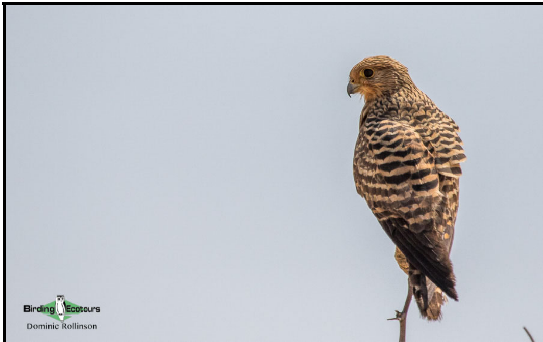
Raptors such as Greater Kestrel are common throughout the Kalahari.

Overnight: Kgalagadi Lodge (just outside the Kgalagadi Transfrontier Park)