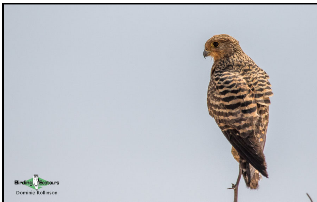
Raptors such as Greater Kestrel are common throughout the Kalahari.

Overnight: Kgalagadi Lodge (just outside the Kgalagadi Transfrontier Park)