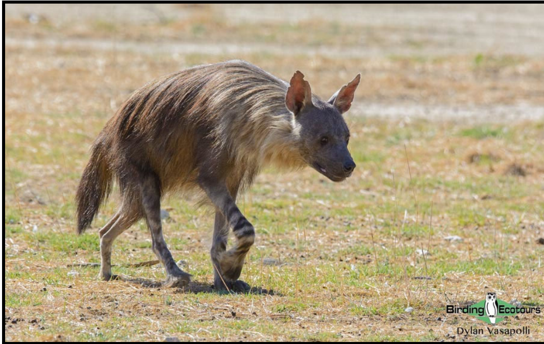
The Kgalagadi Transfrontier Park is one of the best places to find Brown Hyaena .

The vast Kalahari area is semi-desert, where some very tough African mammals can be found relatively easily. Moreover, it has a lot of mammals (notably smaller ones) that are only very rarely seen anywhere else and most certainly are not found on your typical Serengeti or Kruger safari. We invite you on a spectacular African experience that you will not forget in a hurry.