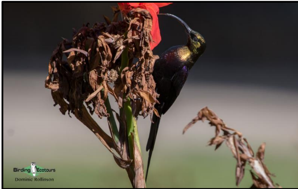
Tacazze Sunbird is one of the many beauties we will look for at Thomson's Falls.

We'll depart, after breakfast, for Olpajeta Wildlife Conservancy , allowing time to search for several key species along the way. We will also have a stopover at Thomson's Falls at Nyahururu which is one of Kenya's highest towns, at 7,700 feet (2,360 meters) above sea level. Just outside the town lies Thomson's Falls on the Ewaso Narok River. It falls an impressive 230 feet (72 meters), with the mist feeding the dense forest below. At Thomson's Falls we're likely to see Chestnut-winged and Slender-billed Starlings , Rock Martin , Grey Cuckooshrike , Kikuyu White-eye , and Tacazze and Collared Sunbirds . We will have our lunch here before proceeding to Olpajeta, however we will have a stop en route at Wajee Camp to look for the Vulnerable (IUCN) Kenyan endemic Hinde's Babbler as well as Holub's Golden Weaver .