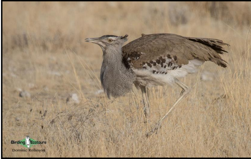
The massive Kori Bustard is often seen strolling across the open plains.

like a sudden surprising, stunning outlook from a viewpoint at the top of the escarpment over the width of the Great Rift Valley , with Rock Hyraxes also enjoying the view. All kinds of spectacular birds along with large (and small!) game animals abound, including Grey Crowned Crane , Secretarybird , Common Wildebeest , Thomson's Gazelle , Plains Zebra , Impala , Black-backed Jackal , Common Duiker , Vervet Monkey , and even (Maasai) Giraffe – roaming freely in the fields and using the roads together with the traffic, long before we even enter any game reserve.