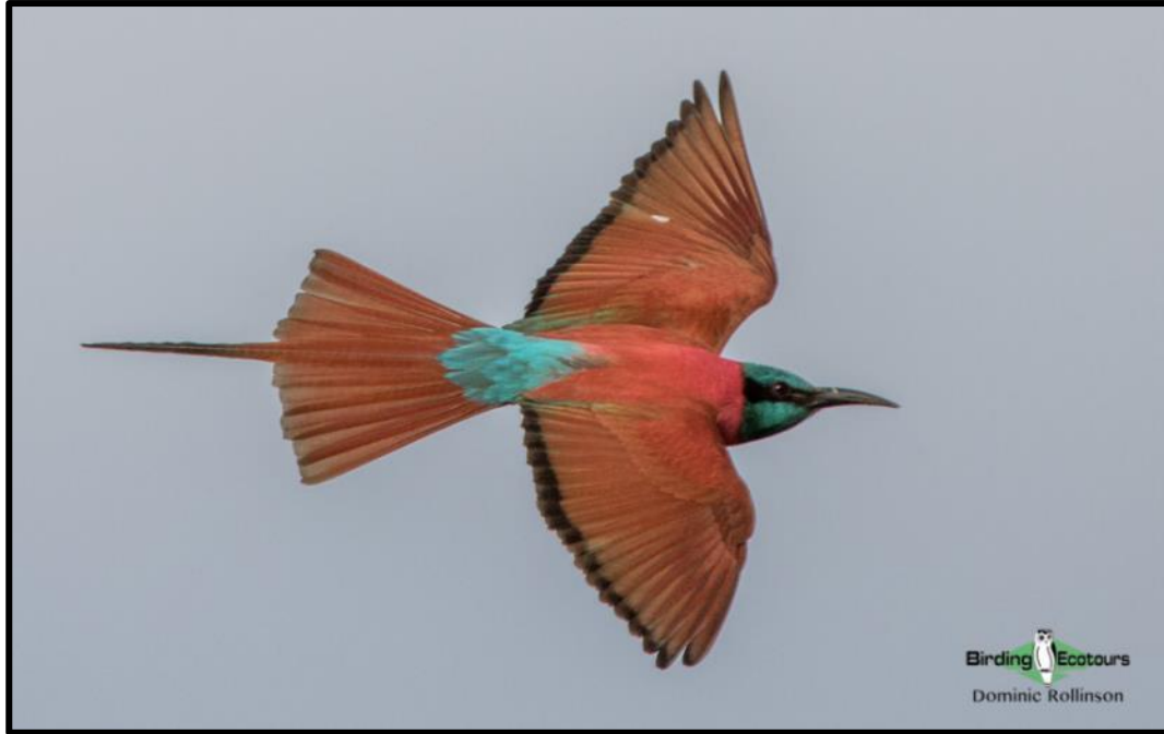
The vivid colors of Northern Carmine Bee-eater will leave you awestruck.

After a two-hour boat ride, we have an hour or so to search for terrestrial beauties here like Eastern Violet-backed Sunbird , Spotted Palm Thrush and Abyssinian Roller among others, before we break for lunch. In the late afternoon we resume birding, now along the cliffs, looking for Hemprich's Hornbill , Bristle-crowned Starling , Verreaux's Eagle , and Rock Hyrax , the eagle's main prey. With the help of a local naturalist, we'll walk along the famous Tugen Hills, known for their great diversity of raptors and owls, as well as interesting passerines. Here we hope to find Three-banded Courser , Slender-tailed Nightjar , Greyish Eagle-Owl , Verreaux's Eagle-Owl , Pearl-spotted Owlet , Lichtenstein's Sandgrouse , White-bellied Canary , Brown-tailed Rock Chat , Jackson's Hornbill , Speckle-fronted Weaver , White-billed and White-headed Buffalo Weavers , Dark Chanting Goshawk , African Grey and Nubian Woodpeckers , Red-and-yellow and D'Arnaud's Barbets , and Purple Roller , and many others.