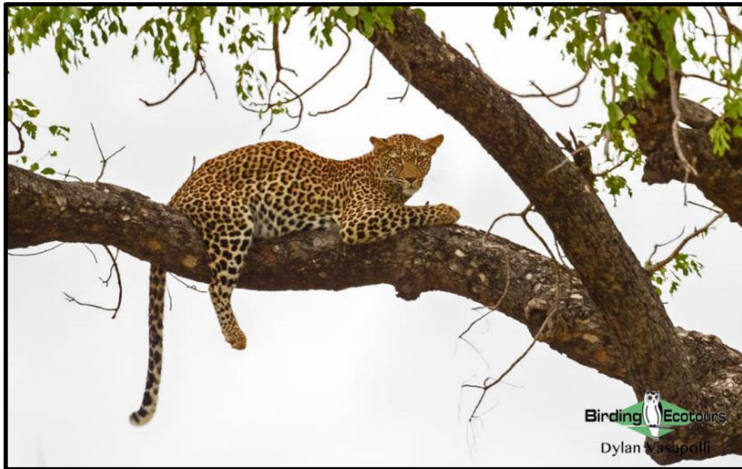
We stand an excellent chance of seeing Leopard in the Sabi Sands.

almost guaranteed – these are Lion, Leopard, African Elephant, African Buffalo and (White/Black) Rhinoceros (although Black Rhinoceros does remain the trickiest of them to find). Although named for being the five most dangerous animals to hunt many years ago, these are generally the pinnacle of game and mammal sightings in Africa, and are often the most prized. While we would have likely seen some of these mammals in the Kruger National Park already, our views, encounters and experiences of these animals in the Sabi Sands will not be easily bettered. In addition, however, we also have good chances at finding some of the other scarcer mammals and predators in the area, with Cheetah and African Wild Dogs high on our wish-list as well.