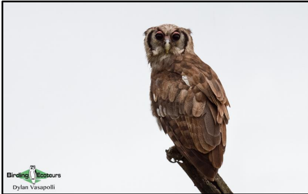
The large Verreaux's Eagle-Owl occurs in the area, often roosting in tall riverine woodland.