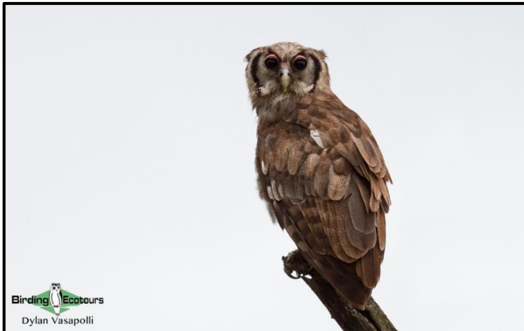
The large Verreaux's Eagle-Owl occurs in the area, often roosting in tall riverine woodland.