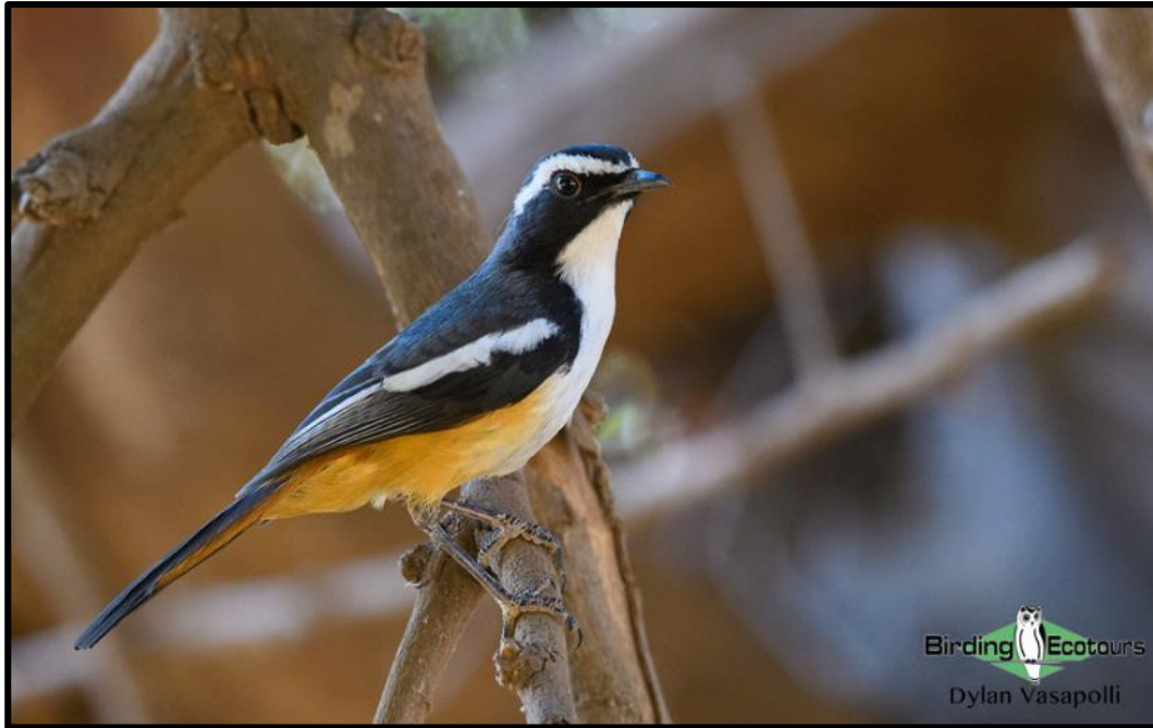
The near-endemic White-throated Robin-Chat (above) occurs in the denser stands of woodland

Egret and Hamerkop. The rest camps within the park are also generally a great place to see owls, with Pearl-spotted Owlet , Western Barn and African Scops Owls widely distributed, with African Barred Owlet a bit more localized. These are only a small example of some of the species we're likely to see during our time in the park.