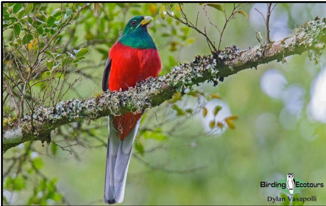
The glorious Narina Trogon is a target in the forests at Mount Sheba.

Overnight: Mount Sheba Lodge, Pilgrim's Rest