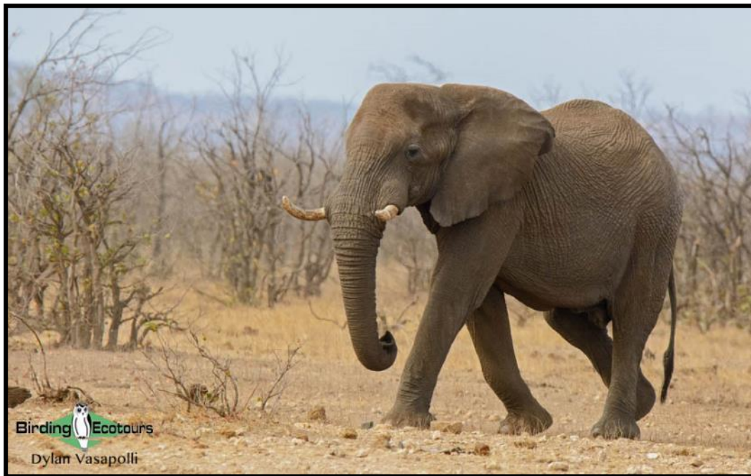
Massive African Elephants are a regular feature in the Kruger.

The tour as detailed below is great for first-time visitors to South Africa, or Africa, as it focuses on the bird-rich and mammal-rich southern parts of the Greater Kruger. We ensure we spend time in both the Kruger National Park and the exclusive Sabi Sands Game Reserve , to give you the best possible 'safari', with a combined focus on the birds and mammals. Game drives on open-sided safari vehicles, in both the Kruger National Park and the Sabi Sands are the order of our days here, as we track down as many birds and mammals as we can. In addition, this area is also relatively close to the major hub of Johannesburg, which is South Africa's largest city, and is easily accessed. The combination of a never-ending stream of mammals, including The Big 5 , and some excellent introductory African birding will leave you wanting more.