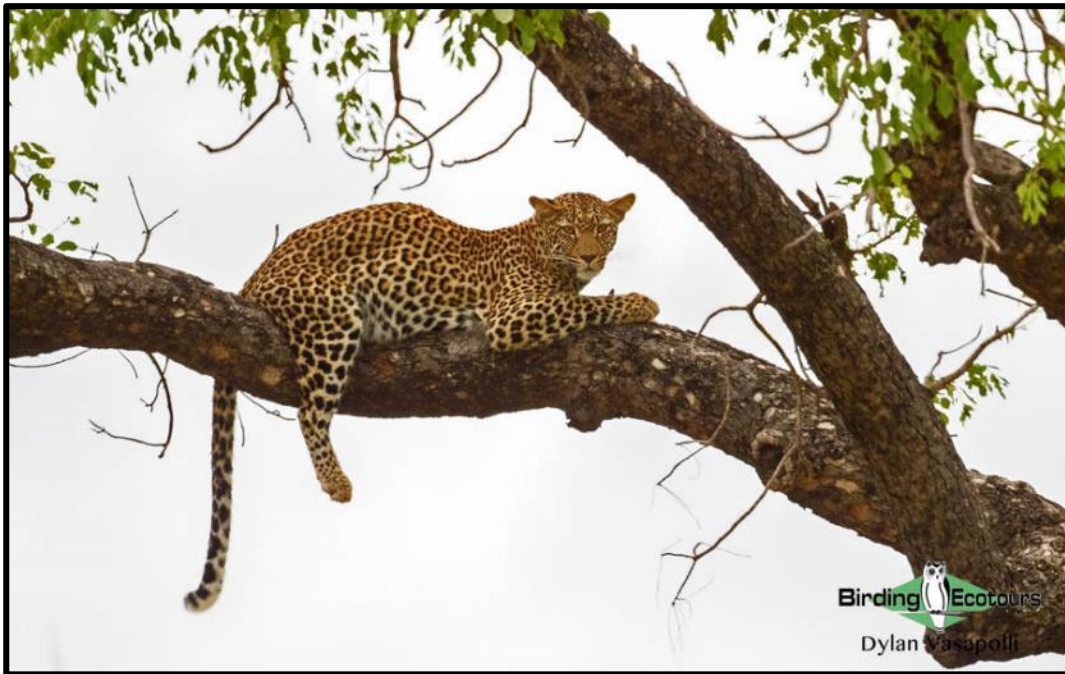
We stand an excellent chance of seeing Leopard in the Sabi Sands.

almost guaranteed – these are Lion, Leopard, African Elephant, African Buffalo and (White/Black) Rhinoceros (although Black Rhinoceros does remain the trickiest of them to find). Although named for being the five most dangerous animals to hunt many years ago, these are generally the pinnacle of game and mammal sightings in Africa, and are often the most prized. While we would have likely seen some of these mammals in the Kruger National Park already, our views, encounters and experiences of these animals in the Sabi Sands will not be easily bettered. In addition, however, we also have good chances at finding some of the other scarcer mammals and predators in the area, with Cheetah and African Wild Dogs high on our wish-list as well.