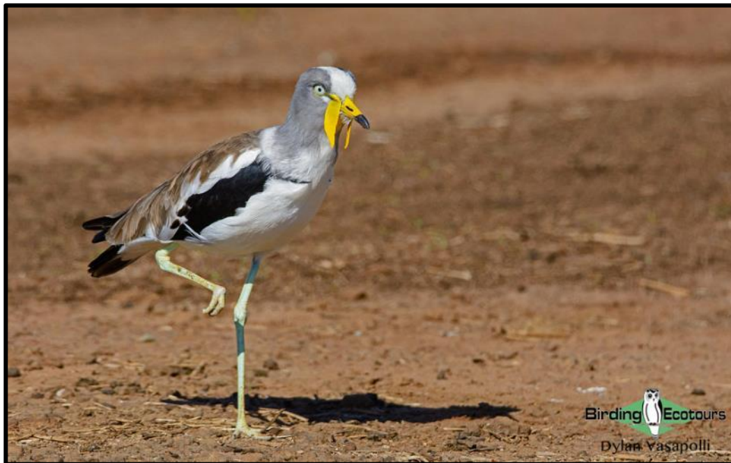
White-crowned Lapwing is localized only occurring on the larger rivers.