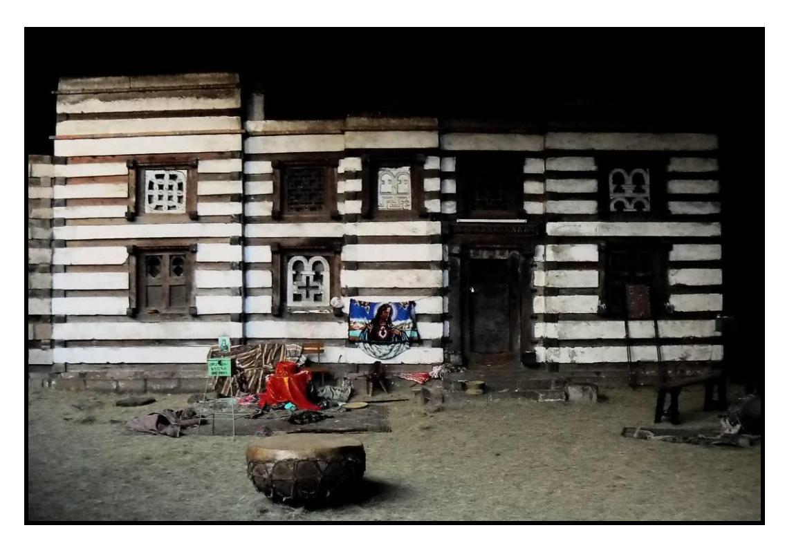
The cave church of Yemrehana Krestos.