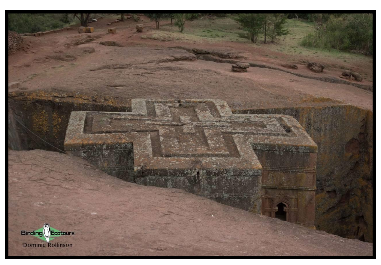
Bet Giyorgis is the most famous of the rock churches at Lalibela.