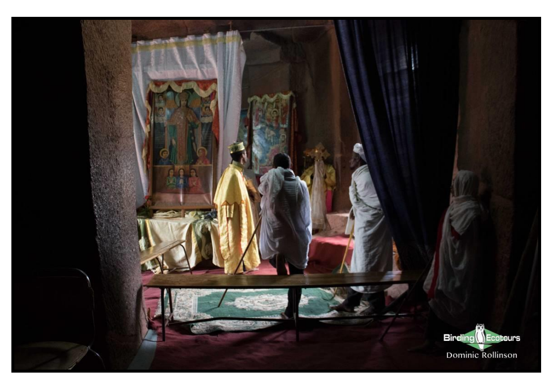
A typical scene inside one of Lalibela's many rock-hewn churches.

This extension to our 19-day Complete Abyssinia birding tour can also be booked as a standalone tour.