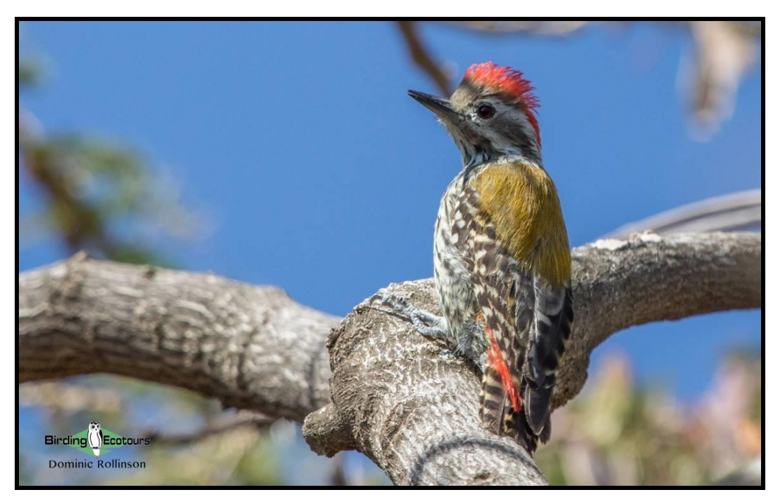
Abyssinian Woodpecker may be seen in Addis Ababa.

Overnight: Ghion Hotel, Addis Ababa, or similar