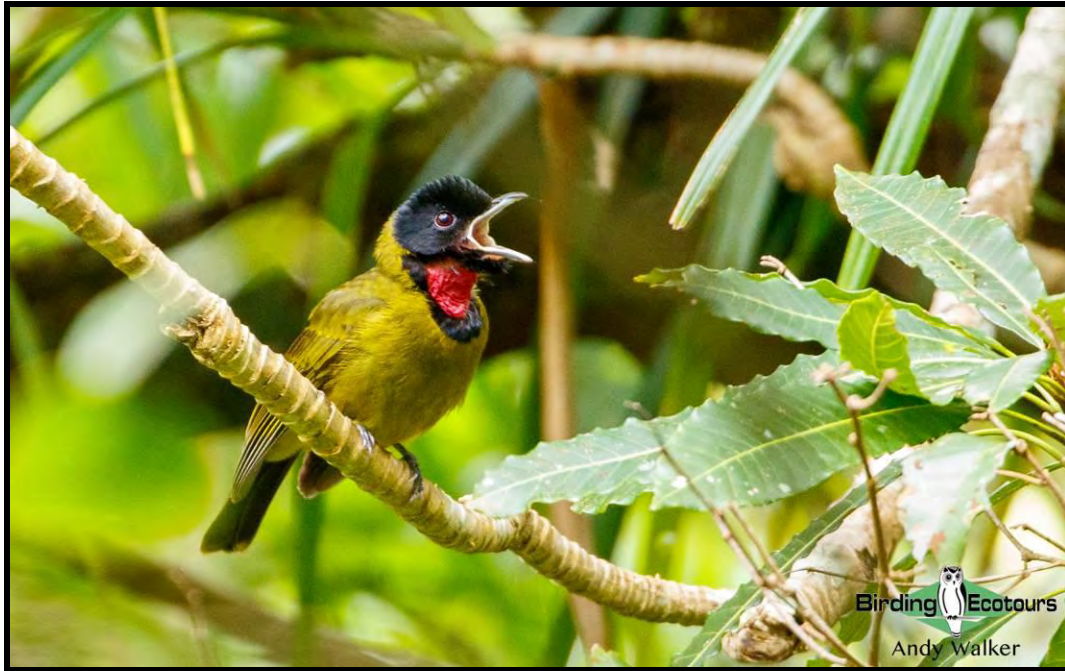
Bare-throated Whistler is one incredible songster.

Scops Owl, Bare-throated Whistler (the song of this one will blow your mind!), Flores Shortwing, Flores Jungle Flycatcher, Crested White-eye (Heleia), Little (Flores) Minivet, Golden-rumped Flowerpecker, Pale-shouldered Cicadabird, and Chestnut-backed Thrush.