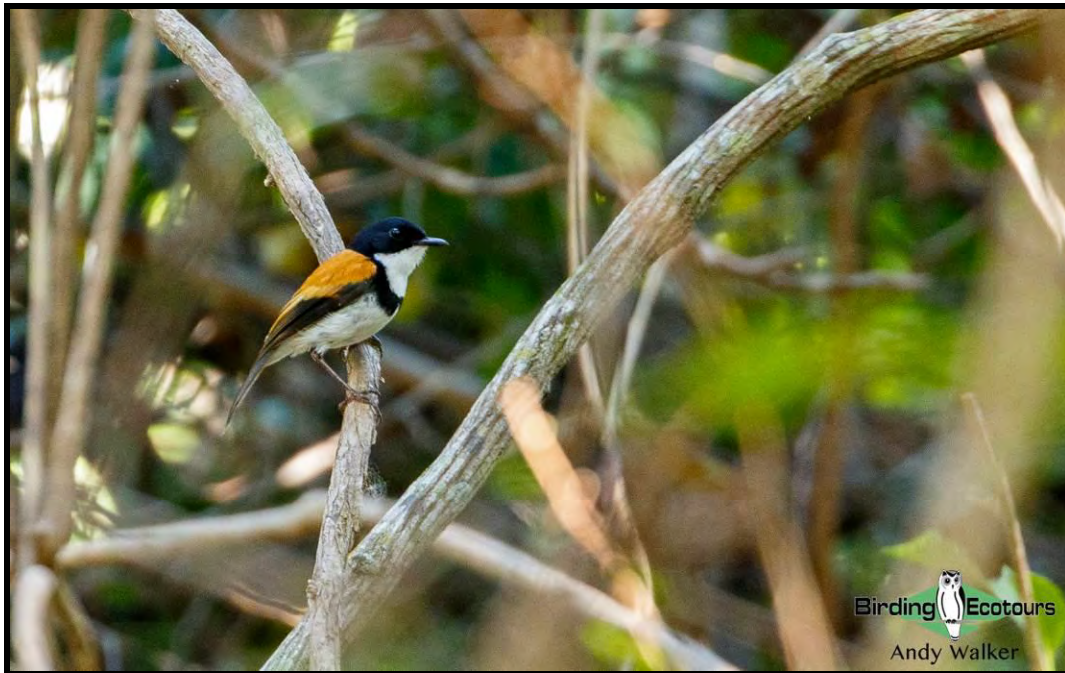
Black-banded Flycatcher, striking even by Ficedula standards and endemic to Timor.