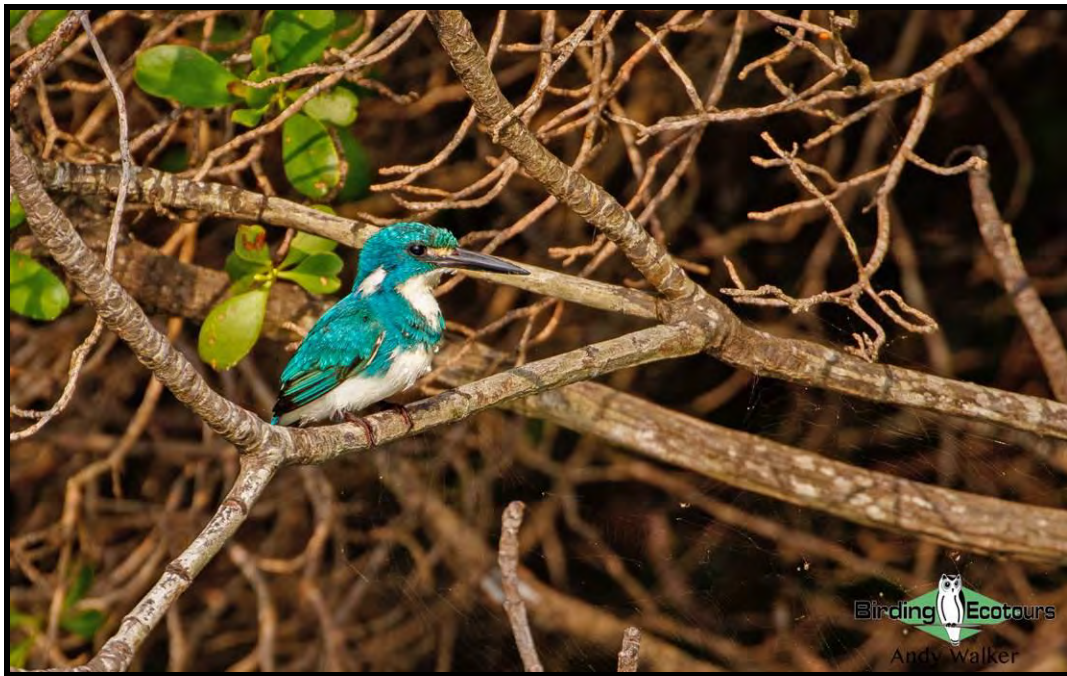
Plenty of beautiful kingfishers can be found on this Lesser Sunda birding tour, and Cerulean Kingfisher is one of those.

Overnight: Purisari Beach Hotel, Labuan Bajo