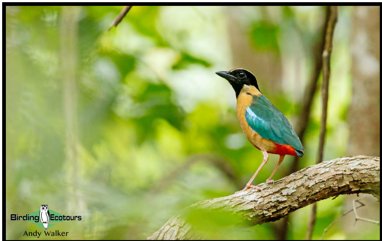
Elegant Pitta, one of many exciting targets on this multi-island tour.