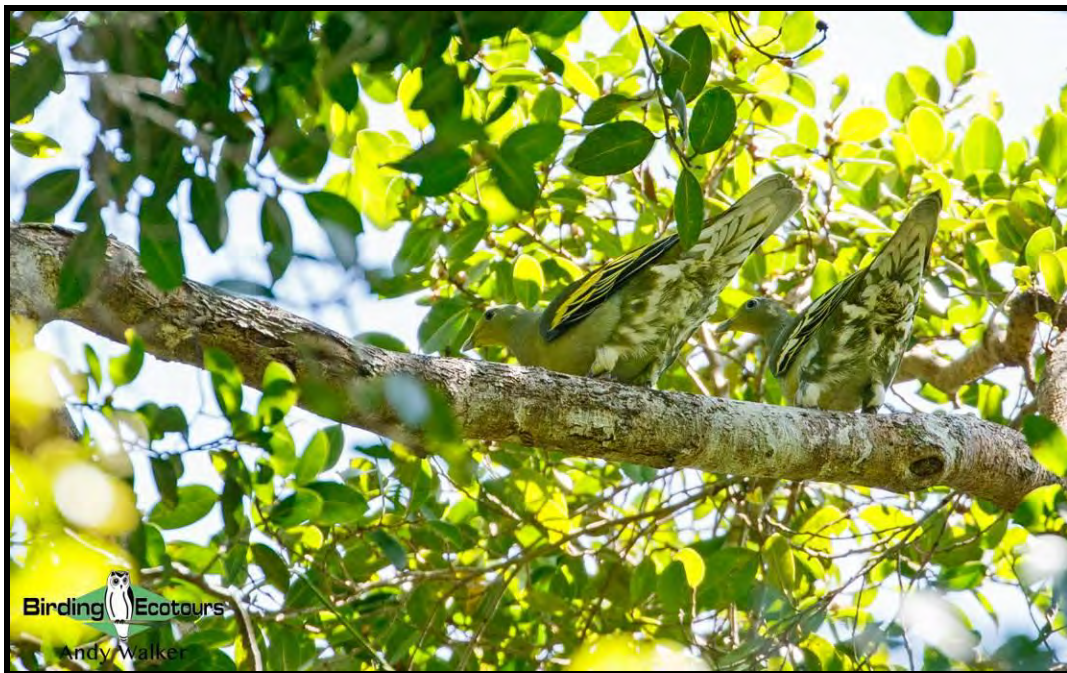
The localized and well-camouflaged Sumba Green Pigeon is a target on the island.

Overnight: Manandang Hotel, Waikabubak Sumba