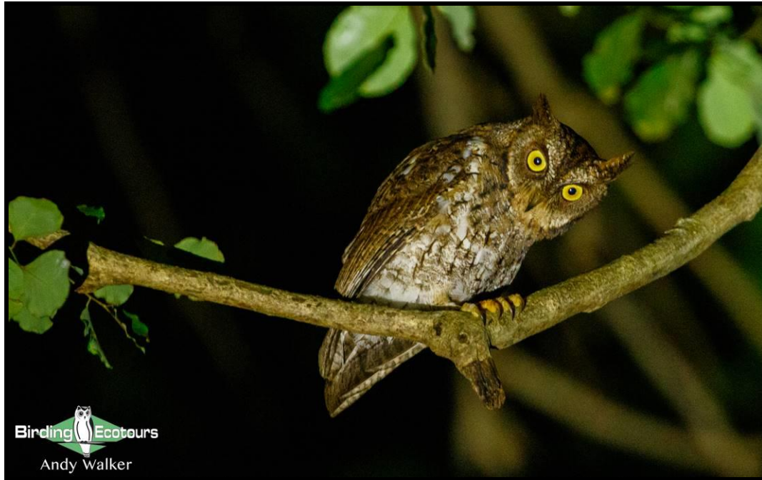
An inquisitive Rinjani Scops Owl peering down at the photographer!