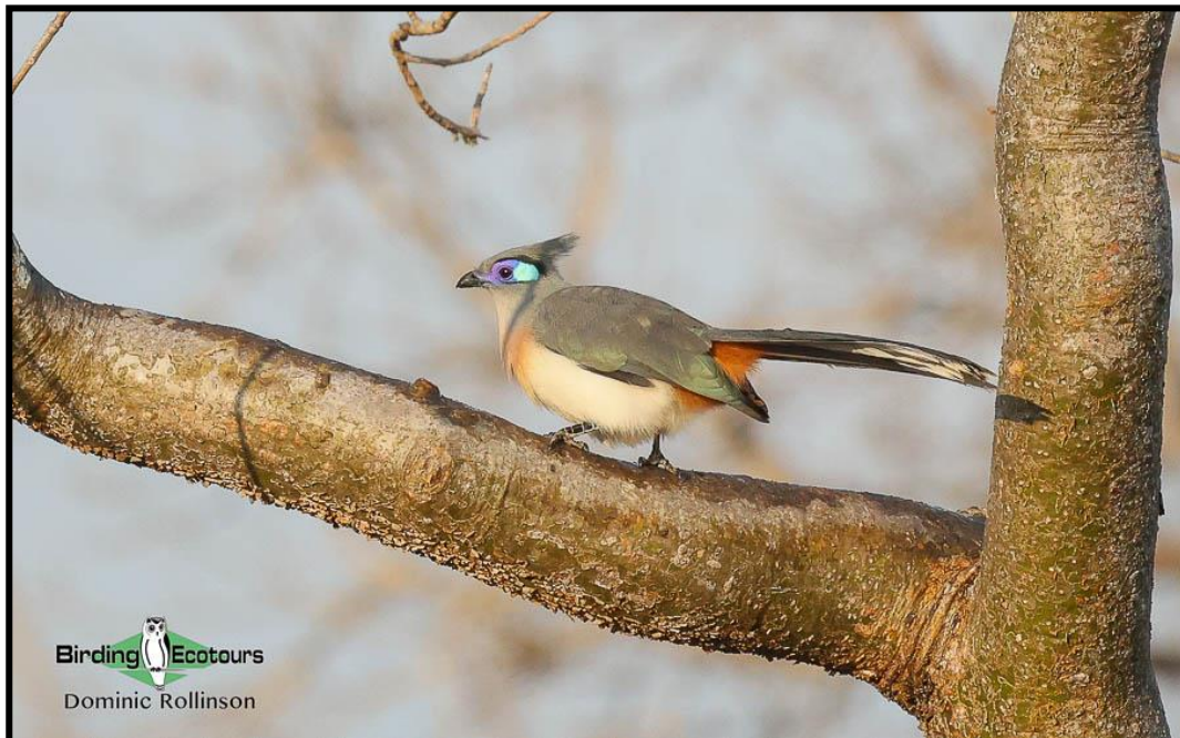
Crested Coua, one of several coua species we are likely to encounter in Berenty Reserve.