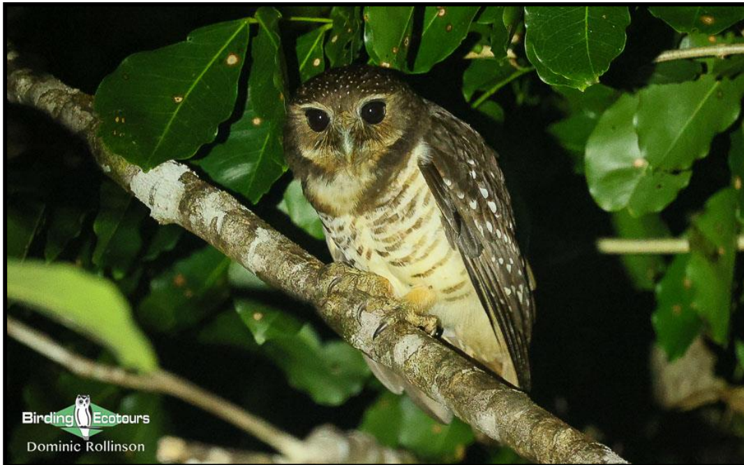
White-browed Owl can be found in Berenty Reserve.

This extension to our Best of Madagascar: 14-day Birding and Wildlife Tour can also be booked as a stand-alone tour. It can also be combined, preceding the main tour, with our Madagascar: 6-day Masoala Peninsula Pre-tour and, preceding that, with our Madagascar: 8-day Northwest (Ankarafantsika/Betsiboka Delta) Pre-tour .