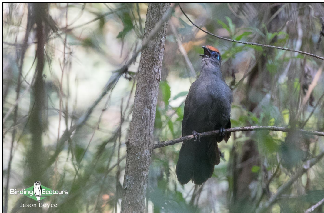
The fantastic Red-capped Coua has a loud and interesting call.