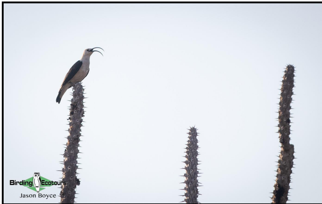
Vangas such this Sickie-billed Vanga will be high on our target list on this tour.