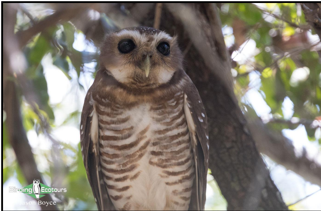
White-browed Hawk-Owl can be found at daytime roosts.

This extension to our Best of Madagascar: 14-day Birding and Wildlife Tour can also be booked as a stand-alone tour. It can also be combined, preceding the main tour, with our Madagascar: 6-day Masoala Peninsula Pre-tour and, preceding that, with our Madagascar: 7-day Northwest (Ankarafantsika/Betsiboka Delta) Pre-tour.