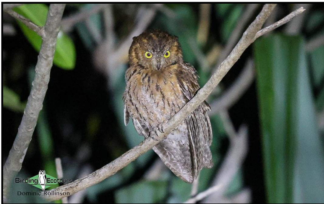
The cute Torotoroka Scops Owl is likely on the Berenty Reserve extension.

Although most famous for its dense lemur population, with hundreds of individuals per square kilometer (research on lemurs has been ongoing here for more than three decades), Berenty Reserve is also a haven for birdwatchers, boasting a high number of endemic species. With luck we might be able to find Madagascar Sandgrouse , Madagascar Green Pigeon , Torotoroka Scops Owl , and perhaps even Madagascar Cuckoo-Hawk .