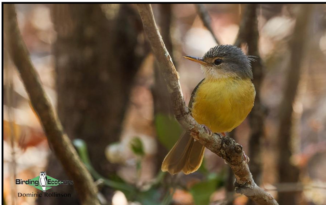
The range-restricted Appert's Tetraka can be seen in Zombitse National Park.