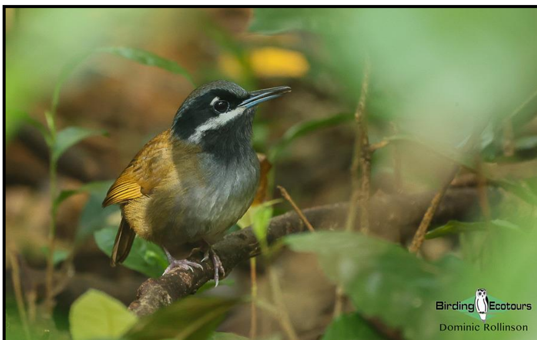
Crossley's Vanga is one of the many vanga species we are likely to see on this tour.