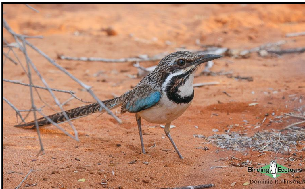
Long-tailed Ground Roller occurs in the spiny forest near Isalo.

Overnight: Arboretum d'Antsokay, near Toliara