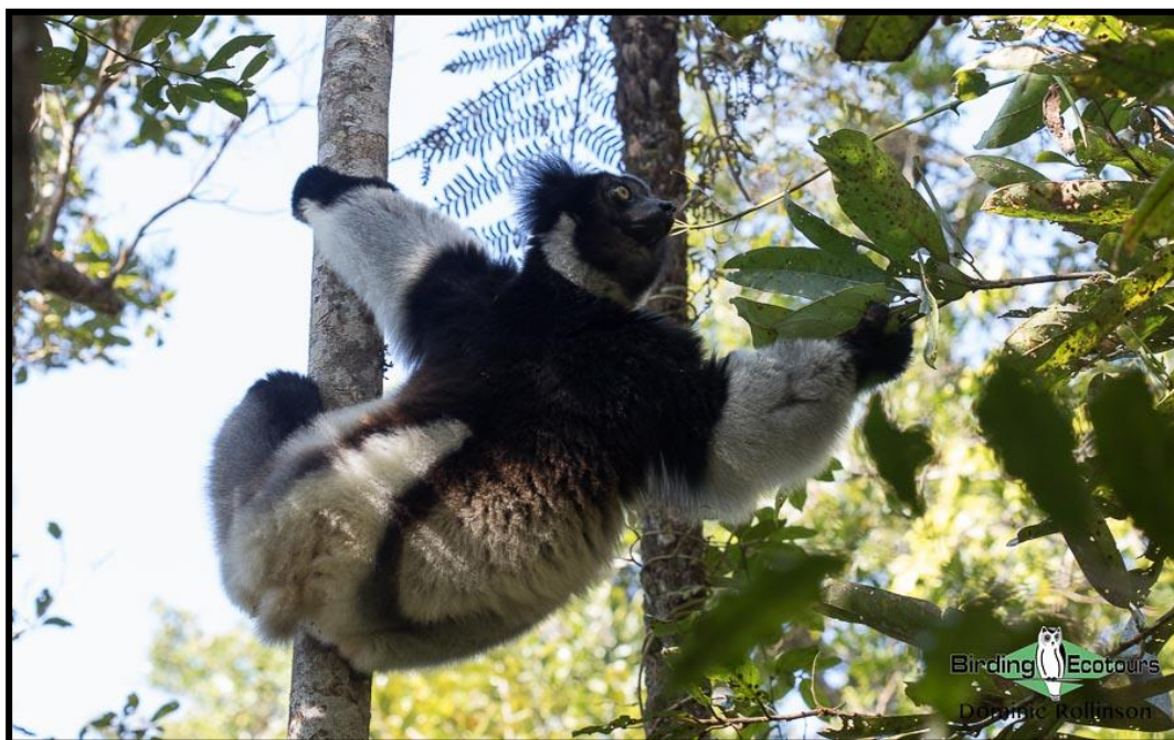
Indri, Madagascar's largest lemur species.

Madagascar, our world's fourth-largest island is, quite simply, unique. Four bird families and five mammal families (including the lemurs) are endemic to this massive island, and half the world's chameleons, along with weird and wonderful endemic plant families, and tons of other wildlife can all be found here. An astonishing 120 bird species are endemic – including such exotic groups as vangas, ground rollers, Cuckoo-roller , couas, asities, and mesites. Lemurs vie for attention, from the tiny mouse lemurs to the marvelous sifakas and the amazing Indri with its deafening calls that resound through the forest. Our tour visits a range of habitats: grasslands, dry deciduous woodland, the bizarre spiny forest with its odd octopus trees ( Didiera madagascariensis ) and elephant's foot trees ( Pachypodium rosulatum ), lush eastern rainforest, as well as lagoons and mudflats. The birds that we'll look for include the roadrunner-like Long-tailed Ground Roller and the stunning Pitta-like, Scaly, and Rufous-headed Ground Rollers as well as the highly prized Subdesert Mesite , the unforgettable Giant Coua , the astounding Velvet Asity , and Madagascar Ibis , to name just a handful. We invite you to join us on a special tour to an amazing island!