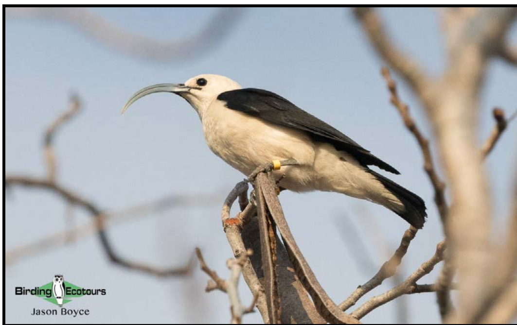
Sickle-billed Vanga is a target near Ifaty.