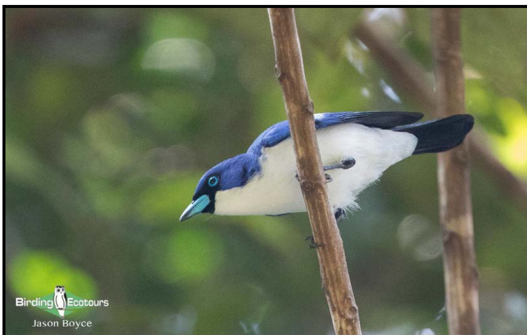
An inquisitive Blue Vanga .