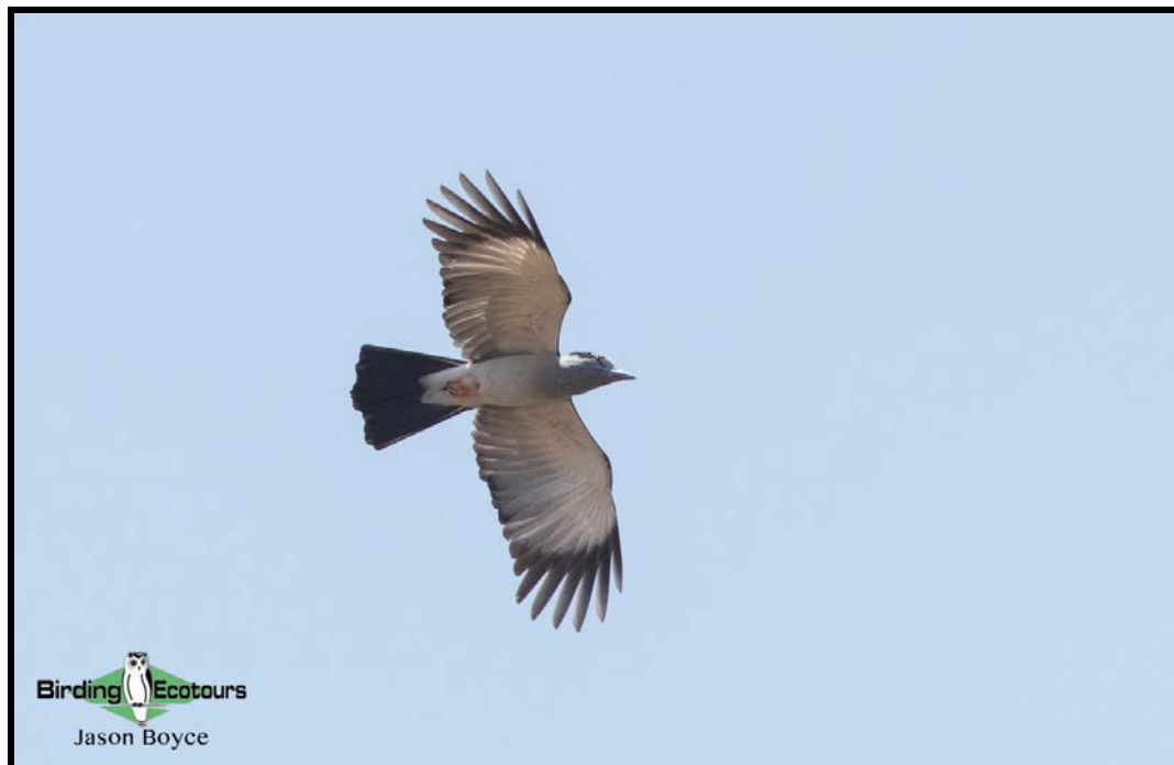
The incomparable Cuckoo Roller.