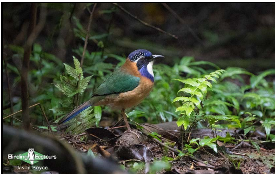
The incredible Pitta-like Ground Roller.