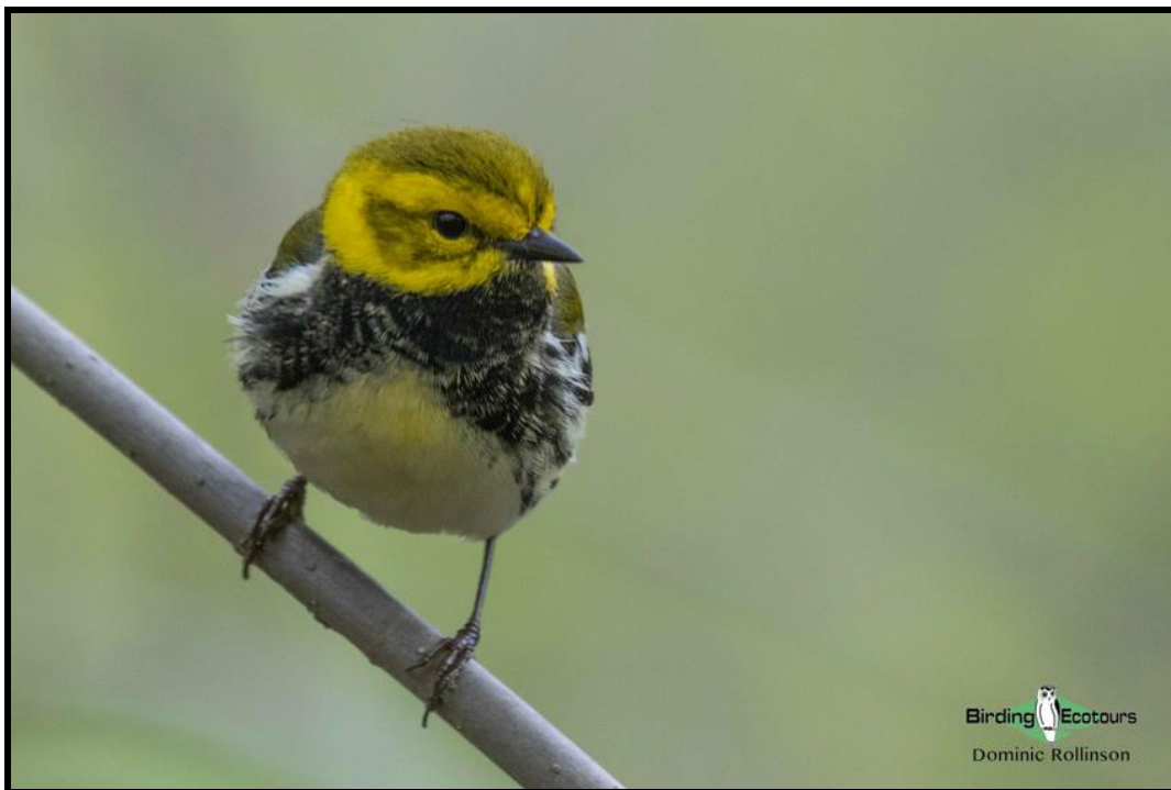
Black-throated Green Warbler is one of many wood warblers we should see on this tour.

Today concludes what was surely a fantastic tour full of many highlights. If time permits, there may be a chance for a brief morning birding session at Scarborough Marsh or another nearby location before checking out of the hotel and transferring to the Portland airport.