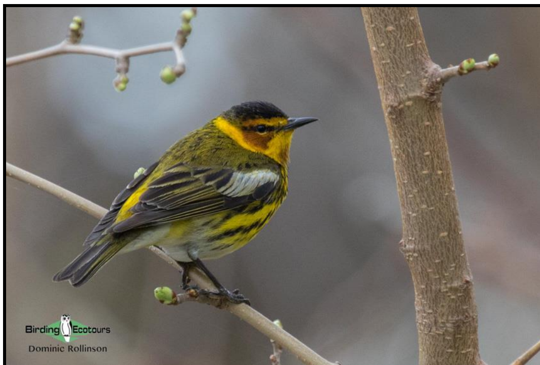
The delightful Cape May Warbler.