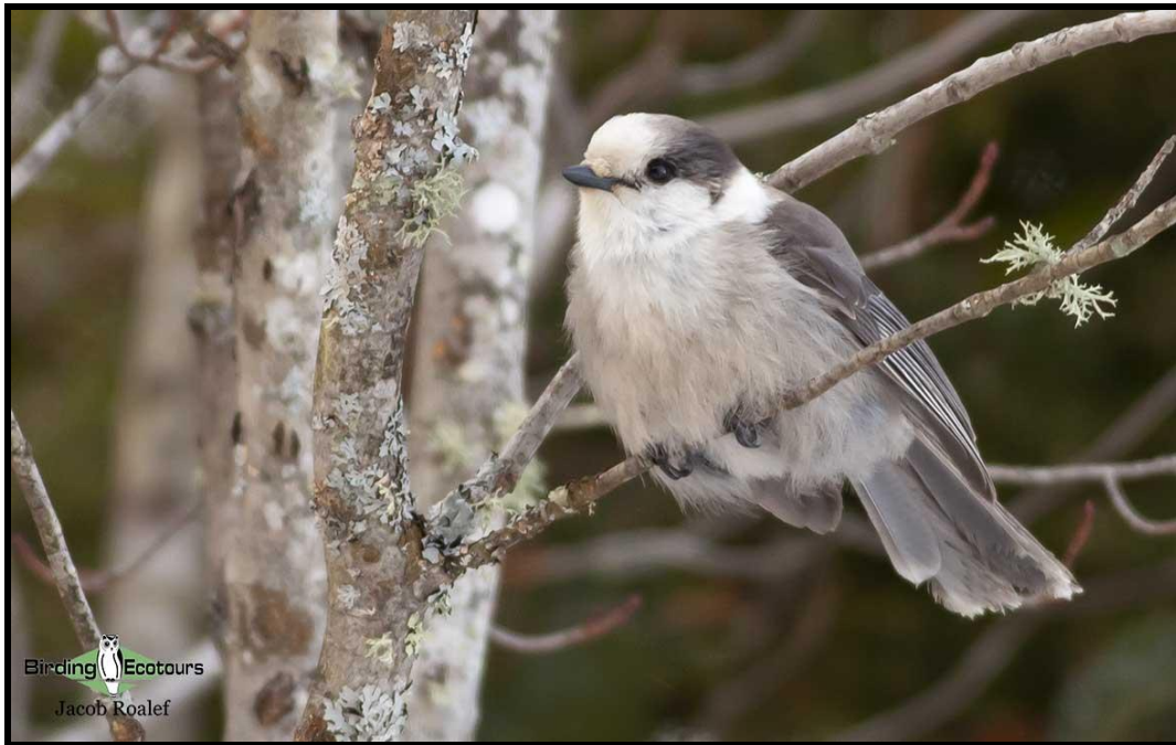
The adorable Canada Jay is one of the boreal species we hope to encounter.

and great breeding birds. This New England birding and wildlife holiday might also generate some non-avian finds, such as Ocean Sunfish, Grey Seal, Humpback, Fin and Common Minke Whales, American Beaver, North American Porcupine, American Black Bear and Moose.