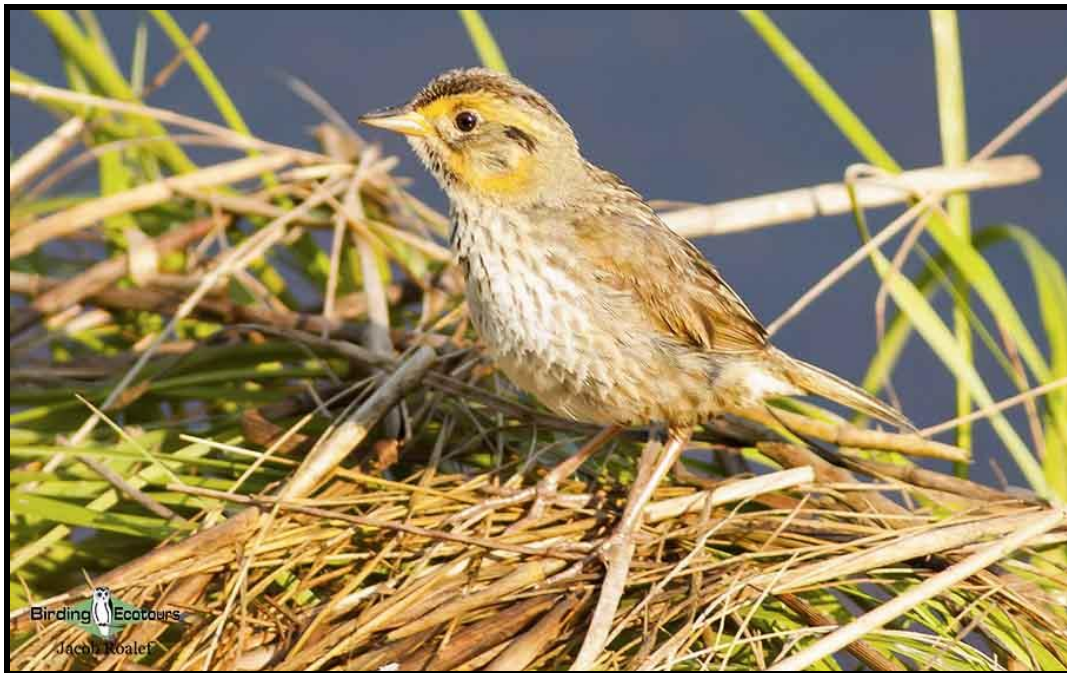
The striking Saltmarsh Sparrow is always a real treat to see.

Maine (and the northeast region of the United States in general) offers a great mixed bag of birding through its diverse habitats and high latitude location. Many migrant species call this area their home in the summer as they stake out territories and breed. The overlap between the more southern breeders and northern breeders is rarely seen elsewhere, meaning Maine offers a unique chance of some fantastic birding generating some good lists. The habitats on display range from coastal saltwater marshes to sandy-plains grasslands, high altitude mountain tops of the Appalachians , expansive boreal forests, and unique clusters of offshore islands inhabited by puffins and other charismatic wildlife. Each habitat contains its own picturesque beauty along with key bird species to see. This nine-day tour explores the best this region has to offer. On this tour, we focus on Maine, but also foray into New Hampshire and time-permitting into Vermont.