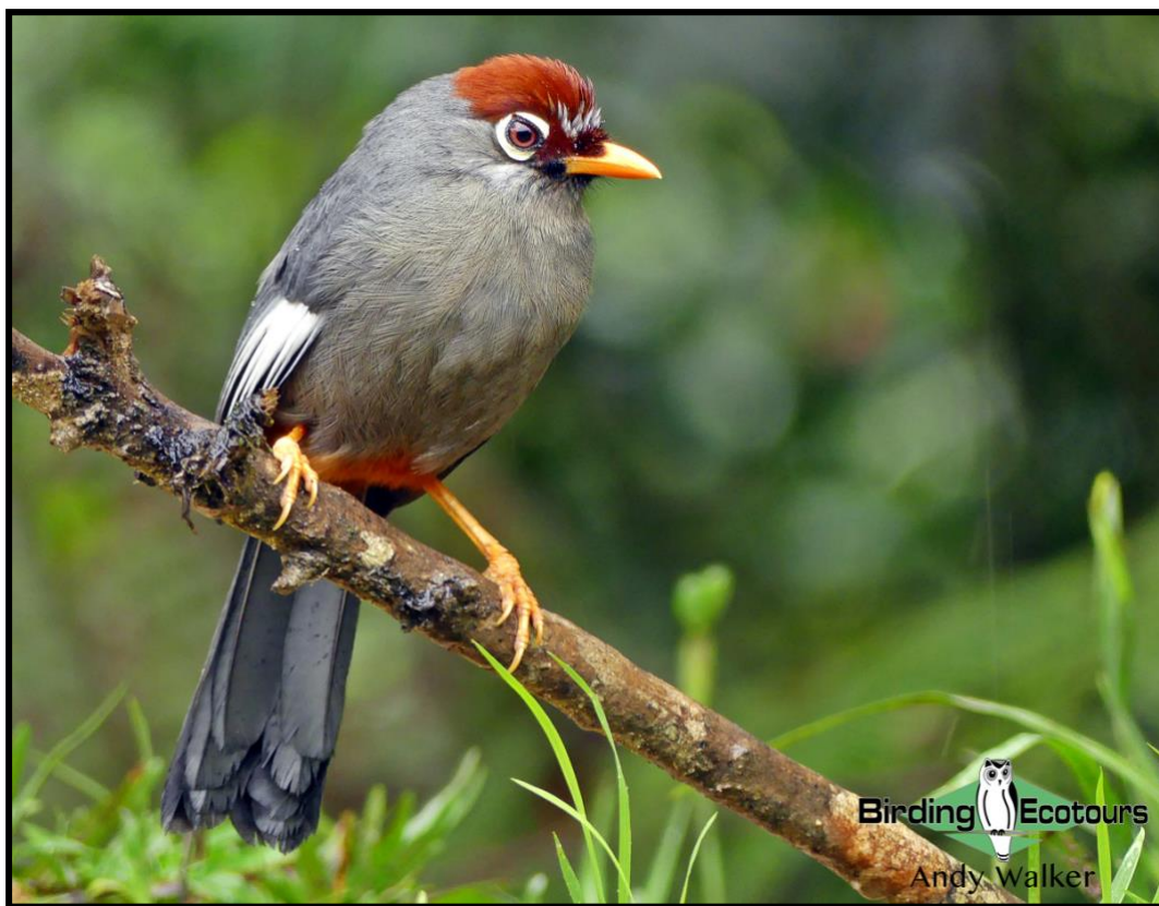
One of several laughingthrushes possible around Fraser's Hill, the beautiful Chestnut-capped (Spectacled) Laughingthrush