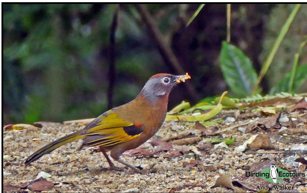
The near-endemic Malayan Laughingthrush will be on the cards at Fraser's Hill.

range of interesting nocturnal birds in the evening (as mentioned for day 5). We will target the endemic Malayan Whistling Thrush , which will require a pre-dawn start and will then lead into the dawn chorus, where we will pick up numerous new birds such as Large Niltava , Slaty-backed Forktail , Streaked Wren-Babbler , and many more. We will also look for a couple of other important targets, namely the near-endemic pair of Malayan Partridge and Malayan Laughingthrush , and the tough, secretive, and subtly beautiful Rusty-naped Pitta .