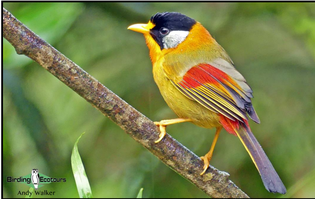
Silver-eared Mesia is spectacular and should give some great views at Fraser's Hill.