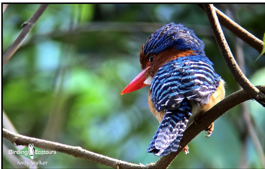
The striking Banded Kingfisher can often be found around our hotel grounds.

Our birding sessions within the national park will give us ample opportunities for numerous amazing birds. In addition to those outlined above we will also seek out Great Argus, Crested Partridge, Crested Fireback, Garnet Pitta, Crested Jay, Black Magpie, Asian Fairy Bluebird, Black-and-yellow Broadbill, Green Broadbill, Great Slaty Woodpecker, White-bellied Woodpecker, Buff-rumped Woodpecker, Buff-necked Woodpecker, Indochinese Blue Flycatcher, Malaysian Blue Flycatcher, Blue-banded Kingfisher, Oriental Dwarf Kingfisher, Ruddy Kingfisher, Stork-billed Kingfisher, Blue-eared Kingfisher, Banded Kingfisher, Rufous-collared Kingfisher, and Red-bearded Bee-eater , plus plenty more hornbills, orioles, malkohas, and pigeons ( Jambu Fruit Dove is a stunner!).