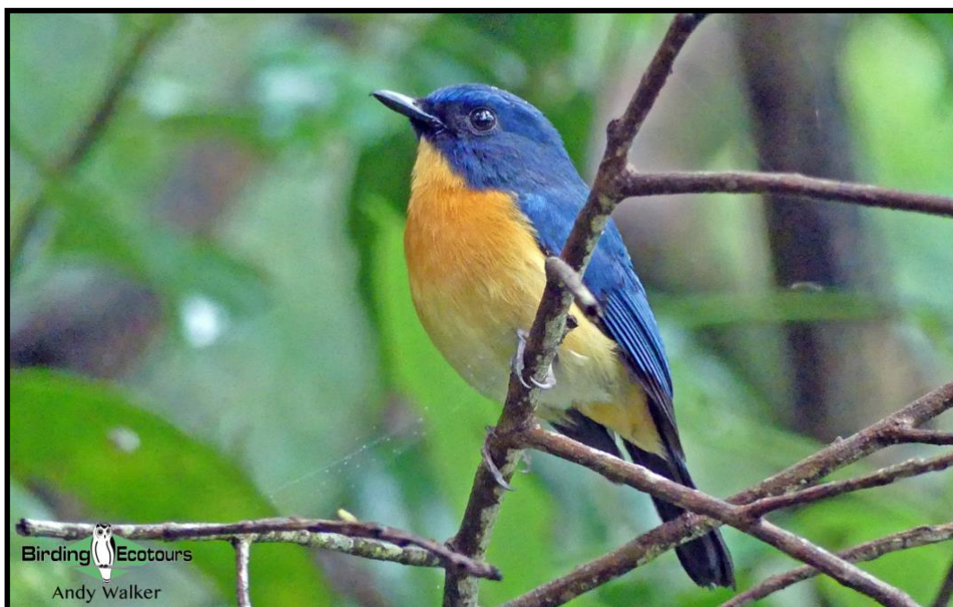
Mangrove Blue Flycatcher will be one of our targets in the Kuala Selangor area.