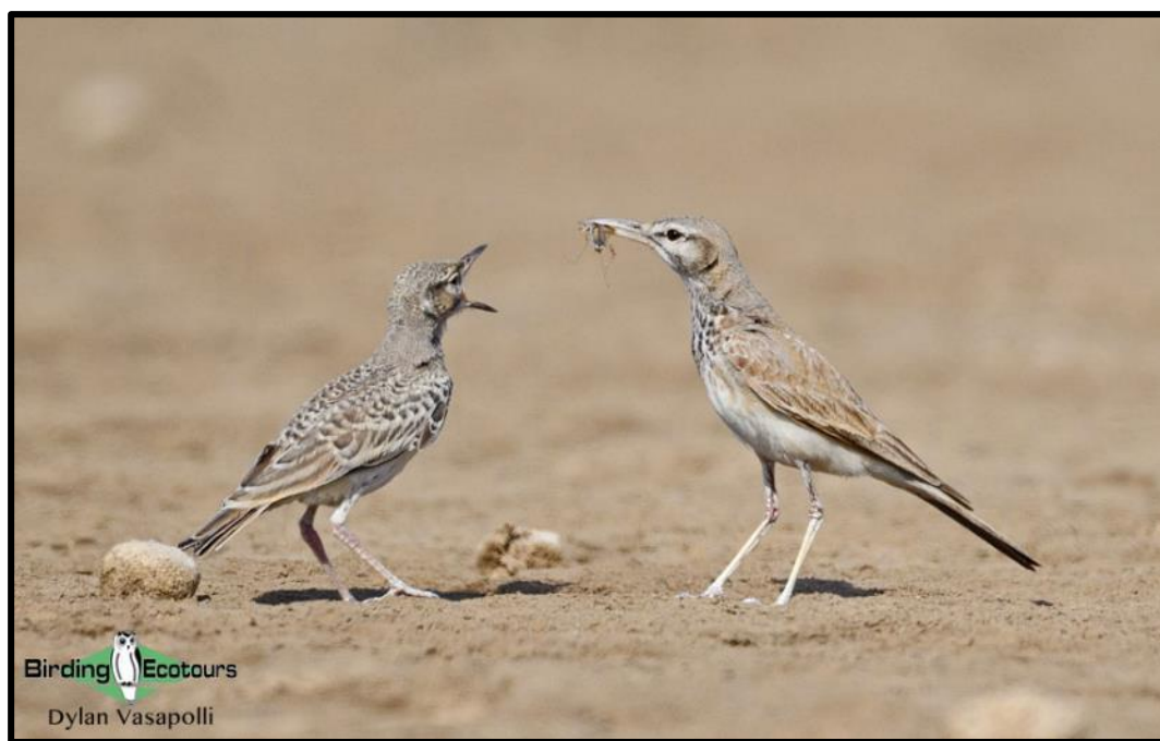
Greater Hoopoe-Lark is a highly sought-after and tough target in the desert.

As we move deeper into the desert some really special birds become possible, including Desert Sparrow , Greater Hoopoe-Lark , Thick-billed Lark , Temminck's Lark , Bar-tailed Lark , Dunn's Lark , Tristram's Warbler , and with luck, the increasingly rare Houbara Bustard , a species which has declined rapidly due to pressure from hunting. We will also target other exciting species such as Egyptian Nightjar , multiple sandgrouse species, Cream-colored Courser , Pharaoh Eagle-Owl , Long-legged Buzzard , and much more. Here we will also look for the Streaked Scrub Warbler , a prized monotypic family.