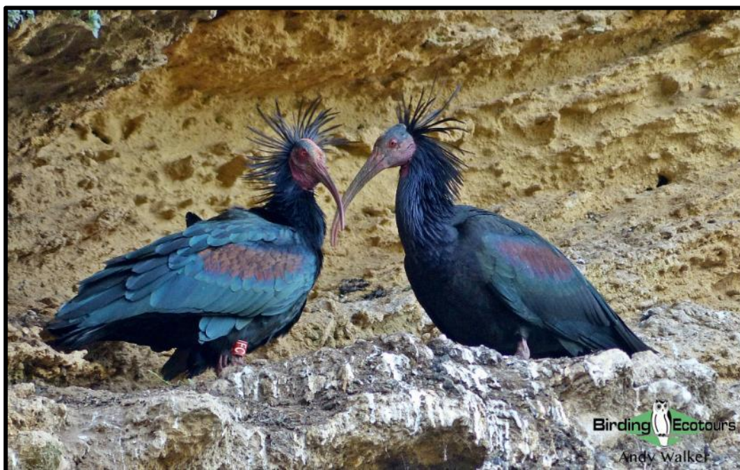
The Northern Bald Ibis is one of the world's rarest species, and arguably one of its most strange-looking.

After lunch we will head north to the remote coastal areas around Tamri. Here we will come across many species we have seen previously, but the real purpose of our visit is to find the bizarre-looking Northern Bald Ibis . This Endangered ( BirdLife International ) species is one of the world's rarest birds, with Morocco holding 95% of the current wild population, or an estimated 700 birds.