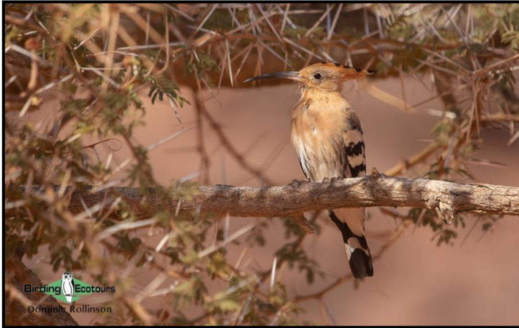
The charismatic Eurasian Hoopoe is likely to be seen on this tour.