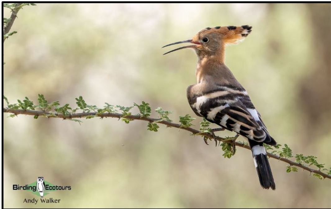
The charismatic Eurasian Hoopoe is likely to be seen on this tour.

Overnight: Hotel Yasmina , or similar, Merzouga