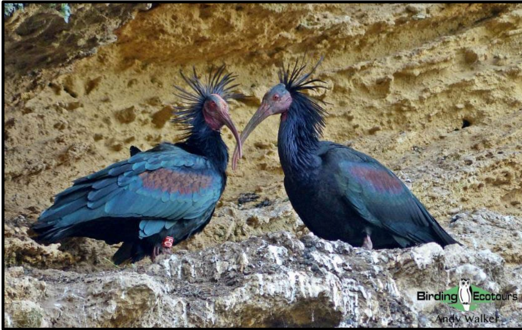
The Northern Bald Ibis is one of the world's rarest species, and arguably one of the most strange-looking.

Overnight: Hotel Petit Palace , or similar, Agadir