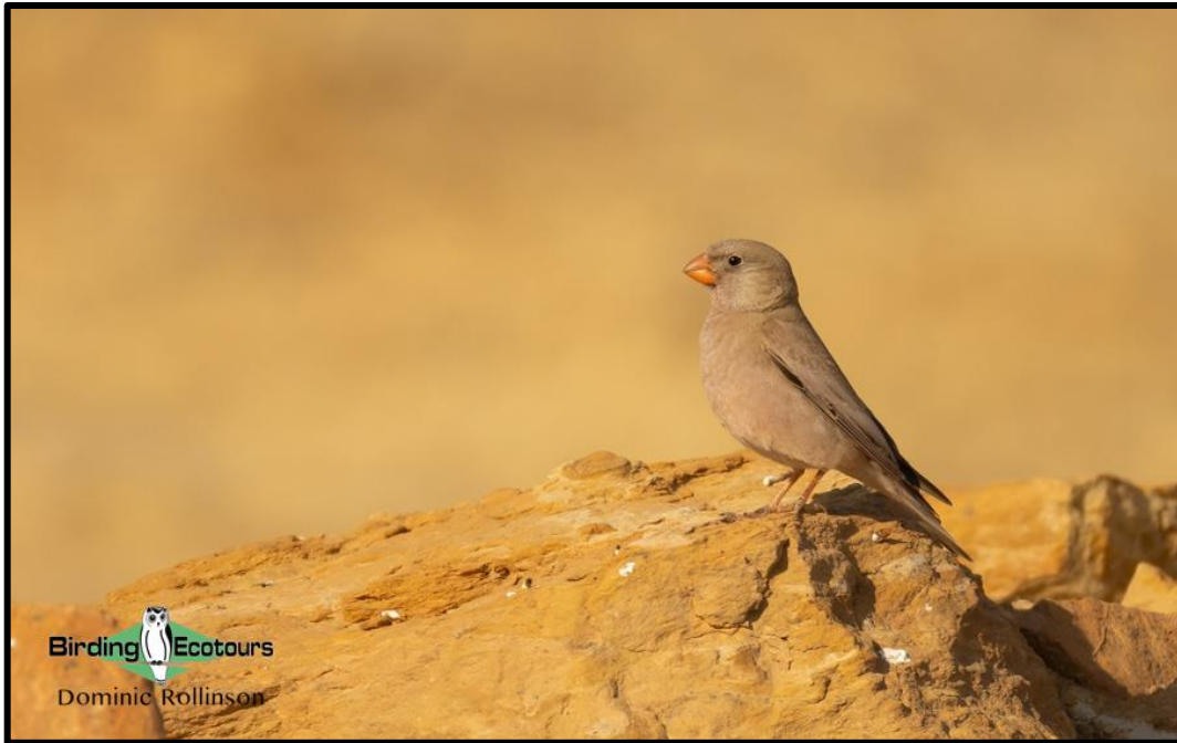
The attractive Trumpeter Finch is named after its trumpet-like song.

Overnight: Meteorites Boulajoul Hotel , or similar, Zaida