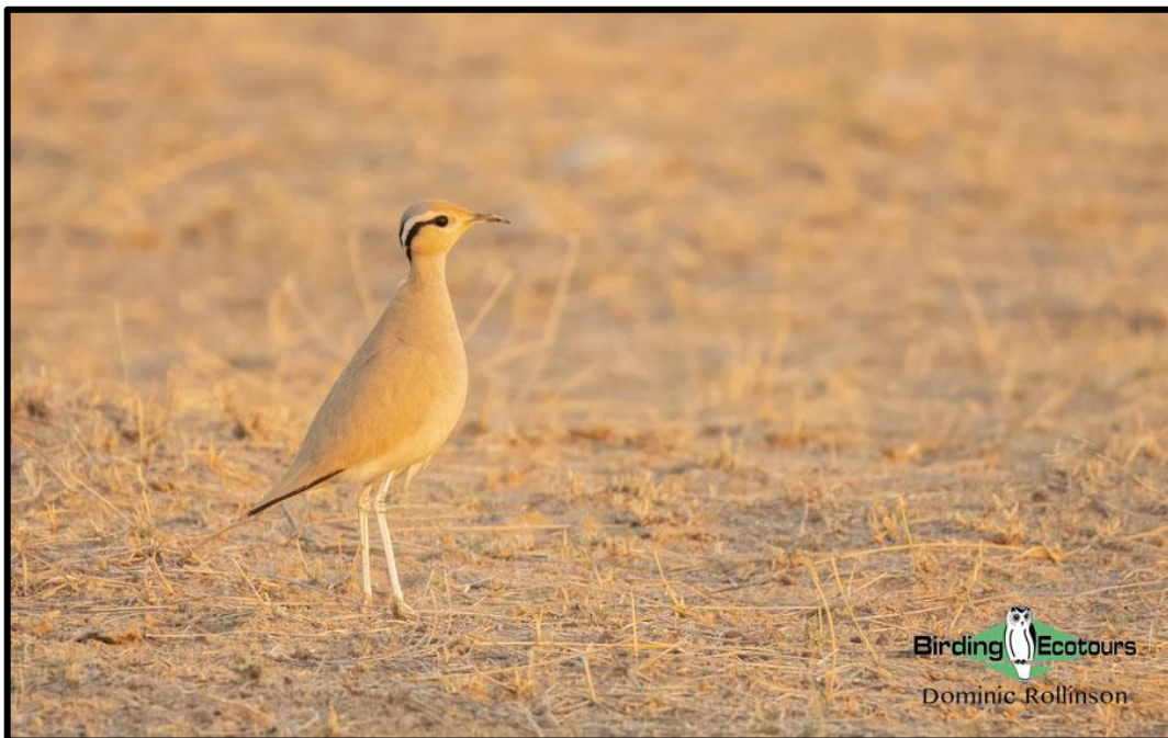
Cream-colored Courser is yet another desert special we will look for in Morocco.

Today we will make the long drive back across central Morocco towards Ouarzazate , a stunning town and fortress in the foothills of the Anti-Atlas Mountains, famous for appearing in Game of Thrones , Gladiator , and many other films and TV shows! During our five-hour journey we will stop for birding and we should find common scrub species like Great Grey Shrike, White-crowned Wheatear , and others mentioned previously.