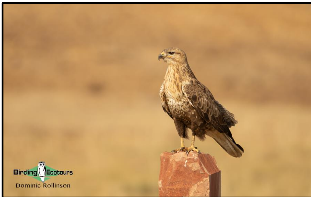
Long-legged Buzzard is another raptor species to keep an eye out for in Morocco.

From the flat plains of Marrakesh, we turn back uphill, and drive to Boumalne du Dades via the famous Tizi-n-Tichka Pass at 7,414 feet (2,260 meters), which is a spectacular drive and is sure to be an enjoyable experience. At the pass we will try for Tristram's Warbler , another regional endemic. This species has very specific habitat requirements away from its wintering grounds and it is not always an easy bird to find, but we are working with great local guides that understand this species and will put in the effort required. As the road climbs into the hills, we should start to see raptors such as Bonelli's Eagle and Long-legged Buzzard , and hirundines like Eurasian Crag Martin , Western House Martin , European Red-rumped Swallow , along with Eurasian Hoopoe , Woodchat Shrike , and Thekla's Lark .