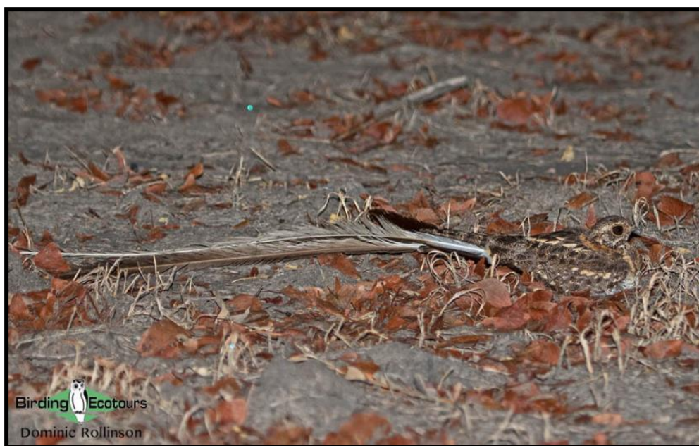
The spectacular Pennant-winged Nightjar can be seen breeding around Katima Mulilo.

Overnight: Caprivi Houseboat Safari Lodge or similar, Katima Mulilo