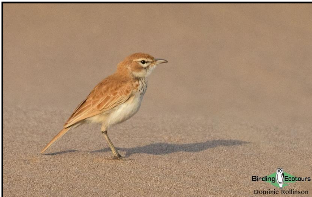
Dune Lark, Namibia's only endemic bird, should be seen around Walvis Bay.