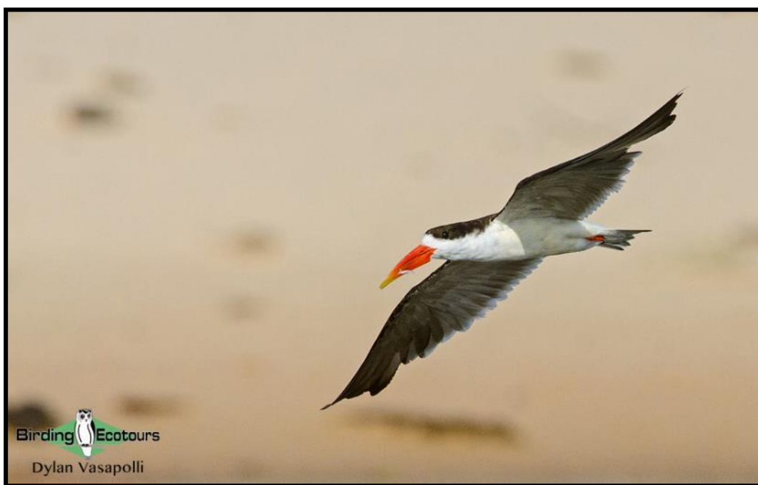
African Skimmer is regular around the Okavango Panhandle.

Overnight: Mahangu Safari Lodge or Ndhovu Safari Lodge , Divundu